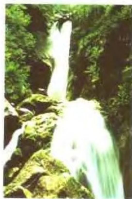
飞瀑 Flying waterfall