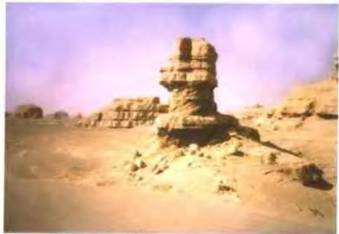
各种形态的雅丹地貌 Yardang landforms