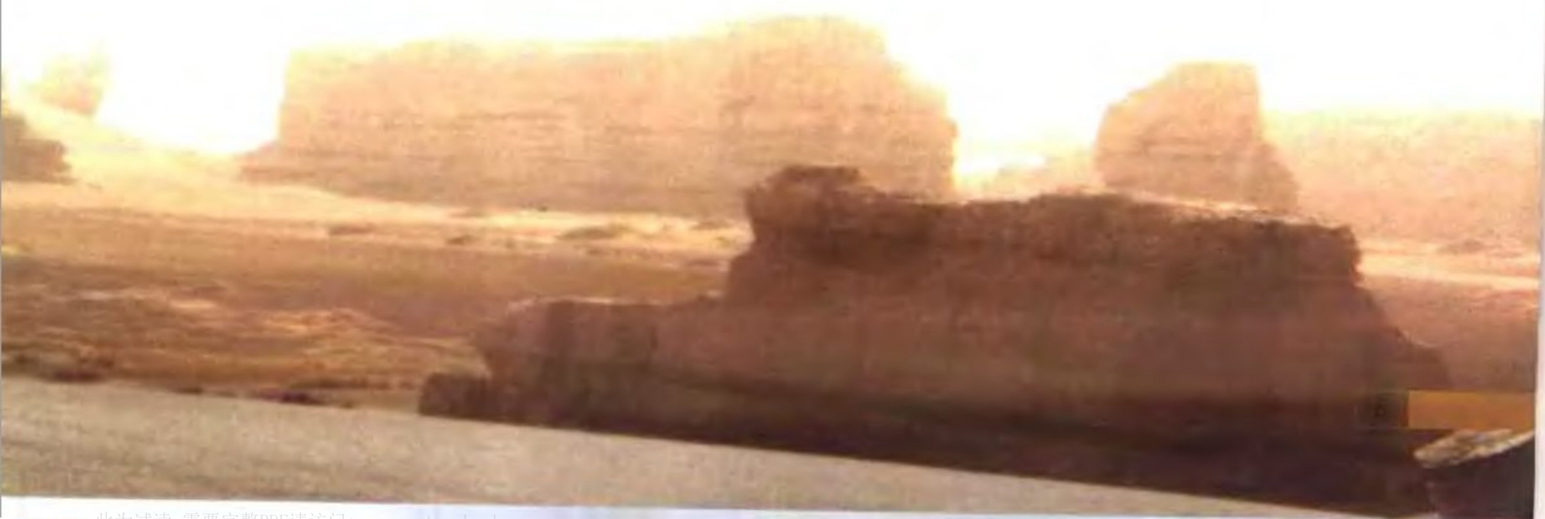
神秘的堡状地貌 Mysterious castle landforms