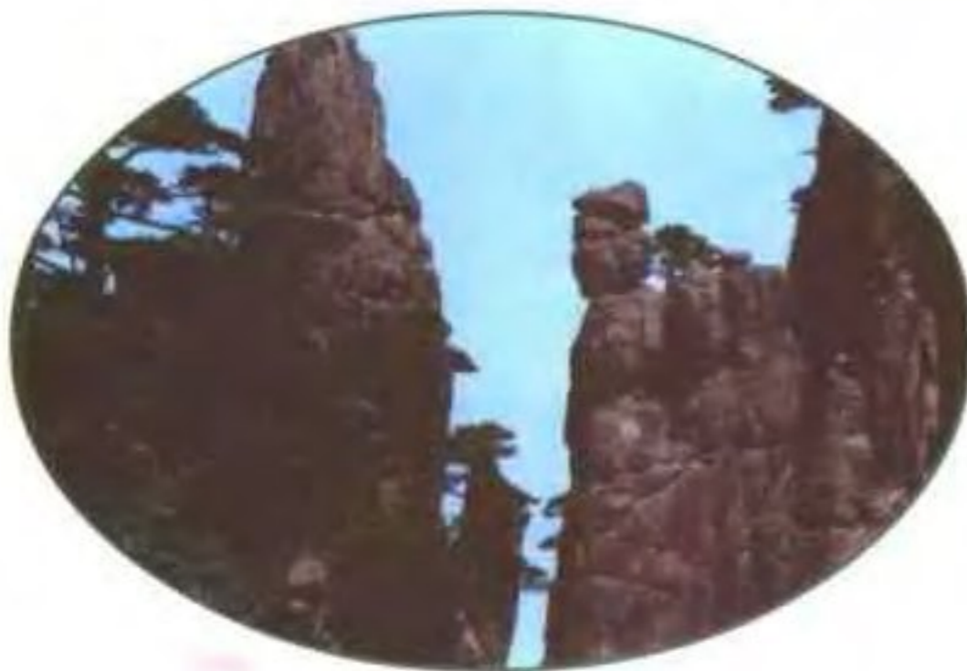
云海峭峰 Steep peaks in cloud sea