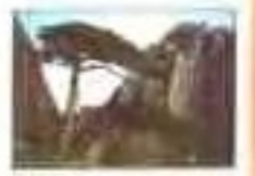
各种峰林地貌 Peak forests of grotesque shapes