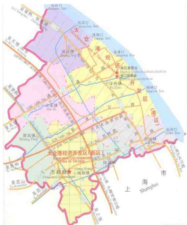
行政区划图 Map of the Jurisdiction of Taicang

辖太仓港经济开发区（港区、新区）、7个镇、90个行政村、3483个村民小组、68个居民委员会。全市户籍人口46.6万人，到年底在册流动人口39.9万人。