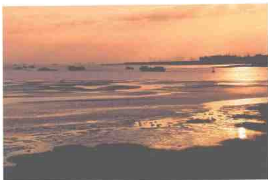
晨曦 First Sunray in the Morning

太仓港口岸长38.8公里，其中深水岸线25公里，是距长江入海口最近的港口。岸线基本平直且边滩稳定，终年不冻不淤，深水区开阔、稳定，能满足5万吨级船舶回转水域的要求，是长江下游地区的“黄金岸线”。