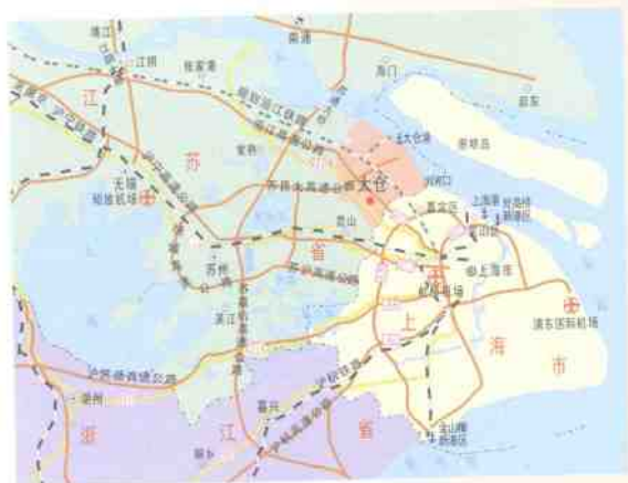
太仓区位图 Map of Location of Taicang