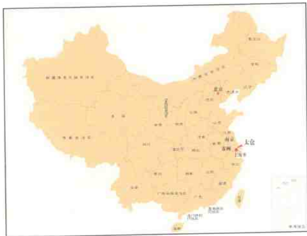
太仓地理位置图 Map of Geographical Location of Taicang