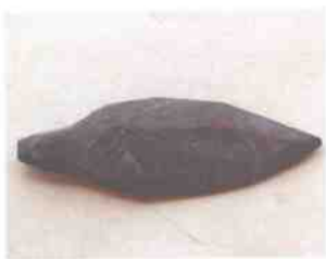
石箭镞（良渚文化时期，距今4500年） Stone Arrow (Liangzhu Civilization Period, 4500 years ago)

现今，太仓特色文化精彩纷呈，有全国桥牌之乡、武术之乡、龙狮之乡、民乐之乡、舞蹈之乡等称号。