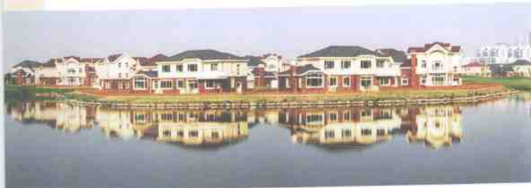
城市新貌 Newlook of Taicang