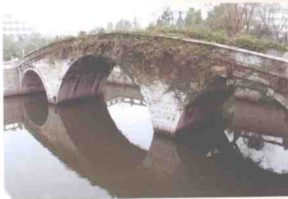
元代古桥 Ancient Bridge in Yuan Dynasty