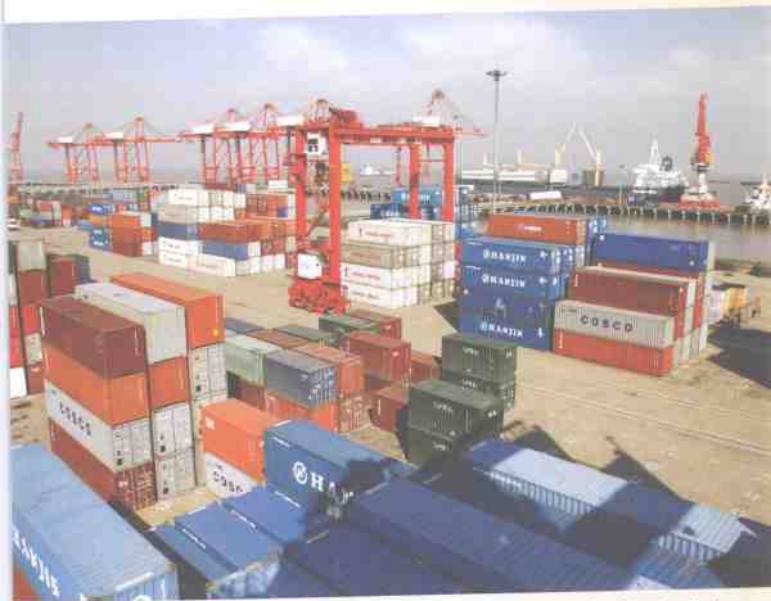
太仓港集装箱码头 Taicang Harbor Container Berth