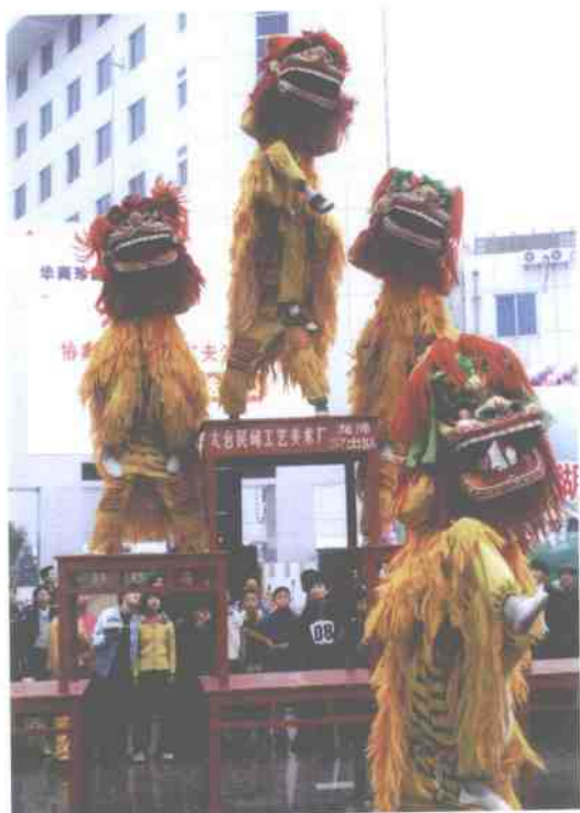
舞狮表演 Dragon Dancing

太仓自古以来文化艺术大家灿若群星，有明清文豪王世贞、吴伟业，复社领袖张溥，明四家之一仇英，娄东画派王时敏、王鉴、王原祁，著名教育家暨交通大学创始人唐文治，当代画家朱屺瞻、宋文治和中国新舞蹈艺术奠基人吴晓邦等。