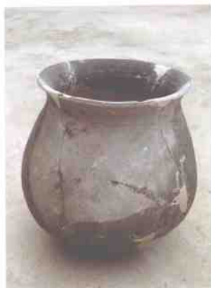
几何印纹灰陶罐（马桥文化时期，距今3800年） Geometry Mark Gray Pot (Maqiao Civilization, 3800 years ago)