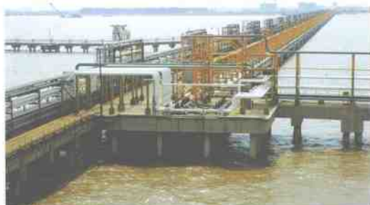
太仓港码头 Berth Special for Taicang Port