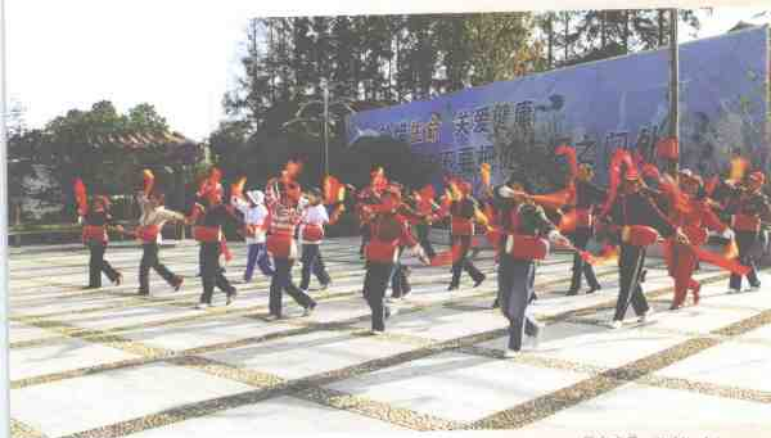
群众文艺 Public Art