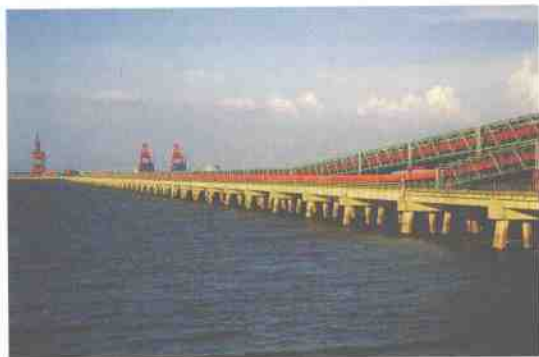
港口专用码头 Berth Special for the Port