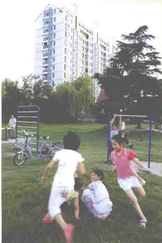
快乐童年 Happiest Childhood