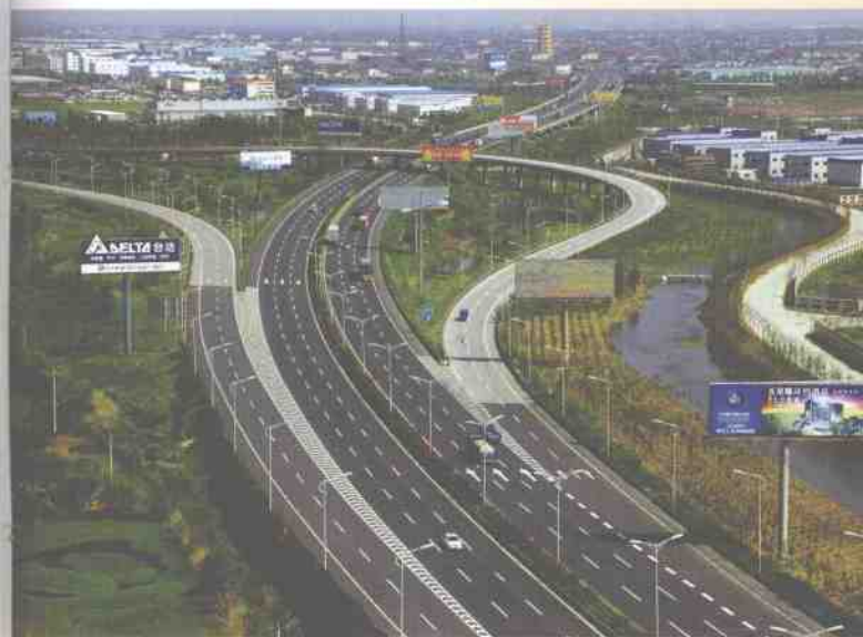
高速公路网 Expressway Net