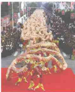
龙腾之乡2008米巨龙 2008-meter-long Huge Dragon

The Stele of Developing the Relationship with Foreign Countries