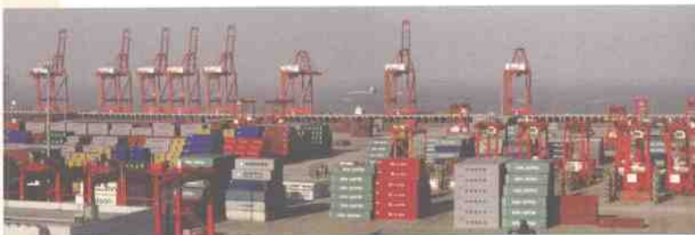
繁荣的太仓港集装箱码头 Flourishing Container Berth in Taicang