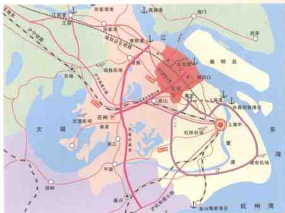
太仓区位优势图 Map of Location of Taicang