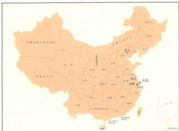
太仓地理位置图 Map of Geographical Location of Taicang