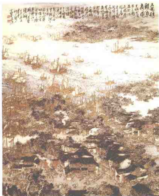
六国码头图 Foreign Trade Berth

现今，太仓特色文化精彩纷呈，有全国桥牌之乡、武术之乡、龙狮之乡、民乐之乡等称号。