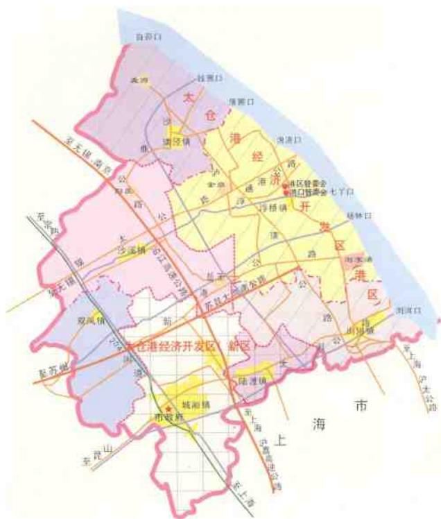
行政区划图 Map of the Jurisdiction of Taicang

辖太仓港经济开发区（港区、新区）、7个镇、90个行政村、3483个村民小组、67个居民委员会。总人口90万人，其中户籍人口46.38万人，暂住人口43.64万人。