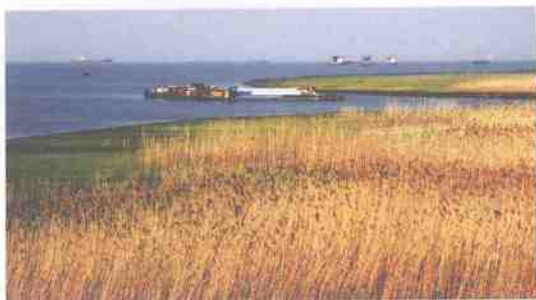
江边湿地 Everglade along the Yangtze River

太仓港口岸长38.8公里，其中深水岸线25公里，是距长江入海口最近的港口。岸线基本平直且边滩稳定，终年不冻不淤，深水区开阔、稳定，能满足5万吨级船舶回转水域的要求，是长江下游地区的“黄金岸线”。