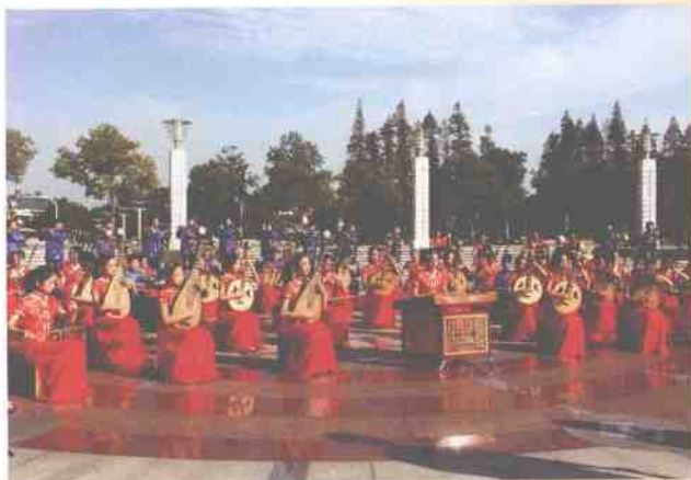
江南丝竹演奏 Performance of Jiang Nan Si-zhu