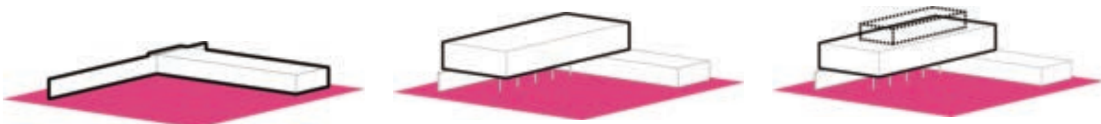
分解图 EXPLODED DIAGRAM