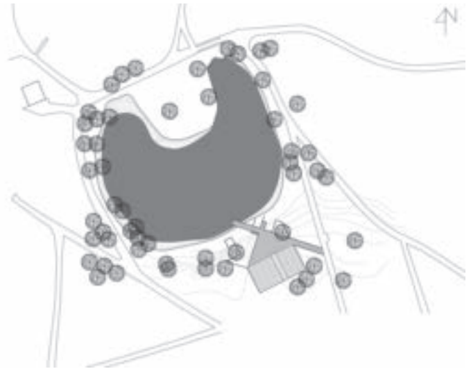
总平面图 SITE PLAN

The outdoor theater stage is built especially for plays during the summer. Its main architectural goal is to create a closed, comfortable and intimate space that forms an immediate connection with the audience and the actors. The architecture frames the landscape in a way that the park, trees and the pond become an integral part of the stage-set.