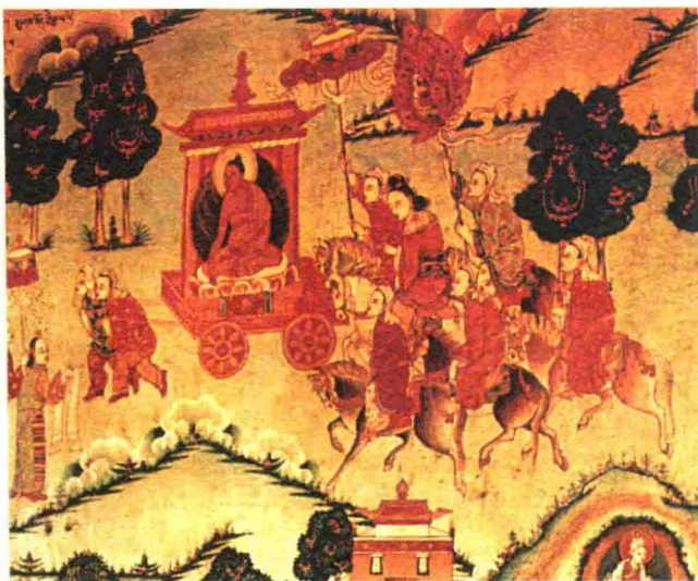
• 西藏大昭寺内描绘文成公主进吐蕃的壁画 A Mural Painting in Jokhang Monastery, Tibet, Depicting a Scene When Princess Wencheng was Welcomed in Tubo (Ancient Tibet)

In order to keep the border trade in an orderly manner and more importantly to maintain the dignity and authority of the Song Empire, the Song Government specifically instituted an agency named “Office for the Administration and Inspection of Tea Trade” to supervise the tea-horse mutual trade. As tea had already become a stable food item for the Tibetans, it was cherished by the Tibetans “as their life, and they would get sick or even die if they were deprived of tea”. As far as the Song Government was concerned, since tea played such an important role in Tibetan’s life, controlling the supply chain would tantamount to controlling the lifelines of Tibet. Hence the tea-horse mutual trade naturally played a crucial role in safeguarding the security and stability of the southwest frontier region.