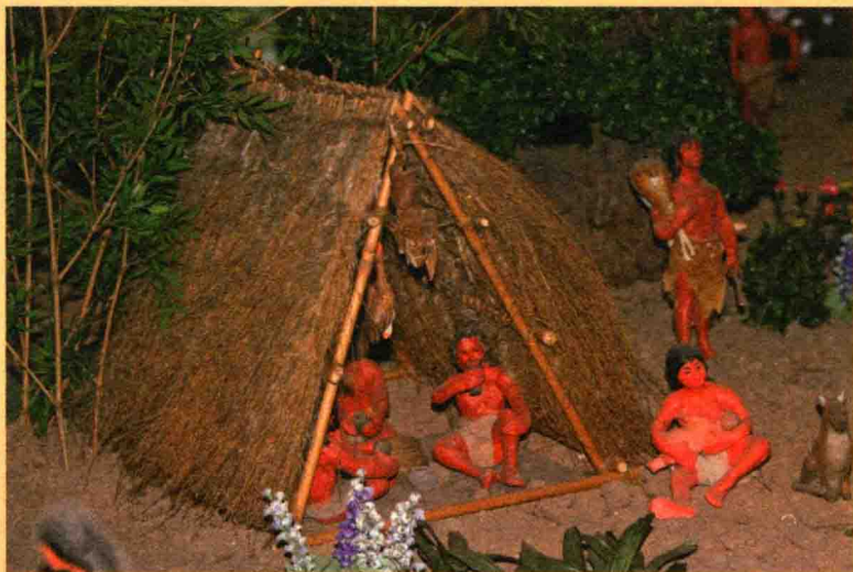
• 史前村落模型 Prehistoric Settlement Model

仰韶文化是黄河中游地区重要的新石器时代文化，于1921年在河南省三门峡市渑池县仰韶村被发现。仰韶文化的持续时间大约在公元前5000年至前3000年，它向人们展示了中国母系氏族制度繁荣至衰落时期的社会结构和文化成就。