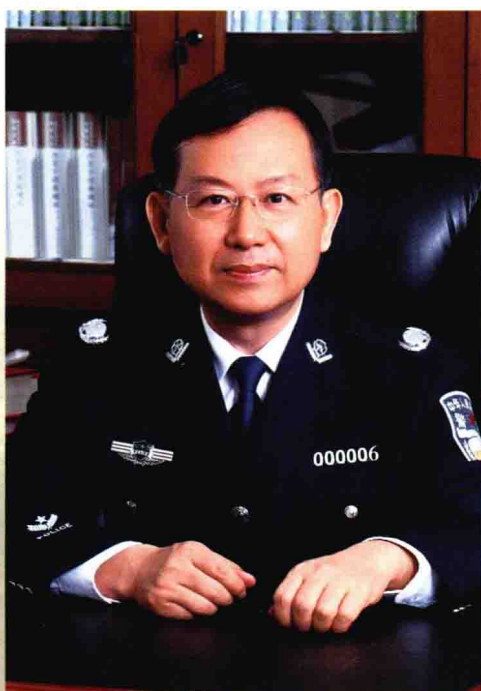
副部长 黄明 Mr. Huang Ming, Vice Minister of Public Security