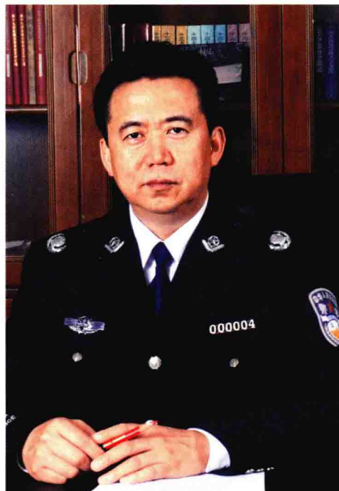
副部长 孟宏伟 Mr. Meng Hongwei, Vice Minister of Public Security