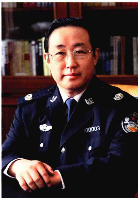
副部长 傅政华 Mr. Fu Zhenghua, Vice Minister of Public Security