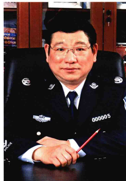
副部长 陈智敏 Mr. Chen Zhimin, Vice Minister of Public Security