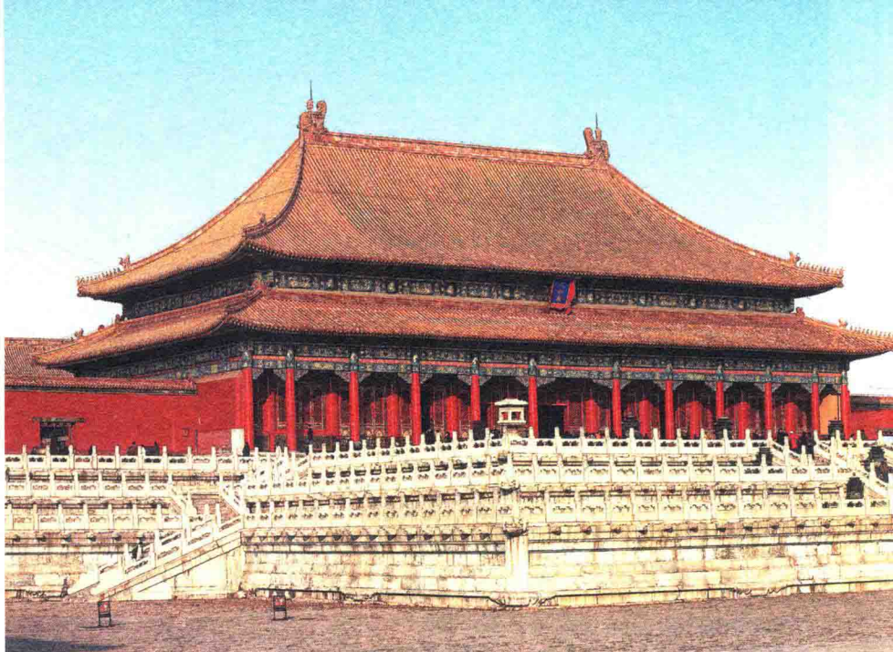
• 故宫太和殿 Hall of Supreme Harmony in the Imperial Palace