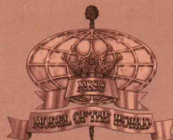
< 2005-2006 中国 深圳 SHENZHEN CHINA