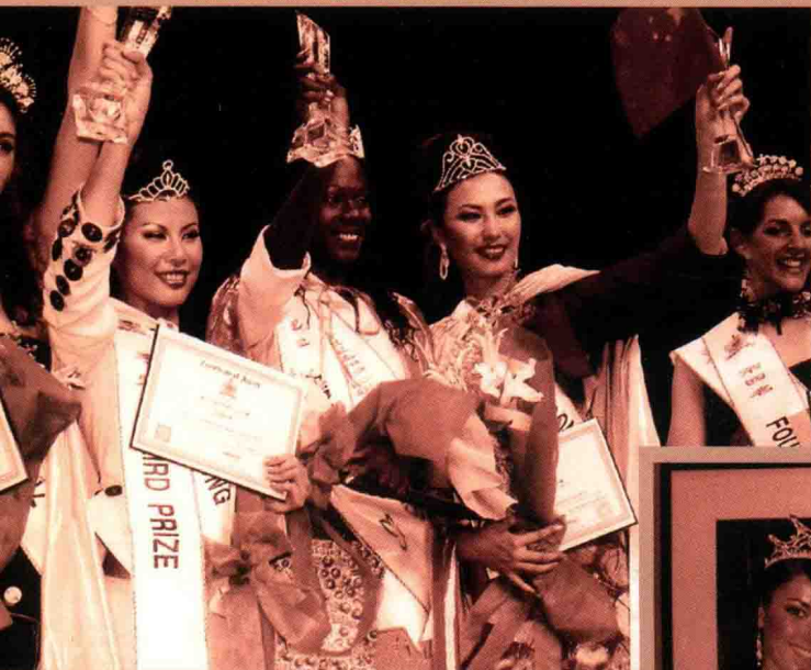
< 2003-2004 中国 杭州 HANGZHOU CHINA