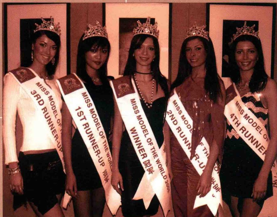
> 2004-2005 中国 深圳 SHENZHEN CHINA