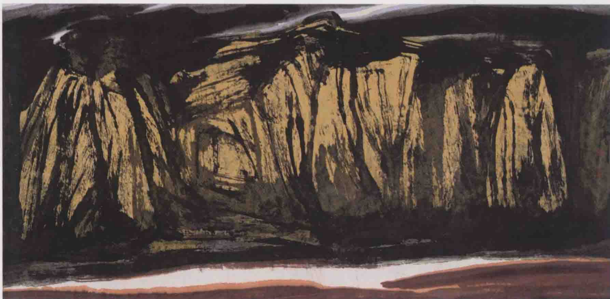
周韶华 / 巴山蜀水 / 纸本水墨