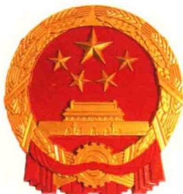
National Emblem of the People's Republic of China

National Anthem of the People's Republic of China