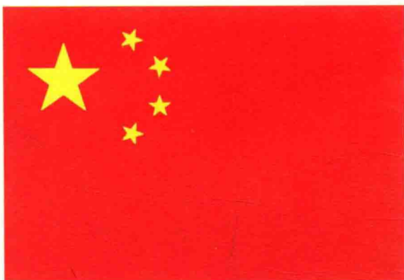
National Flag of the People's Republic of China