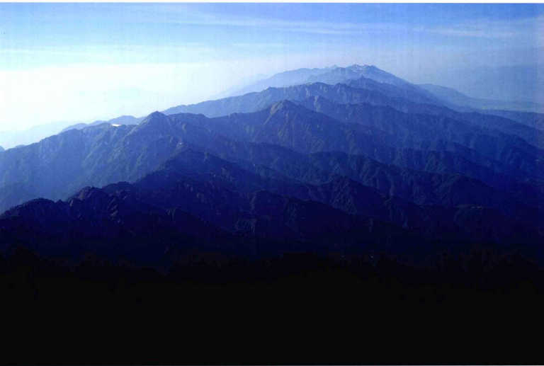
高黎贡山脊 Ridges of Gaoligong Mountains