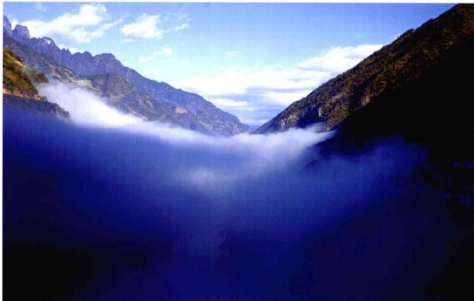
雾锁怒江 Fog over Nu River