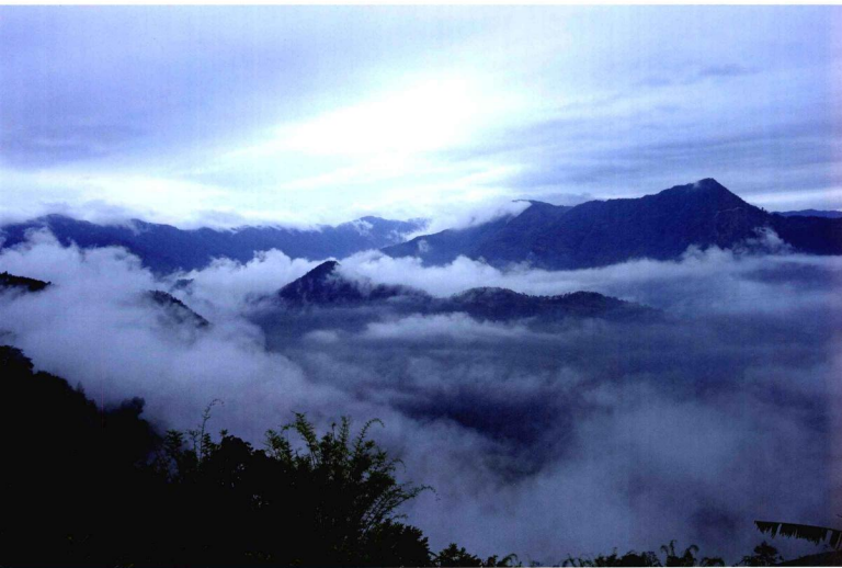
高黎貢山霧茫茫 Foggy mountains