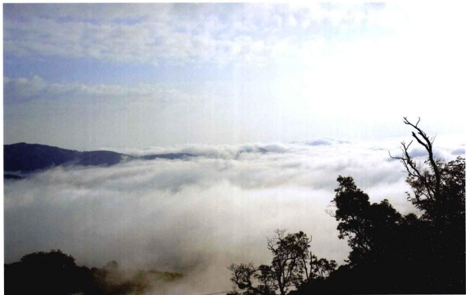
高黎贡云海 Cloud sea on Gaoligong