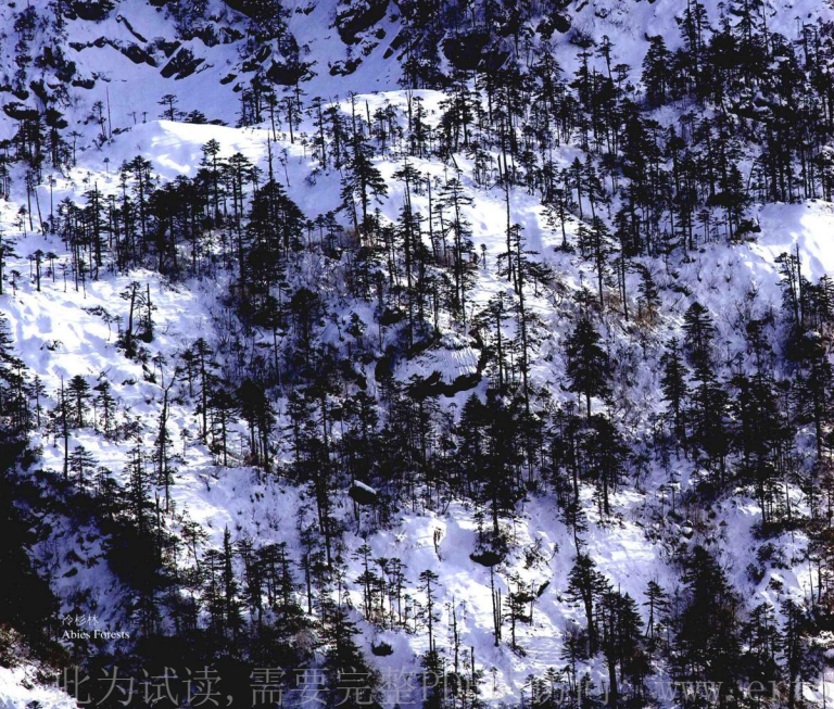
冷杉林 Abies Forests