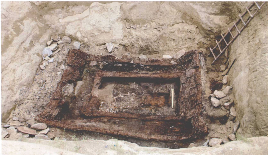
Plate IV-5 The intraburial construction of Barrow no. 7: wooden chambers inside large stone cist