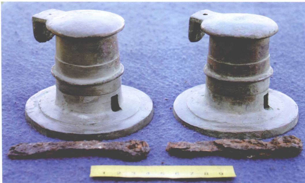
Plate IV-3 Bronze axle caps and iron pins