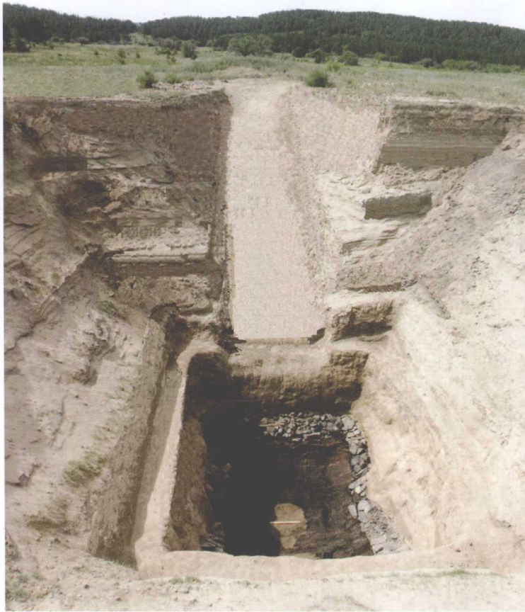
Plate IV-4 A general view of Barrow no. 7