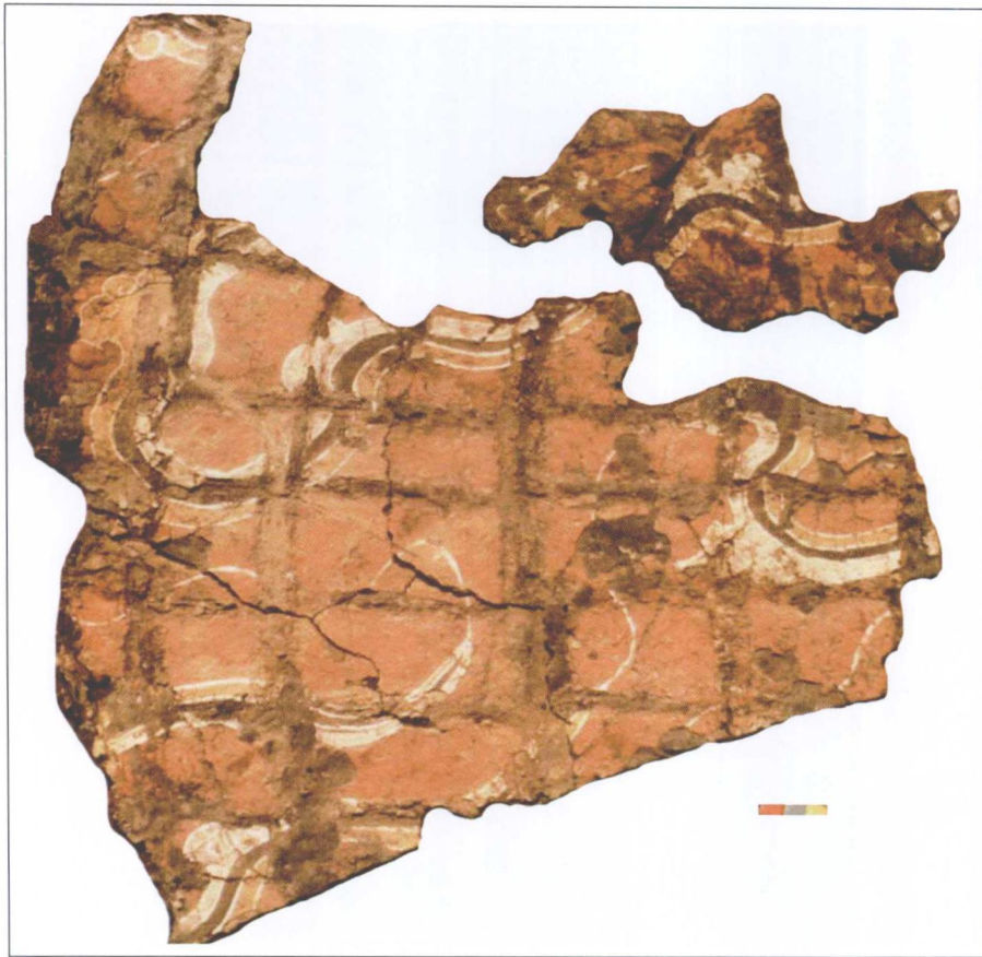
Plate IV-2 Decoration on the inner side of the chariot's canopy