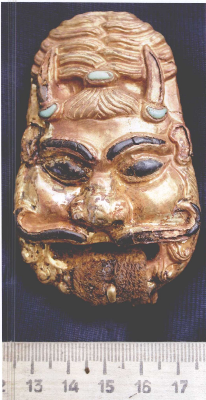
Plate IV-13 Gold buckle shaped as a satyr's head