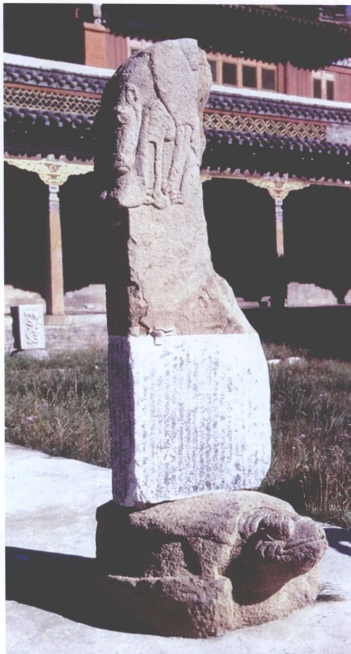
Plate V-1 Bugut stele with Sogdian inscriptions (on front and both sides) on stone tortoise