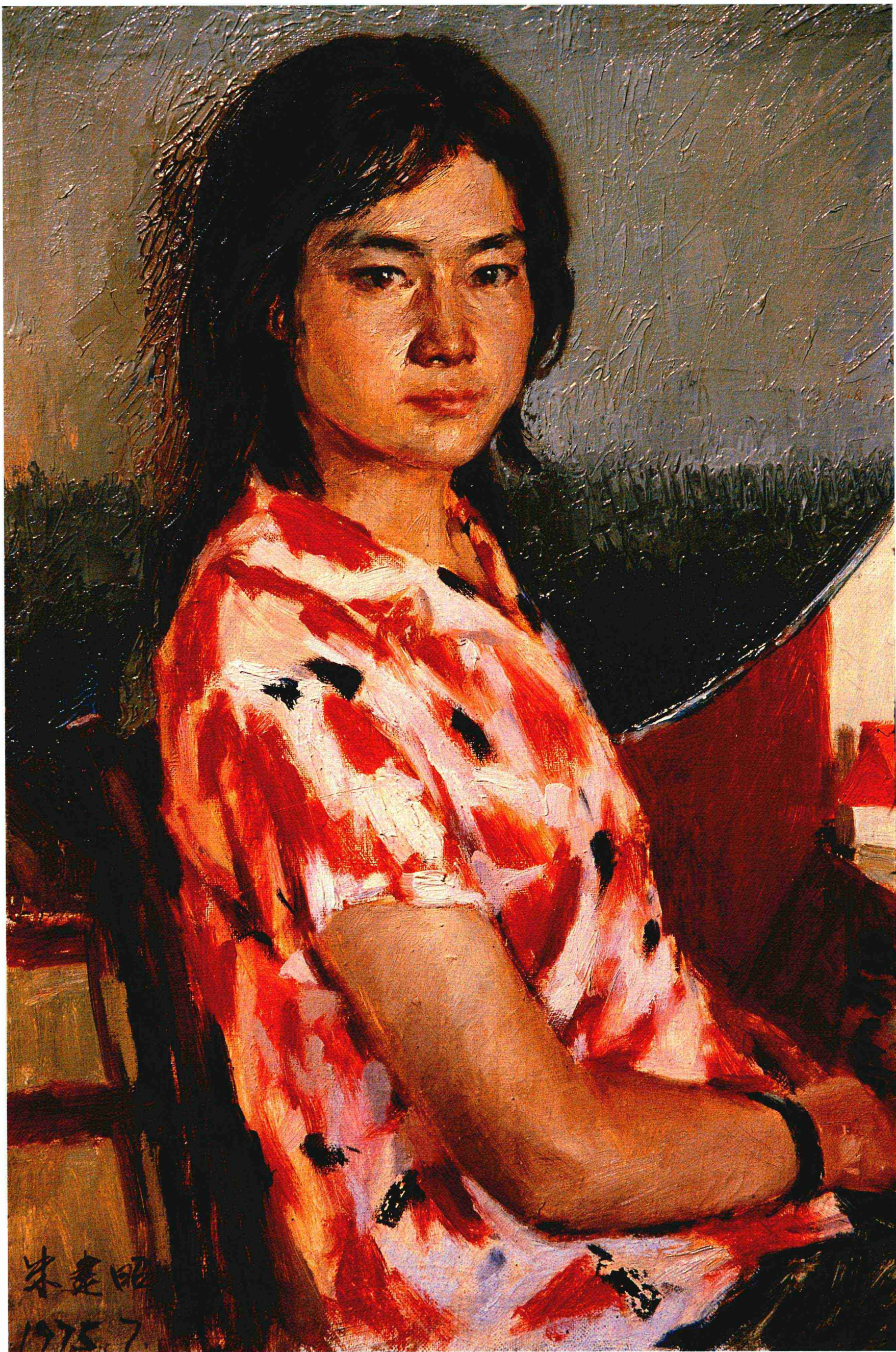
镜前女子 45.9×33.5cm 1975年 Girl before Mirror