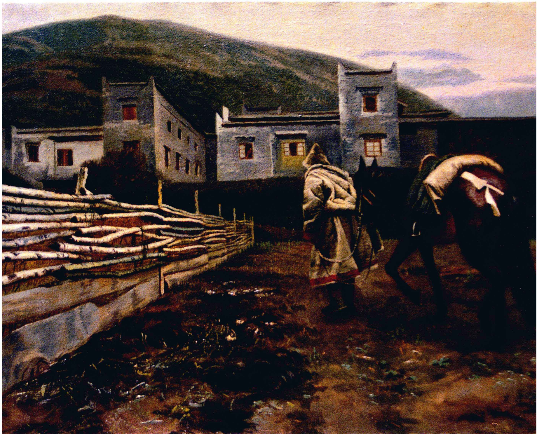
回寨 53×73cm 1987 年 Back to Village