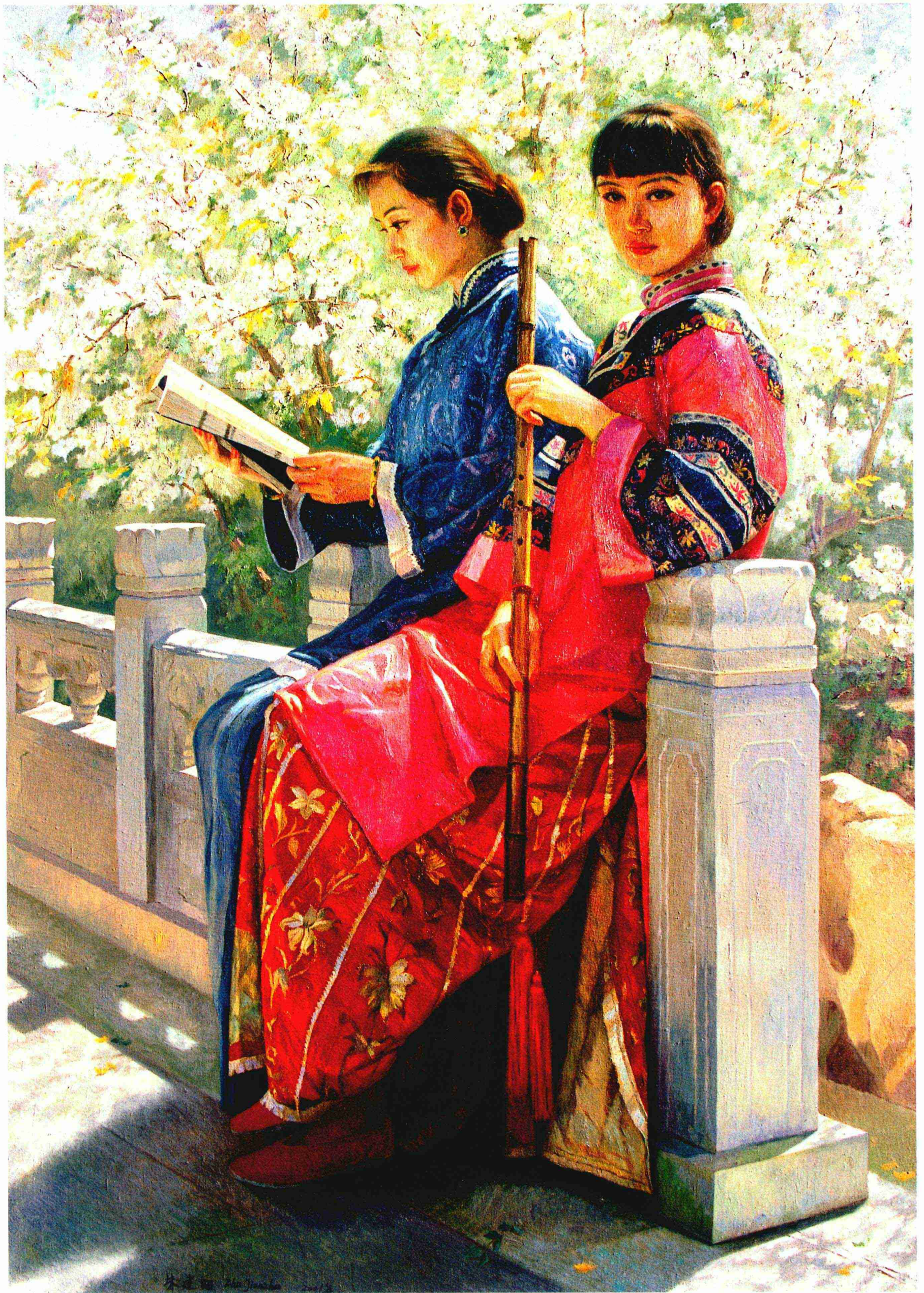
铜雀春深 150×104cm 2001 年 Classical Beauties