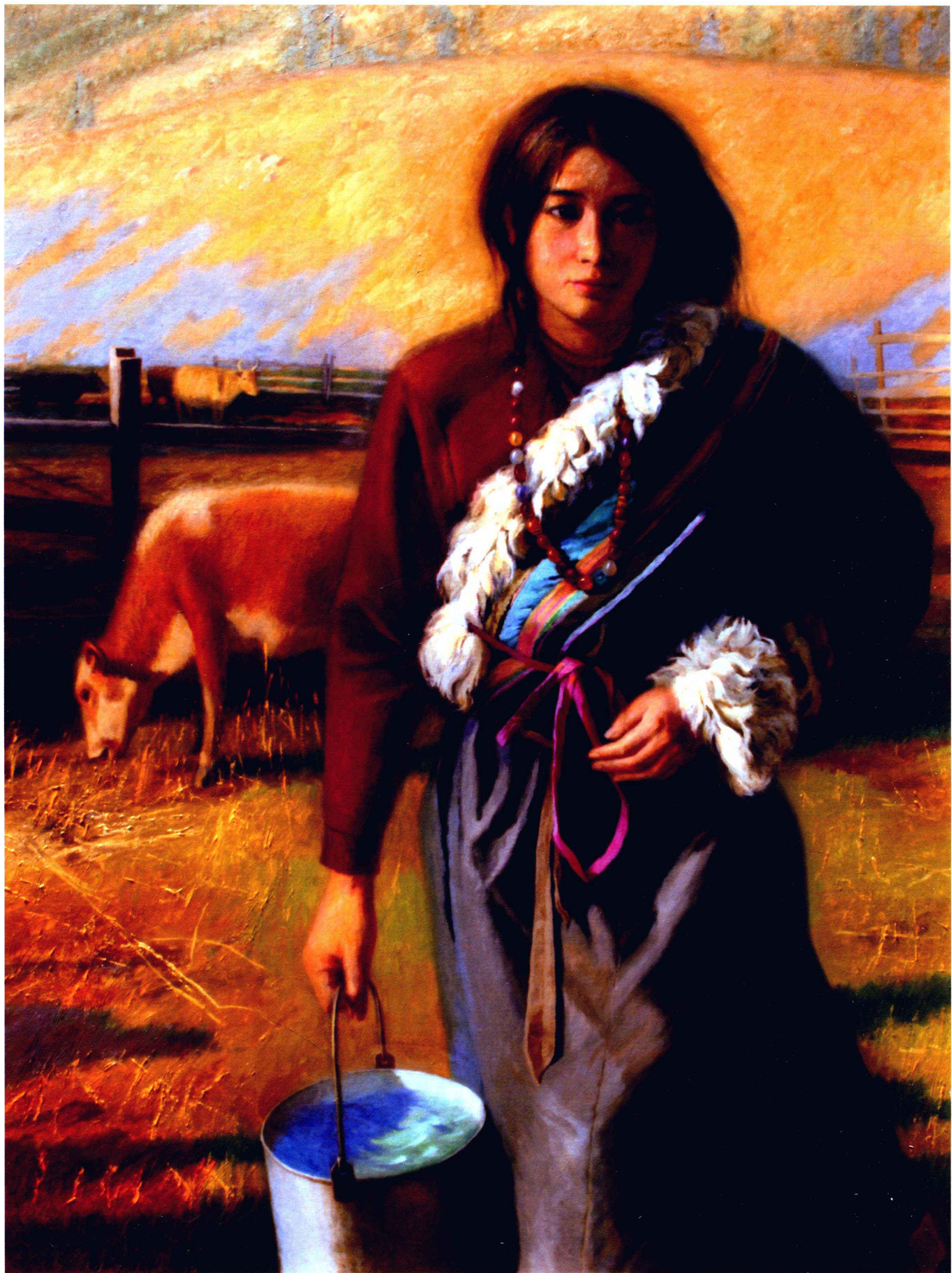
牧场 130×97cm 2009 年 Meadow