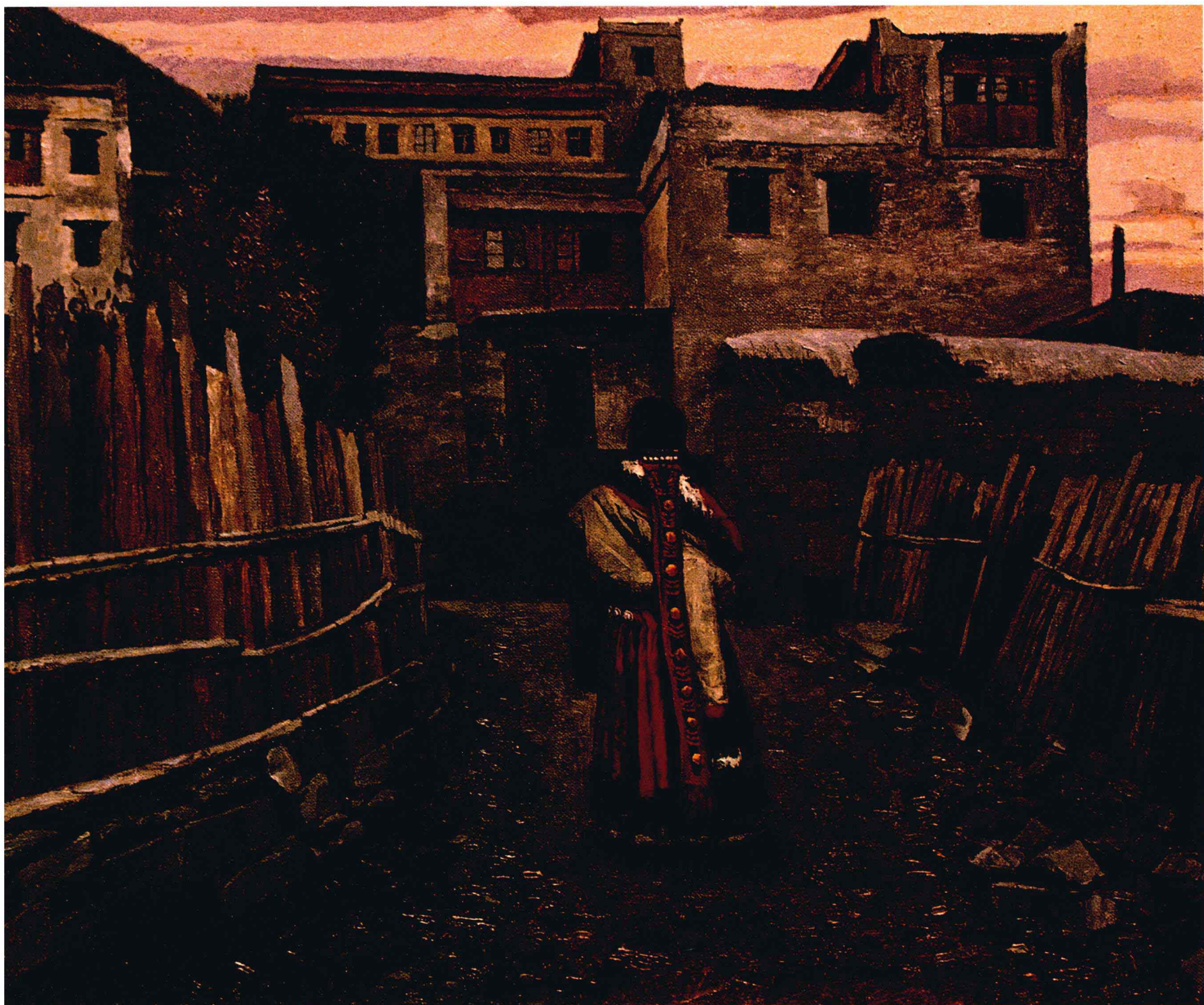
暮归 58.5×70.5cm 1988 年 Backing Home in the Dusk