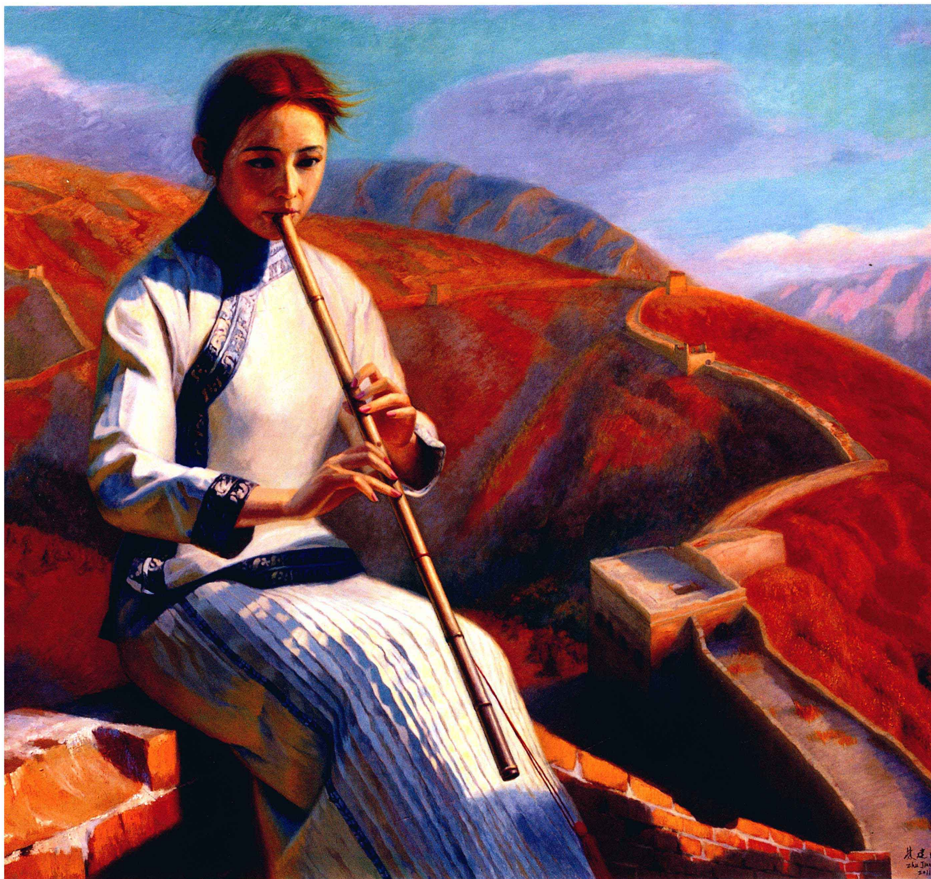
梦回秦关 150×180cm 2011 年 Dream of The Great Wall