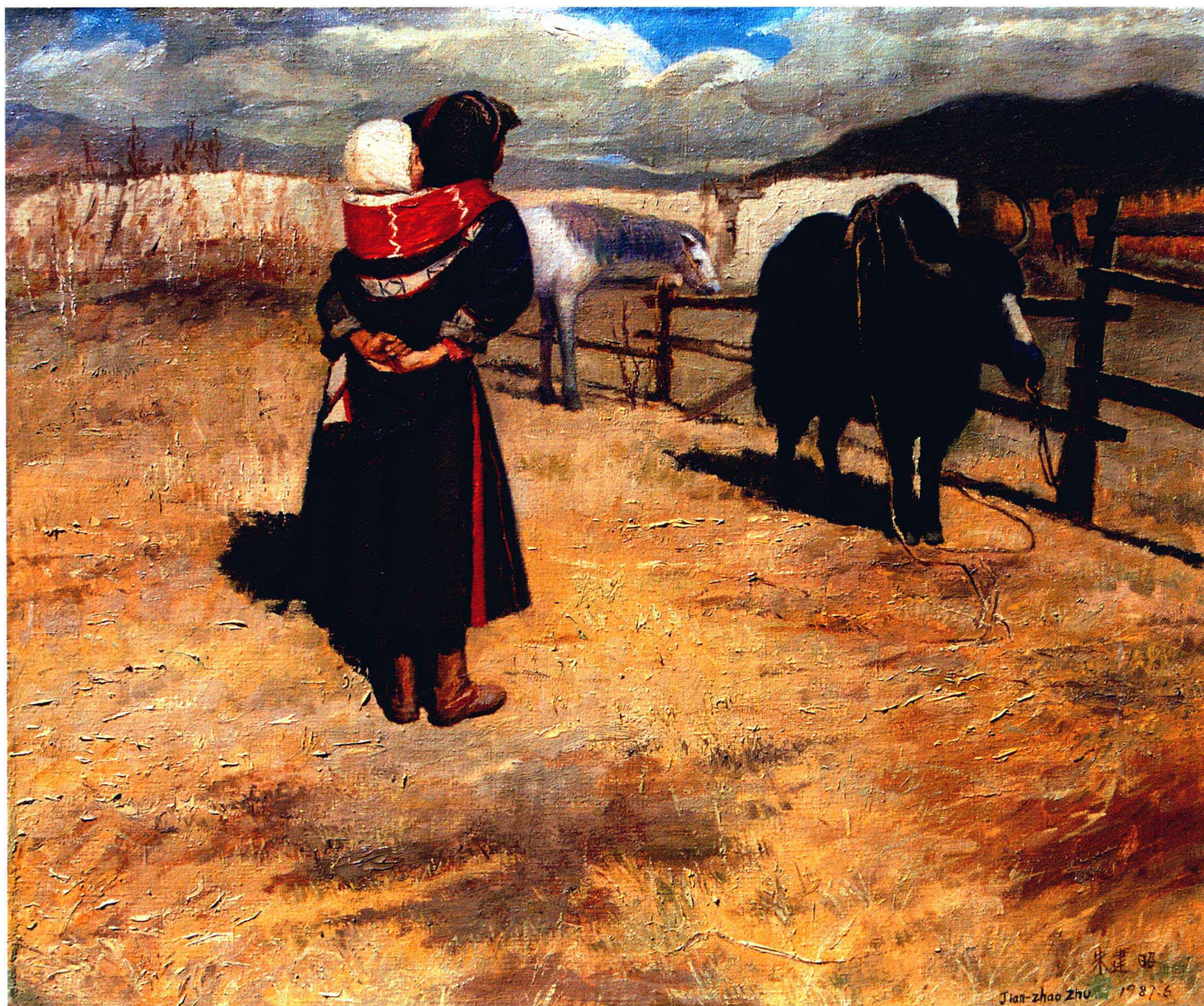
眺望 58.9×70.9cm 1987 年 Look Far into the Distance