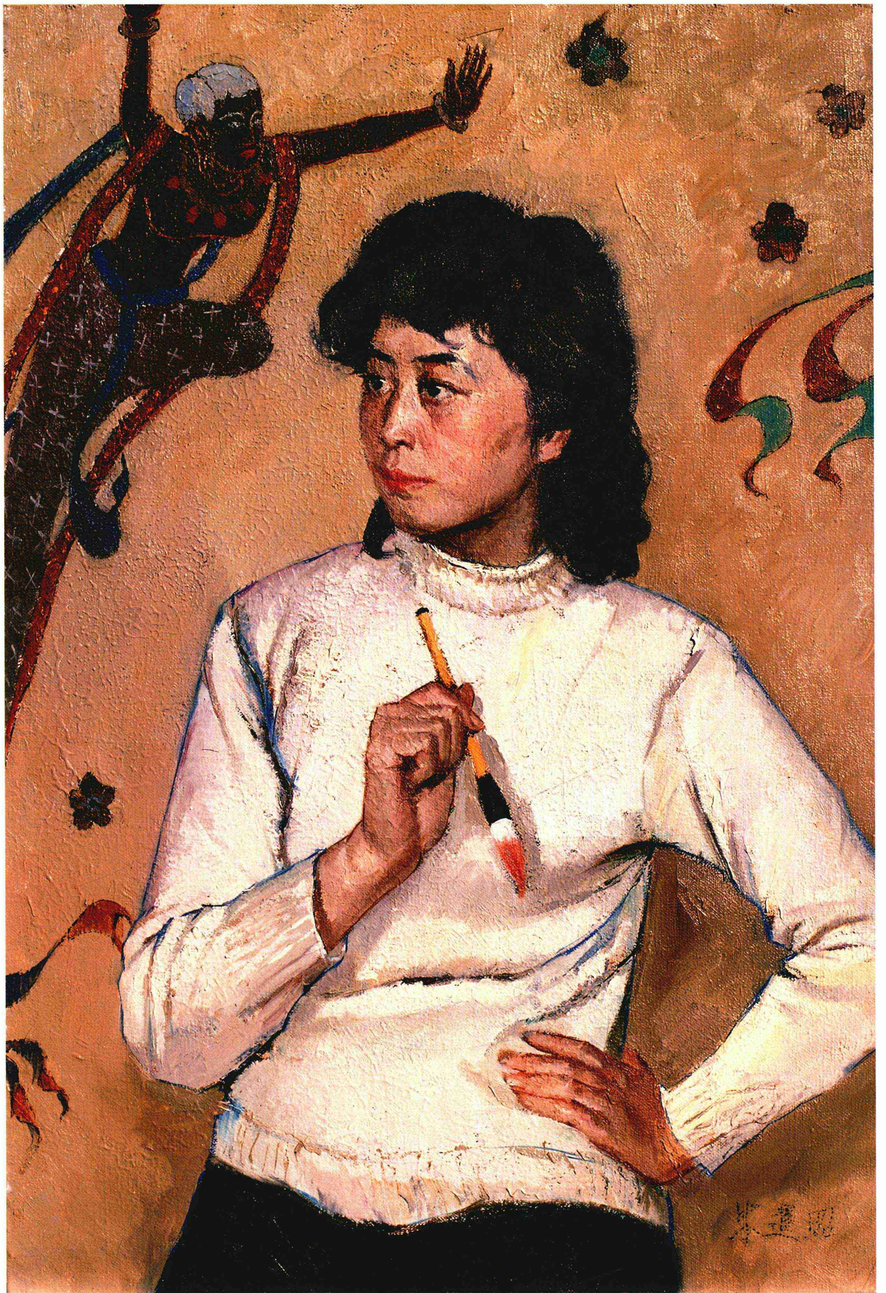
凝思 90.5×60.3cm 1977年 Contemplation