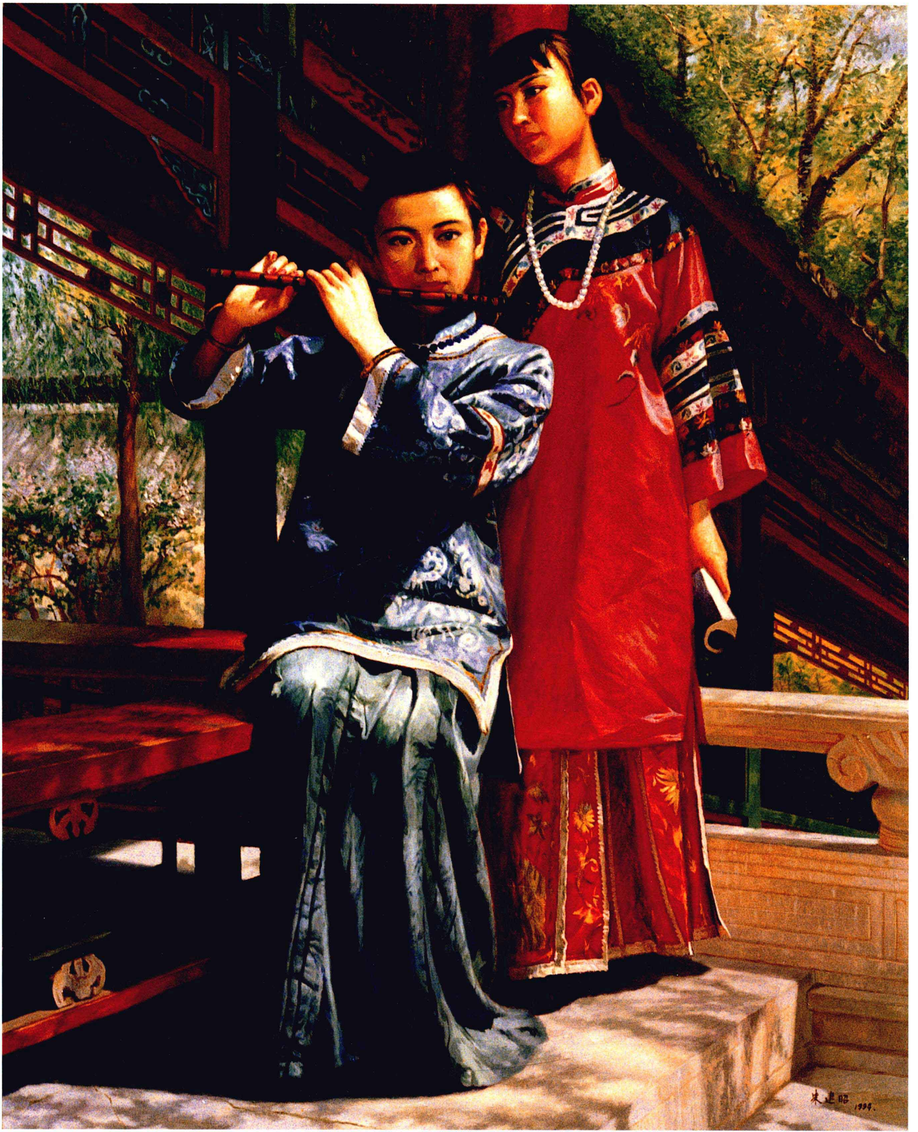
春风依旧 1994 年 Spring Breeze