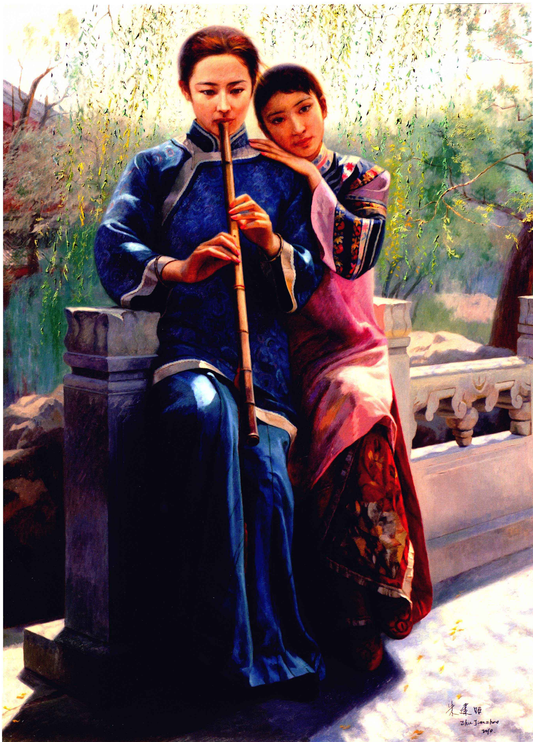
东风吹柳日初长 165×120cm 2010 年 Classical Beauties in Garden