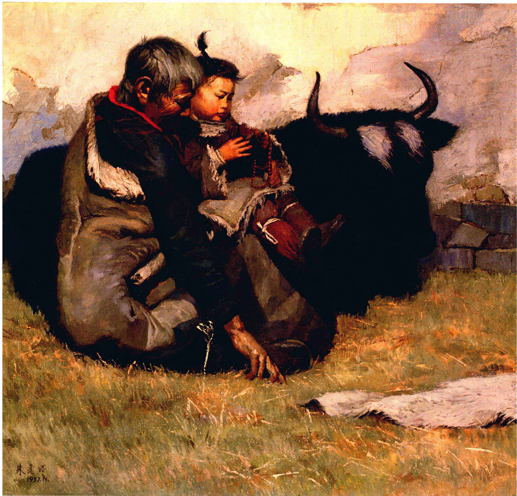
晒太阳 74.9×76.9cm 1987 年 Basking in the Sunshine