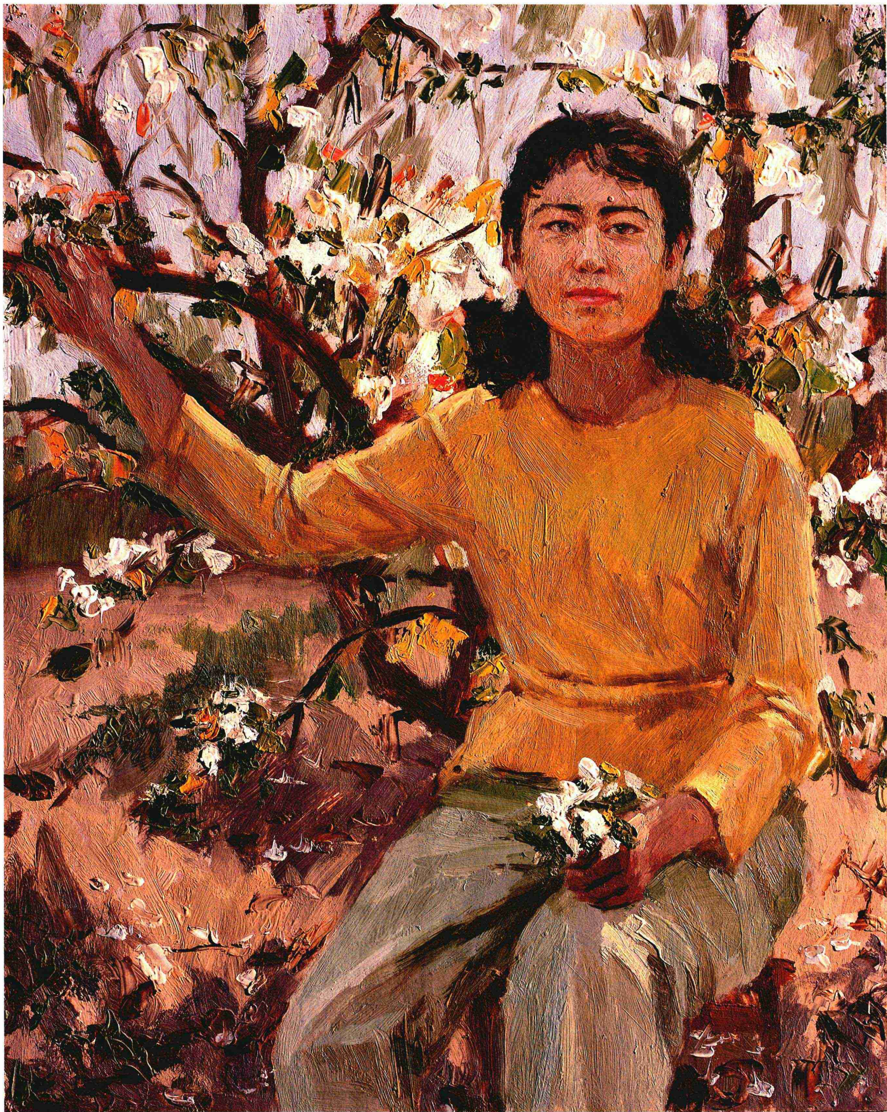
梨树下 48.3×39cm 1978 年 Woman under Pear Tree