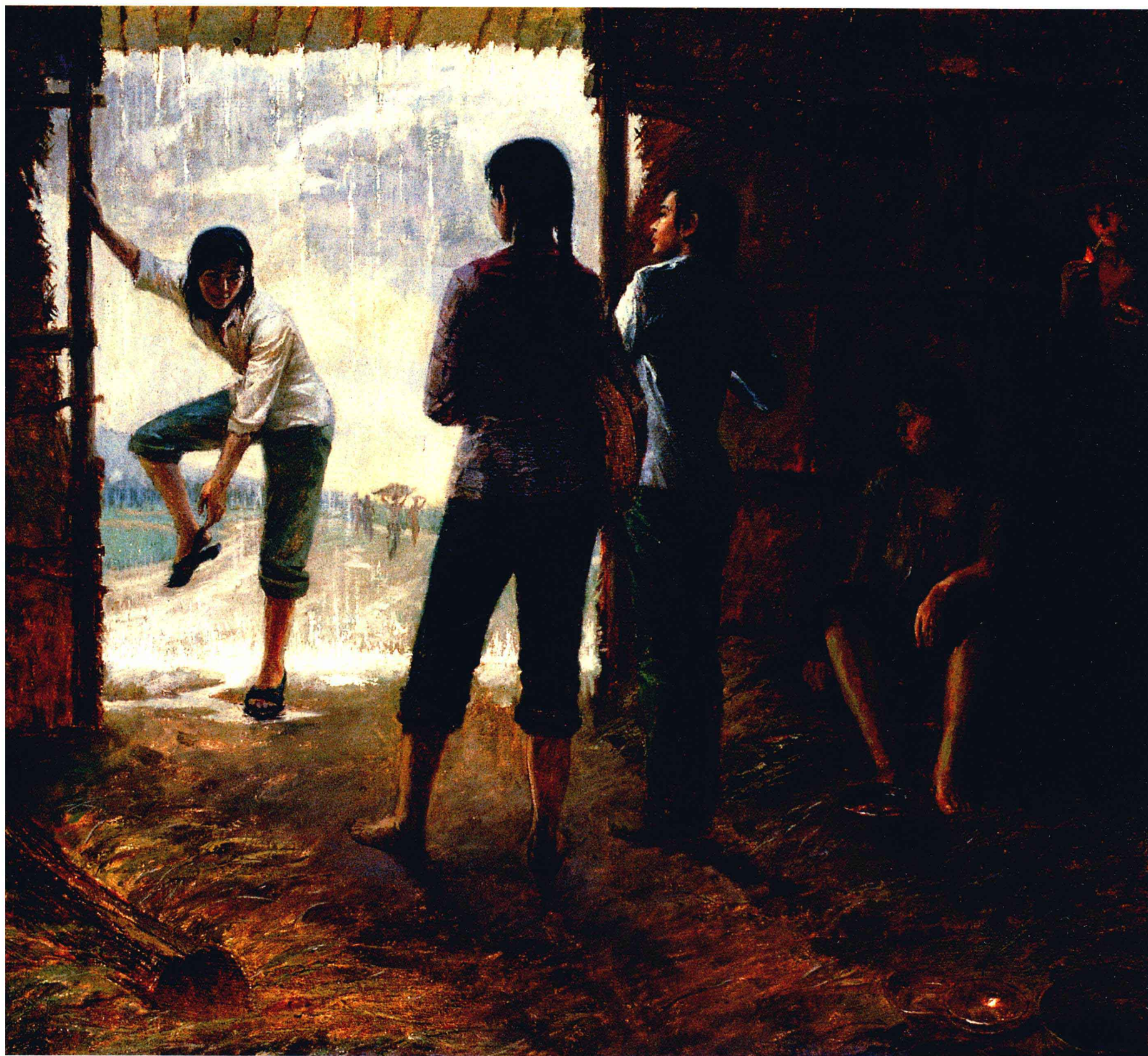
雨 73.6×88cm 1986 年 Rain