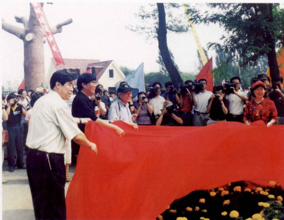
组委会领导为雕塑公园揭幕 Leaders unveil the Park