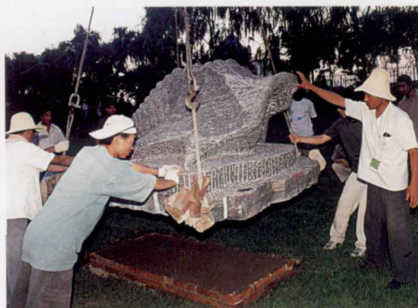
作品《公园中的壳》在安装中 Installation in the Park "Shell in the Garden"