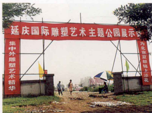
创作现场大门 The Gate of Work Site