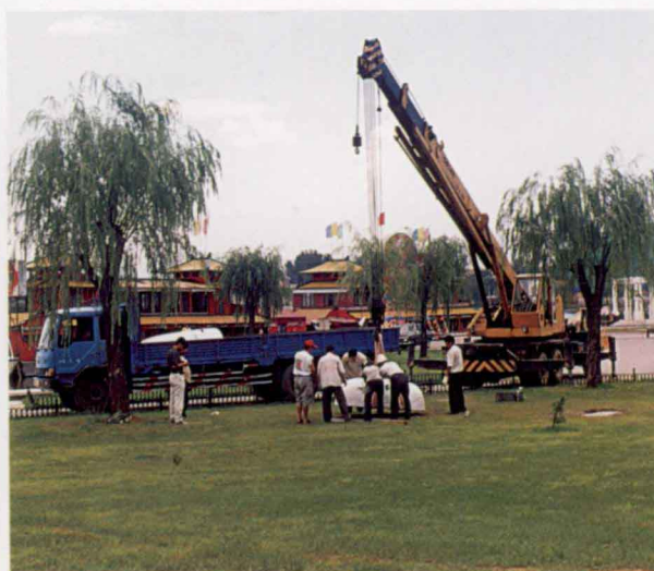
作品《经脉》在安装中 Installation in the Park "Anastomatic Line"