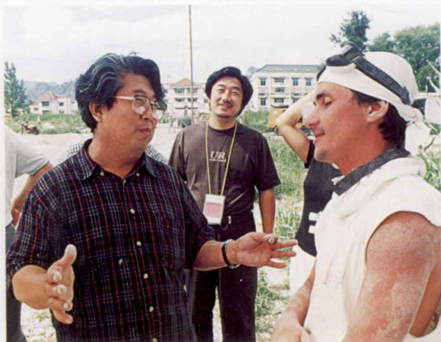
中、俄艺术家亲切交谈 Chat between Chinese and Russian Artists