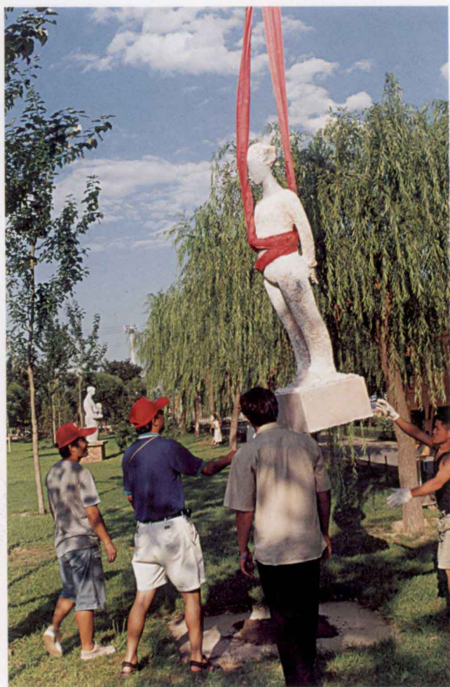
作品《夏》在安装中 Installation in the Park "Summer"