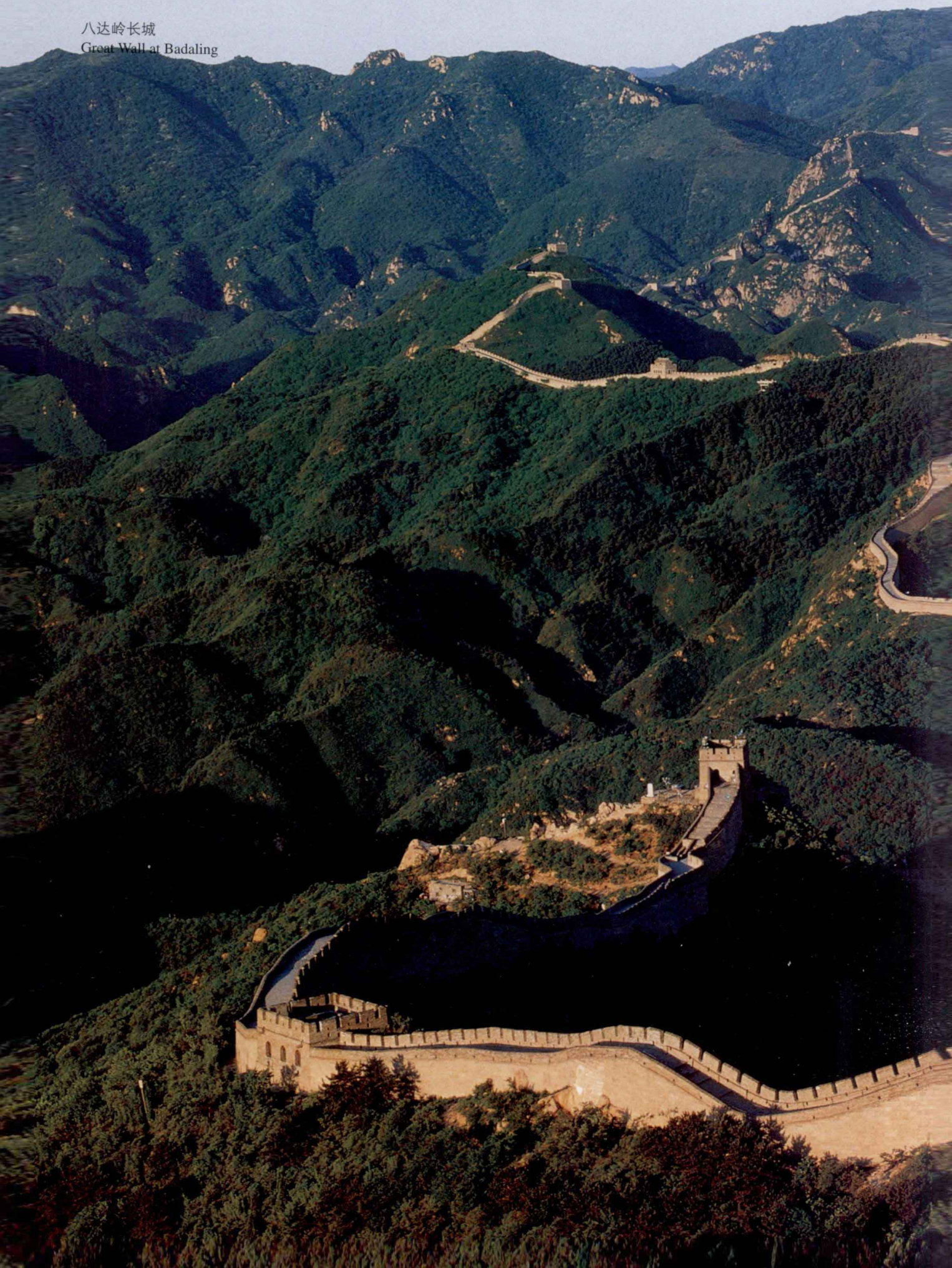
八达岭长城 Great Wall at Badaling