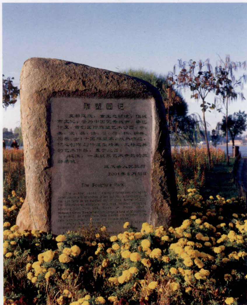
夏都雕塑公园碑记 Epigraph of Xiadu Park