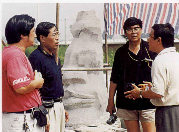
组委会办公室领导和艺术总监在创作现场 Leaders of Organizing Committee on the Work Site