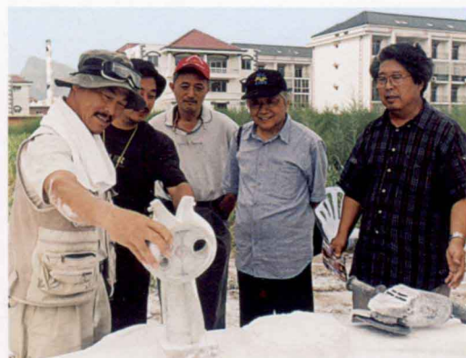
中、韩艺术家在创作现场 Chinese and Korean Artists on the Work Site