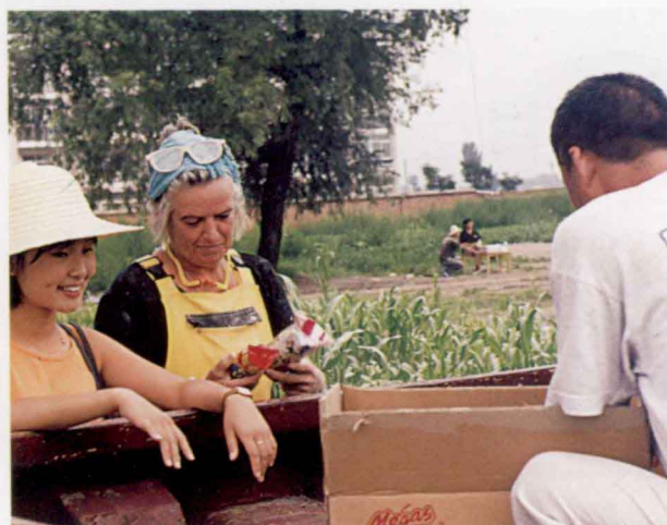
中外艺术家和翻译在创作现场 Foreign Artist and Translator