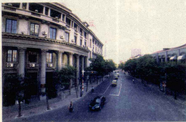
解放路街景 The street scene of Jiefang road