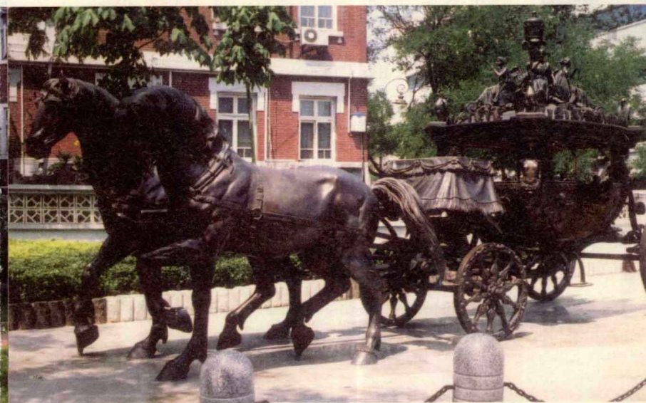
重庆道铜马车 The copper wagon at Chongqing Dao

说起小洋楼，上海、青岛、厦门、武汉都有很多，但比较起来，天津的小洋楼却是现存最多，保存最好，而且是最为集中，也最为出名。其中，有一个重要原因，就是居住在小洋楼里的人不同寻常。据不完全统计，仅五大道地区，上个世纪二、三十年代就曾居住过两任民国总统——徐世昌和曹锟，七任国务总理或代理国务总理——潘复、唐绍仪、顾维钧、张绍曾、颜惠庆、龚心湛和朱启钤；此外还有数十位各省督军、省市长等近代名人。著名教育家严修、张伯苓，著名医学家朱宪彝、方先之，著名实业家周学熙、李烛尘、宋裴卿，著名收藏家周叔弢、张叔诚、徐世章，著名爱国将领高树勋、鹿钟麟，美国第31届总统胡佛青年时代，英国400米跑奥运冠军李爱锐等均曾在此居住。这里简直是中国近代历史的一个缩影，是百年社会历史变迁的一个写照。