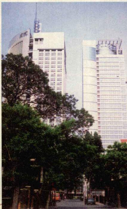
睦南道街景 The street scene of Munan Dao

Early from 19 centuries, here ever was English concession, there were western garden type houses more than 2000s designed by the architects came from the world, constructed in 1920-1930, covering an area about 600000 square meters, the total building area amount to 1,000,000 square meters.