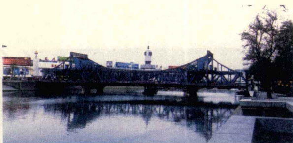
解放桥全景 The panorama of Jiefang bridge

如果您是乘火车来到天津，或乘轮船抵达塘沽，那您可以首先到天津火车站，再由解放桥跨越海河，顺着法式建筑最集中的解放路金融街，也可以到达五大道地区。