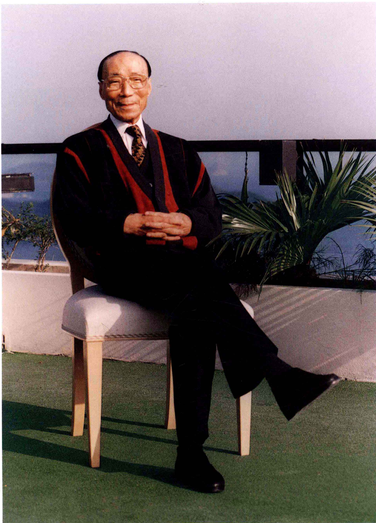
邵逸夫先生 Mr. Run Run Shaw