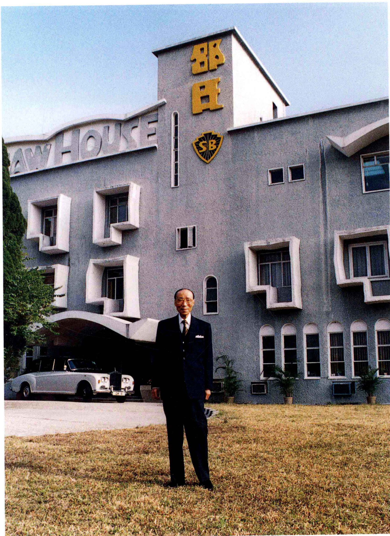
邵逸夫先生 Mr. Run Run Shaw