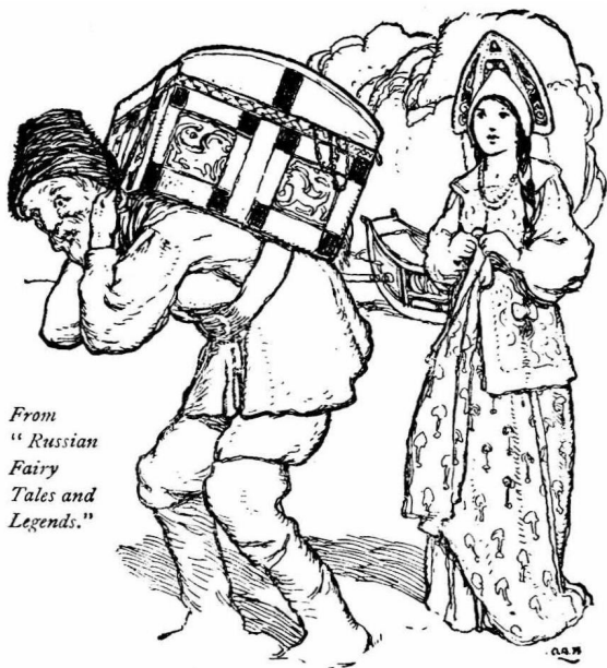
From "Russian Fairy Tales and Legends."