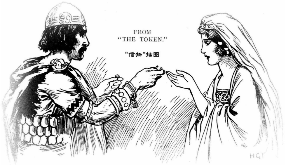
FROM "THE TOKEN."

But something happened to this world of ours: there was a big upheaval of the crust of the earth, and Great Britain and Ireland suddenly became islands with silver seas surrounding them. Then we come down to the time when the wild boar, the wolves, and huge deer roamed the dense forests of these countries—when the people hunted and fought with one another, a hardy race and barbarous, but a race that was also