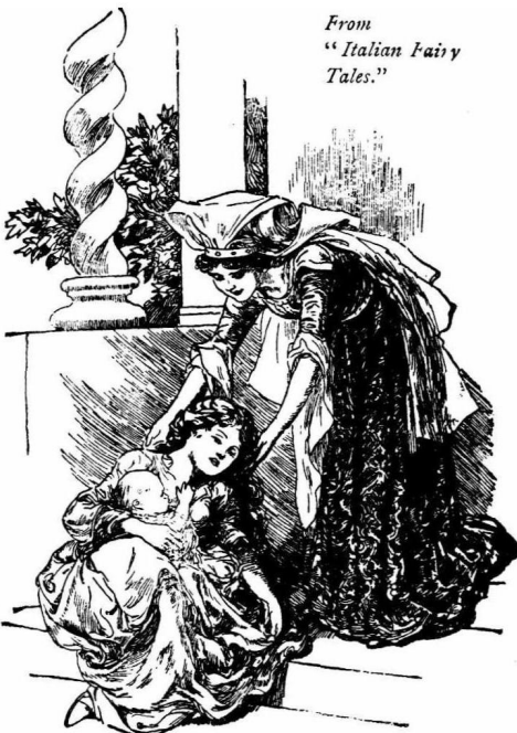
From "Italian Fairy Tales."

Their charm enhanced by the numerous characteristic illustrations, these stories, with their vivid local colouring, gathered from the fairy tales and folk-lore of lovely Italy, translated and retold, form a truly magnificent volume. Printed on rough art paper. 12 full-page colour plates. 144 pp. letterpress, crown 4to.