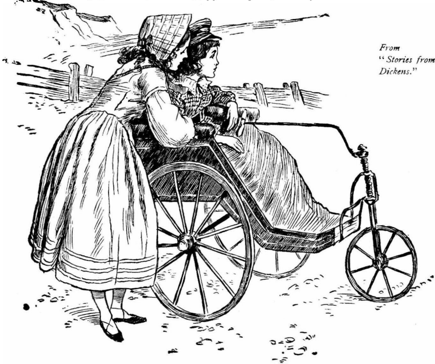
From "Stories from Dickens."

The histories of Sir Walter Scott's most popular characters condensed into short stories, and thus adapted as an interesting introduction to the Scott classics so worthily considered a part of the education of every up-to-date boy and girl. These tales are admirably illustrated with numerous drawings in colour and black and white. Printed on rough art paper. 12 full-page colour plates. 144 pp. letterpress, crown 4to.