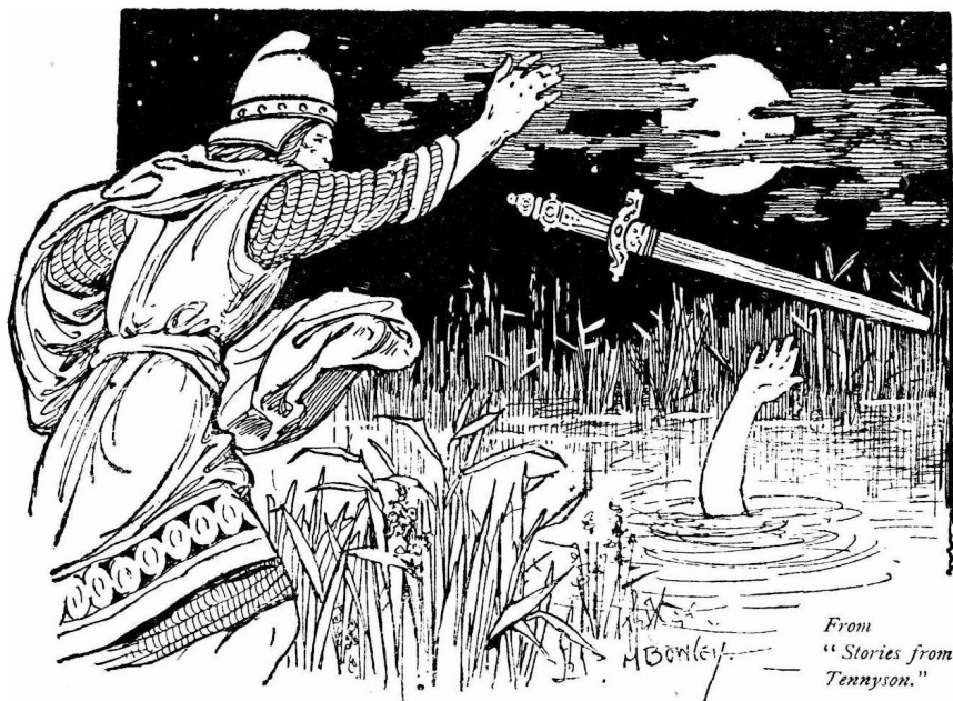
From "Stories from Tennyson."