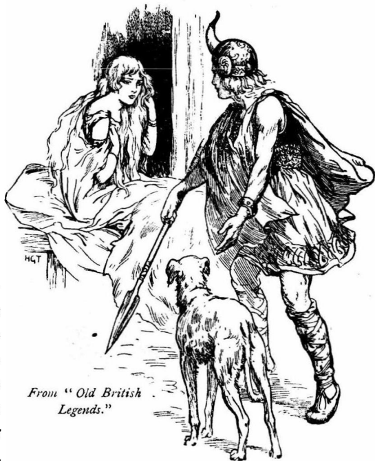
From "Old British Legends."

These ancient legends of England, Scotland, Wales, and Ireland, delightfully narrated and brilliantly illustrated, constitute a volume which may well claim to be amongst the most beautiful books of this beautiful series. Printed on rough art paper. 10 full-page colour plates. 144 pp. letterpress, crown 4to.