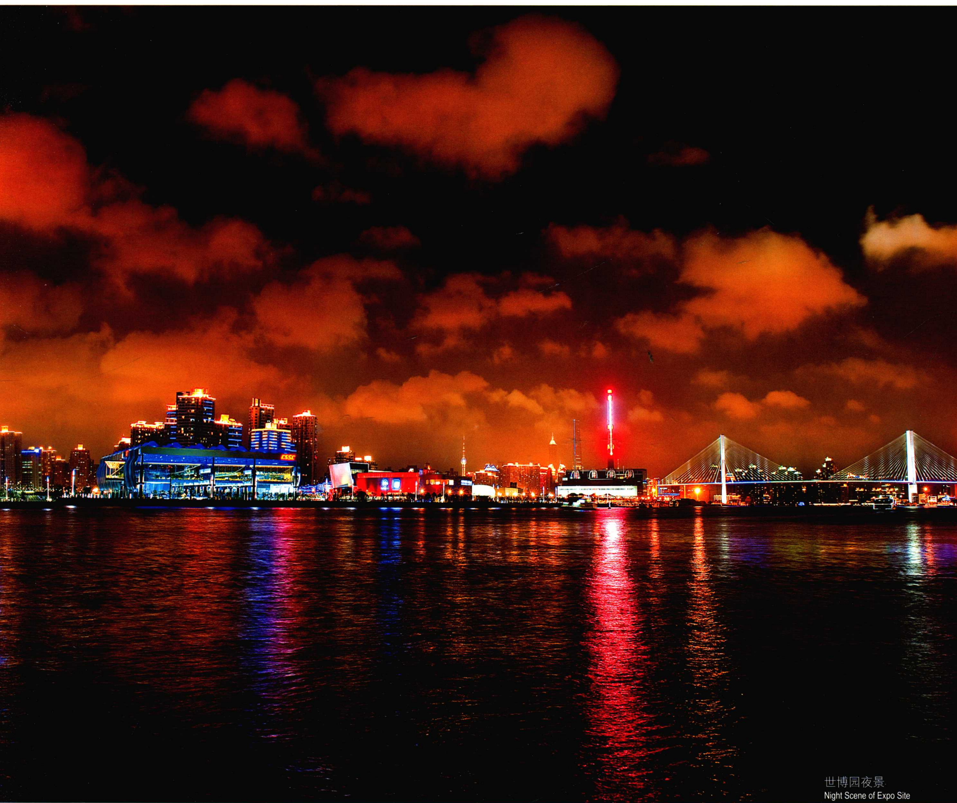
世博园夜景 Night Scene of Expo Site