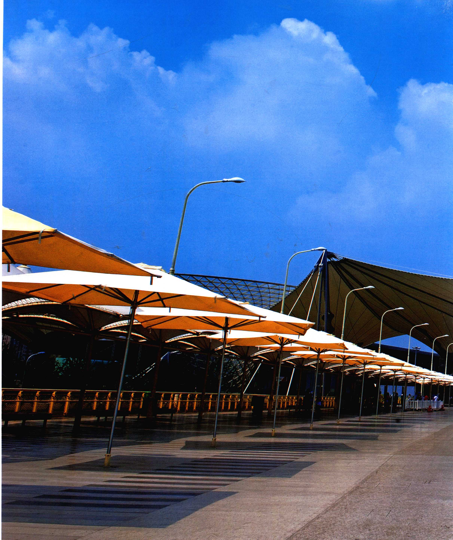
高架步道 Elevated Pedestrians' Walk