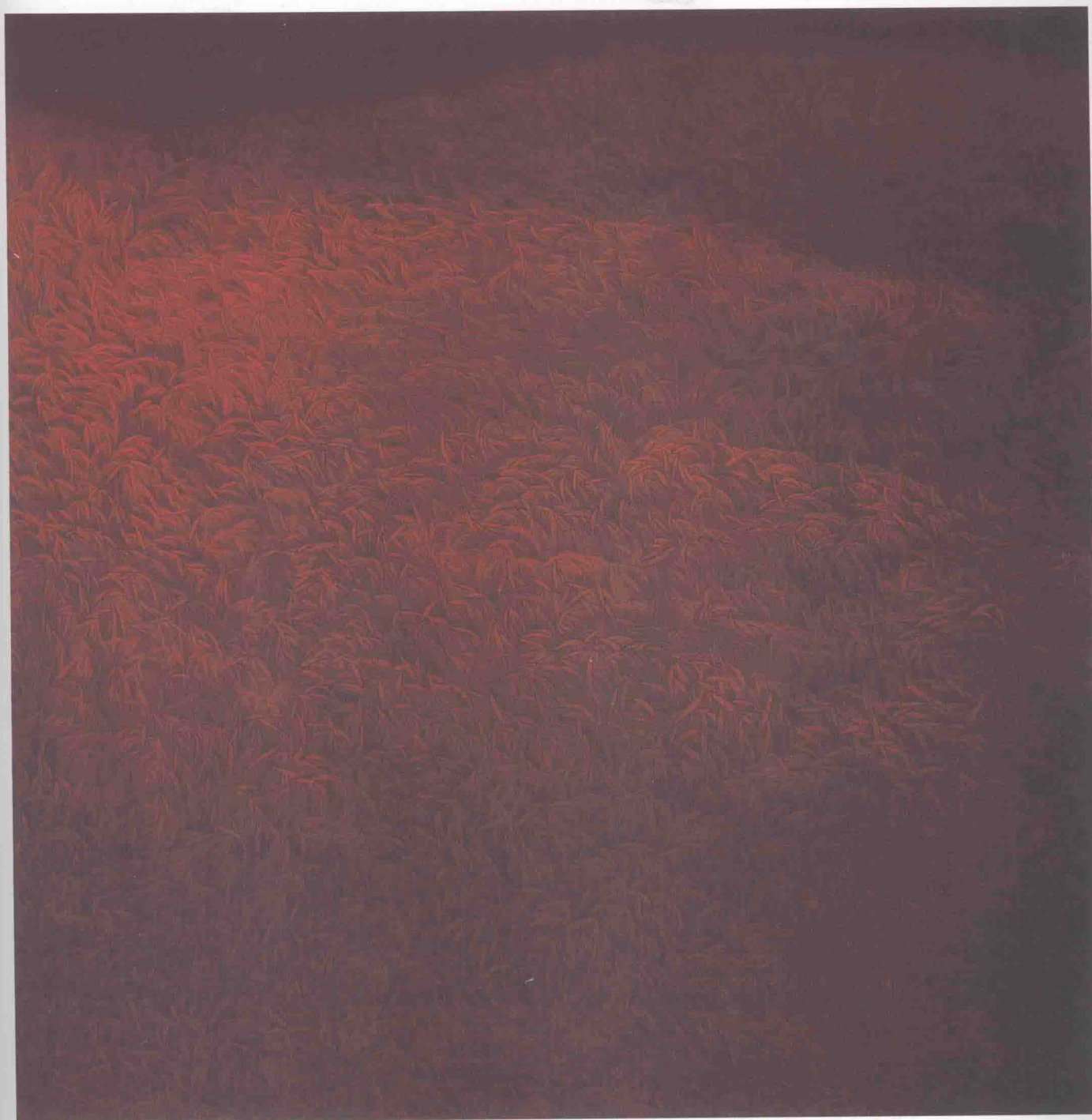
原野之梦（局部） Dream on the Wilderness(detail)