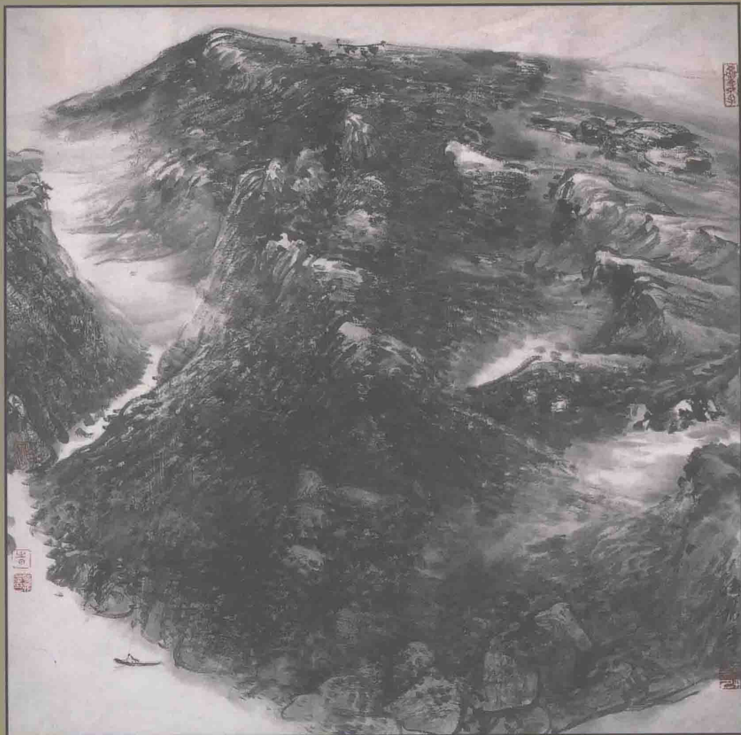
苍山依旧 68 x 68cm 1993