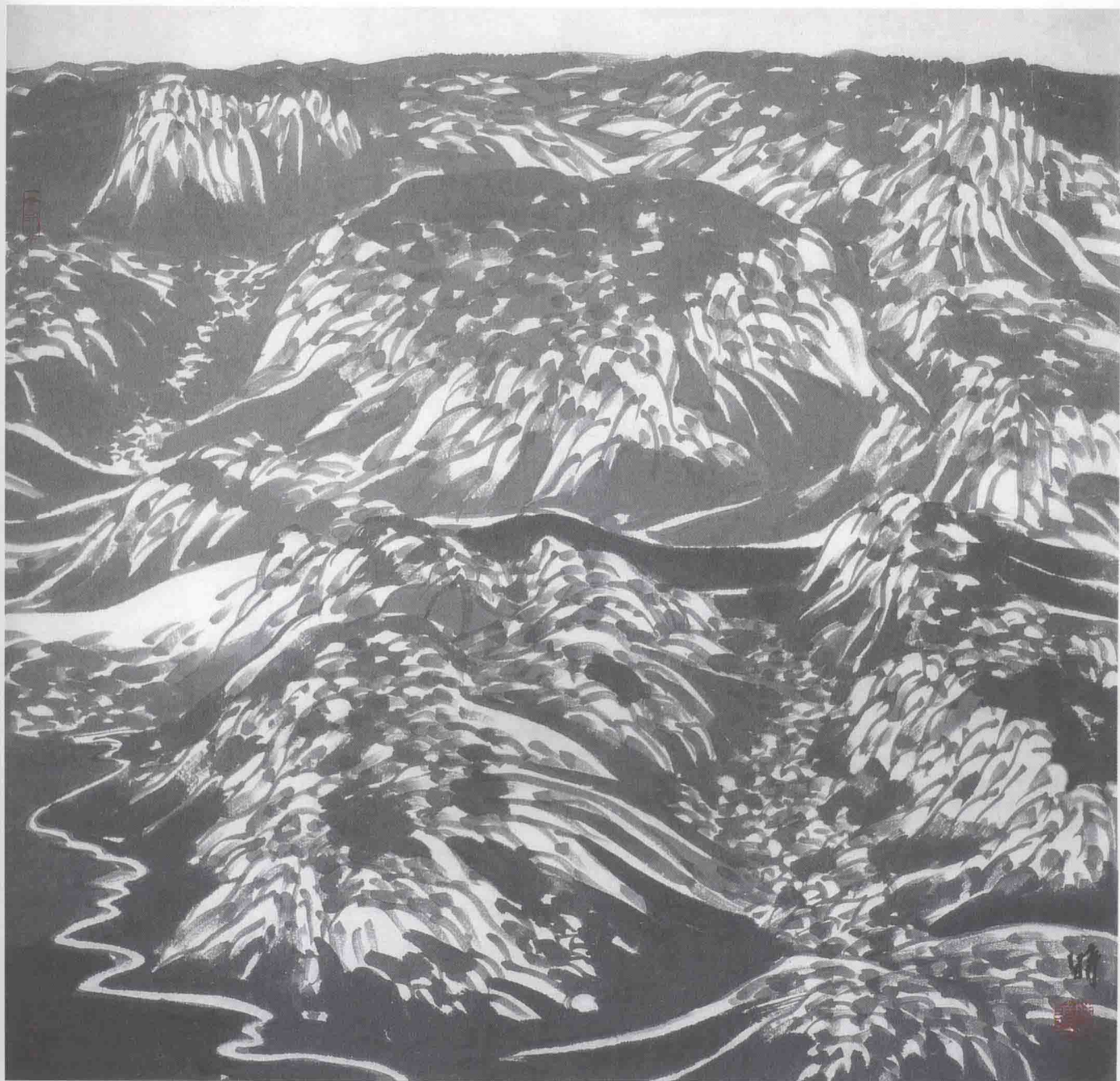
莲山之韵 Charm of Mount Lian 1997年 68 × 68cm