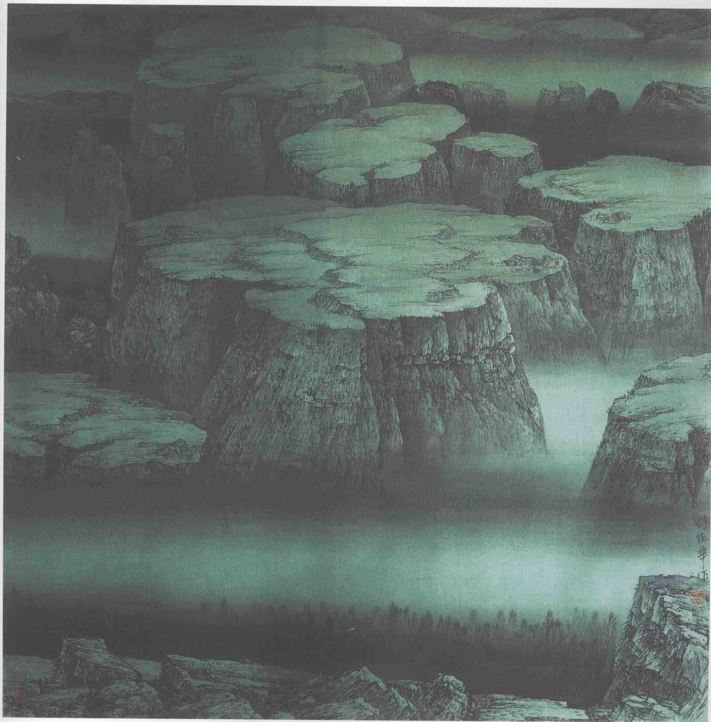
索梦太行 Mount Taihang Occupying My Mind 1995年 120 × 120cm