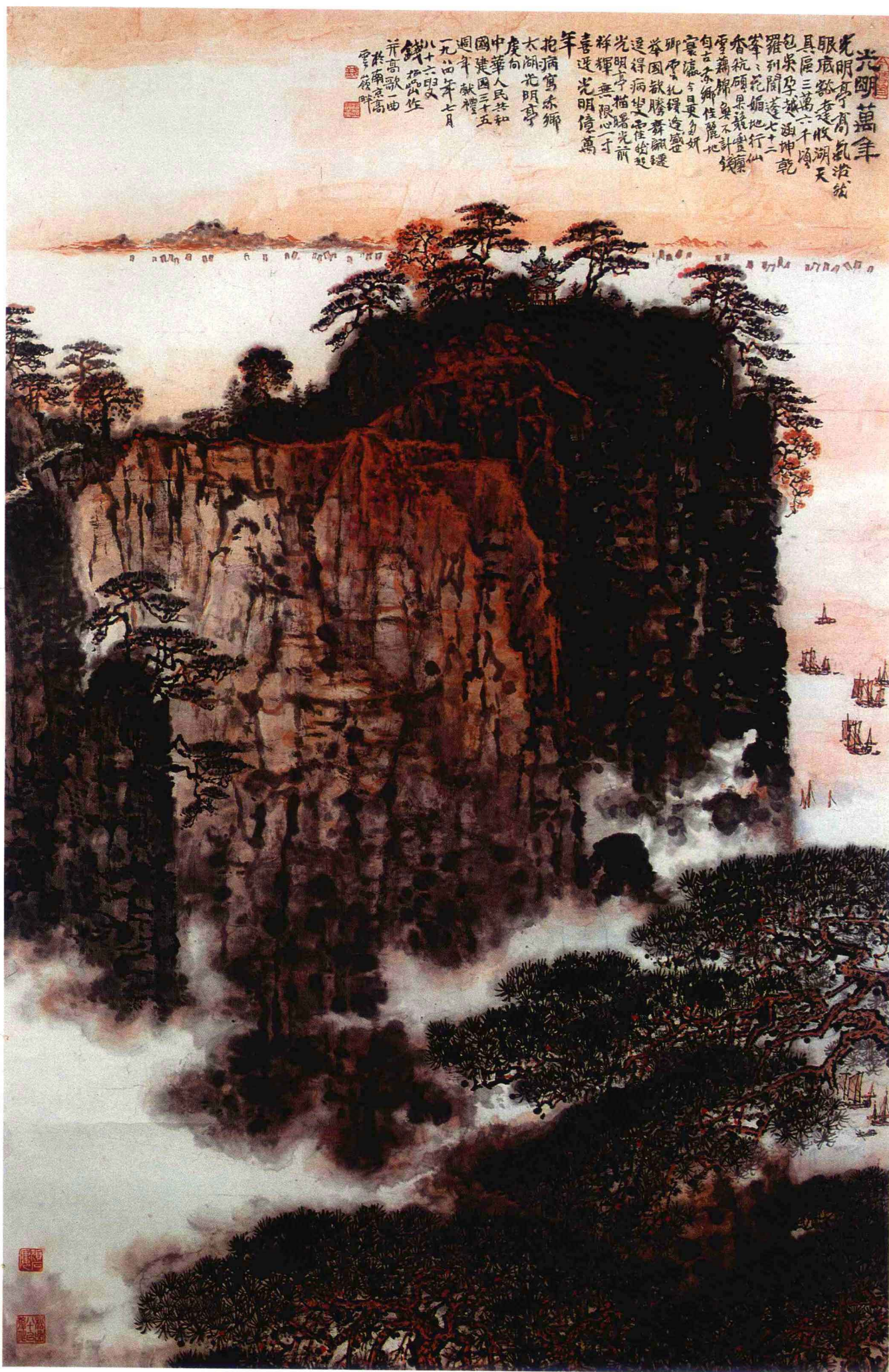
光明萬年(中國畫) 96×147 錢松喦 Bright Future (traditional Chinese painting) by Qian Songyan