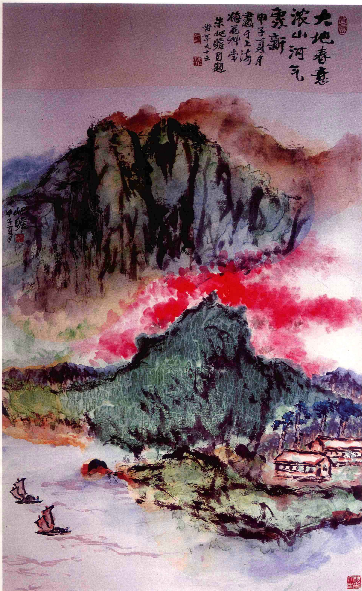
大地春意濃(中國畫) 78×107 朱紀瞻

Landscape in Spring (traditional Chinese painting) by Zhu Jizhan