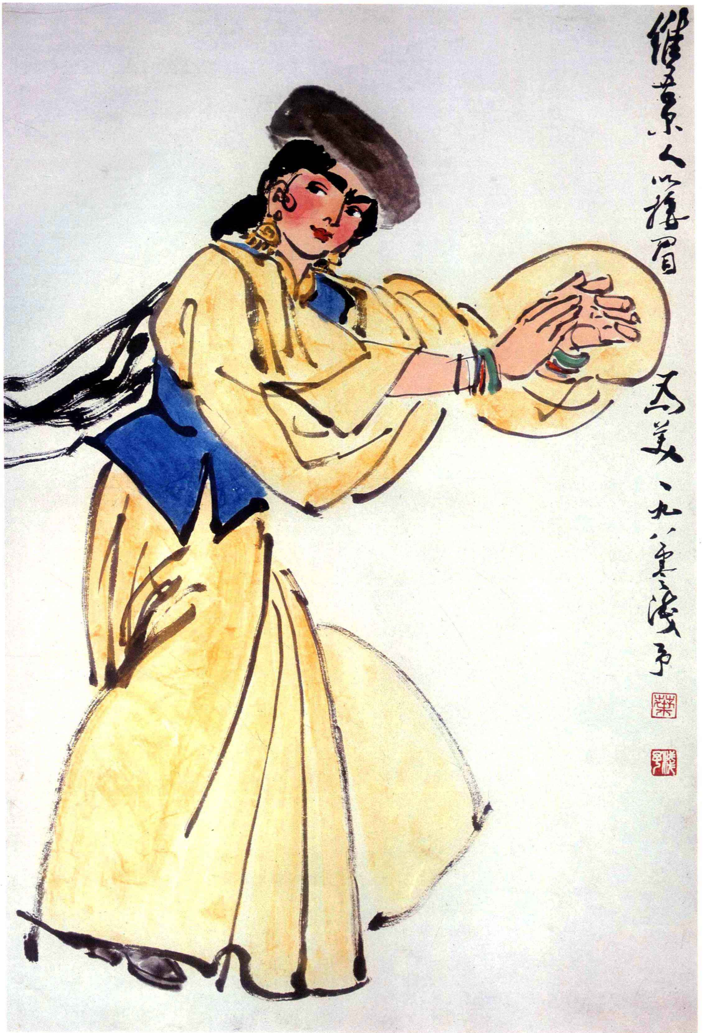
維吾爾人(中國畫) 69×103 Uygur Dancer (traditional Chinese painting)