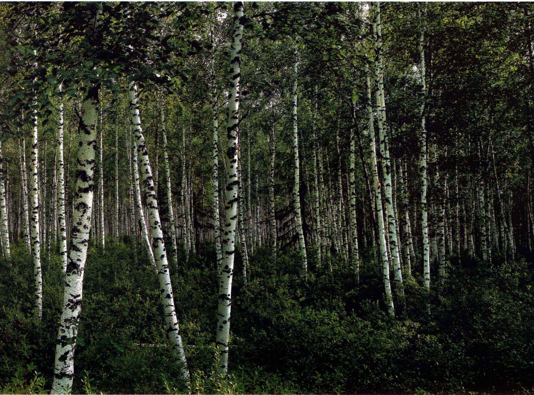
Birches in spring