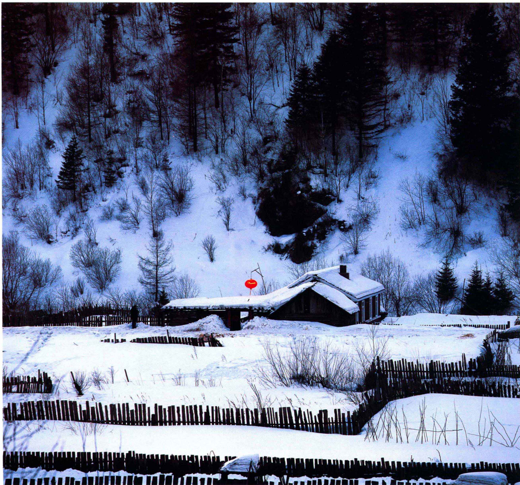
A village of Heilongjiang Province in winter