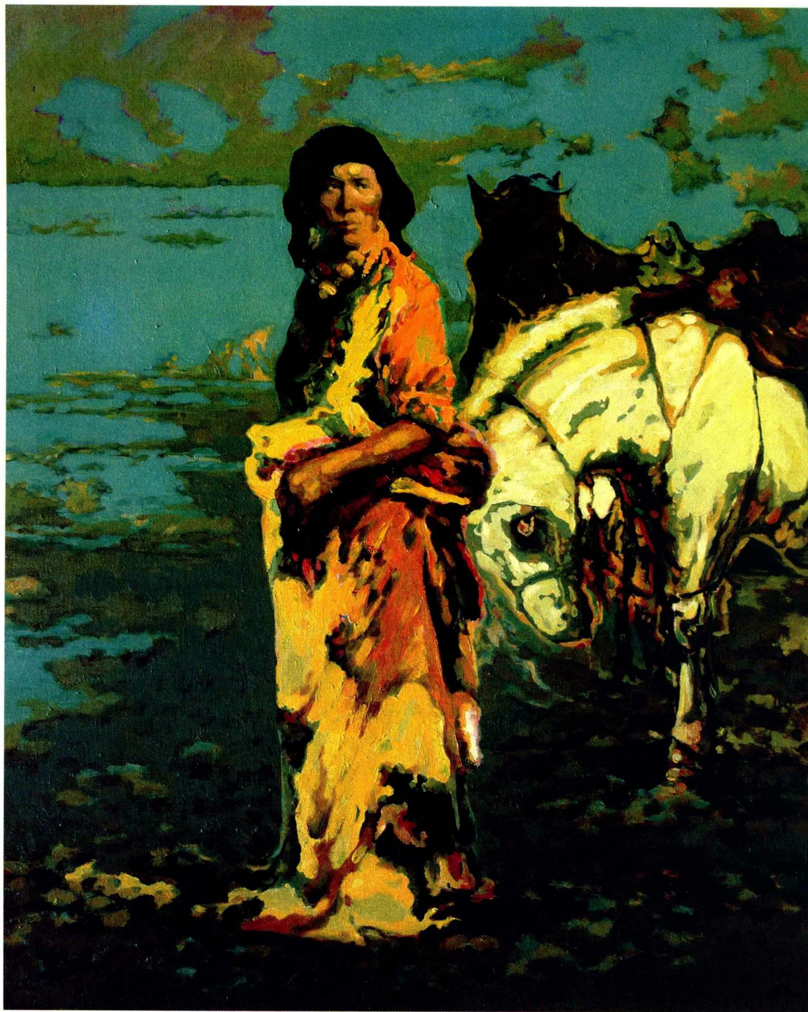
10 夕照卓玛 80 × 100cm