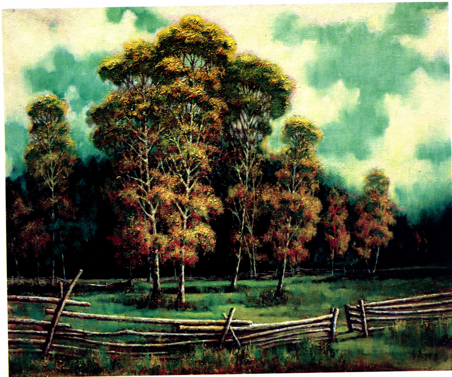
4 山林披绿 65 × 80cm Bright Green In Forest