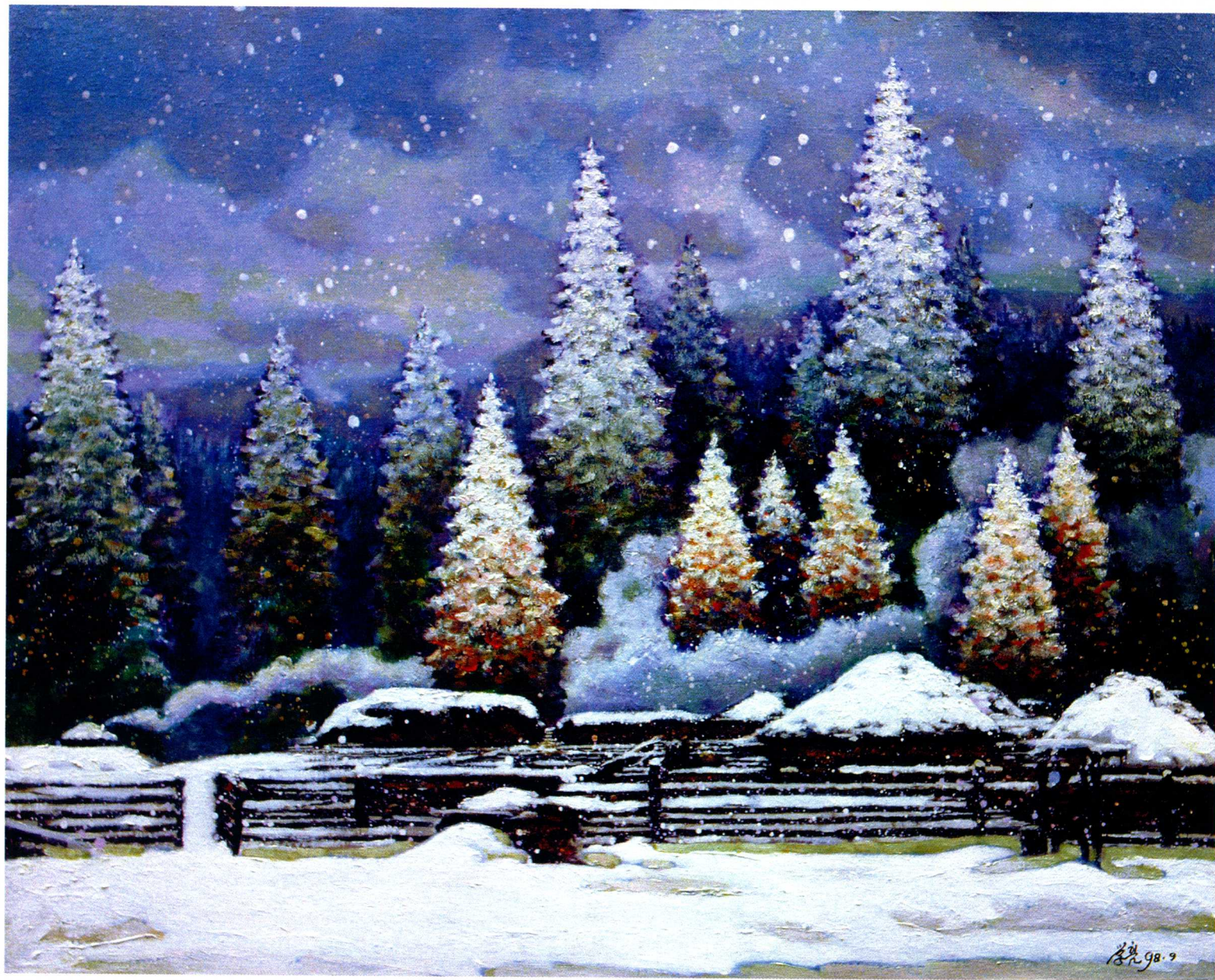
3 林区瑞雪 65 × 80cm Auspicious Snow