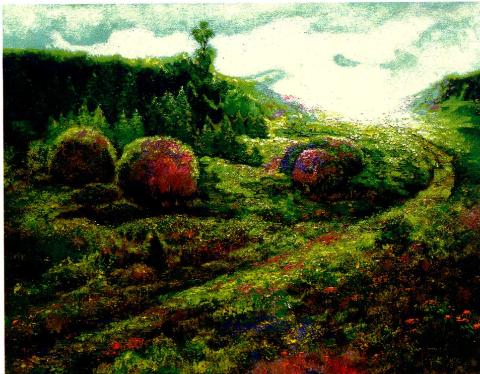
7 山路 65 × 80cm Winding Road Of Mountain