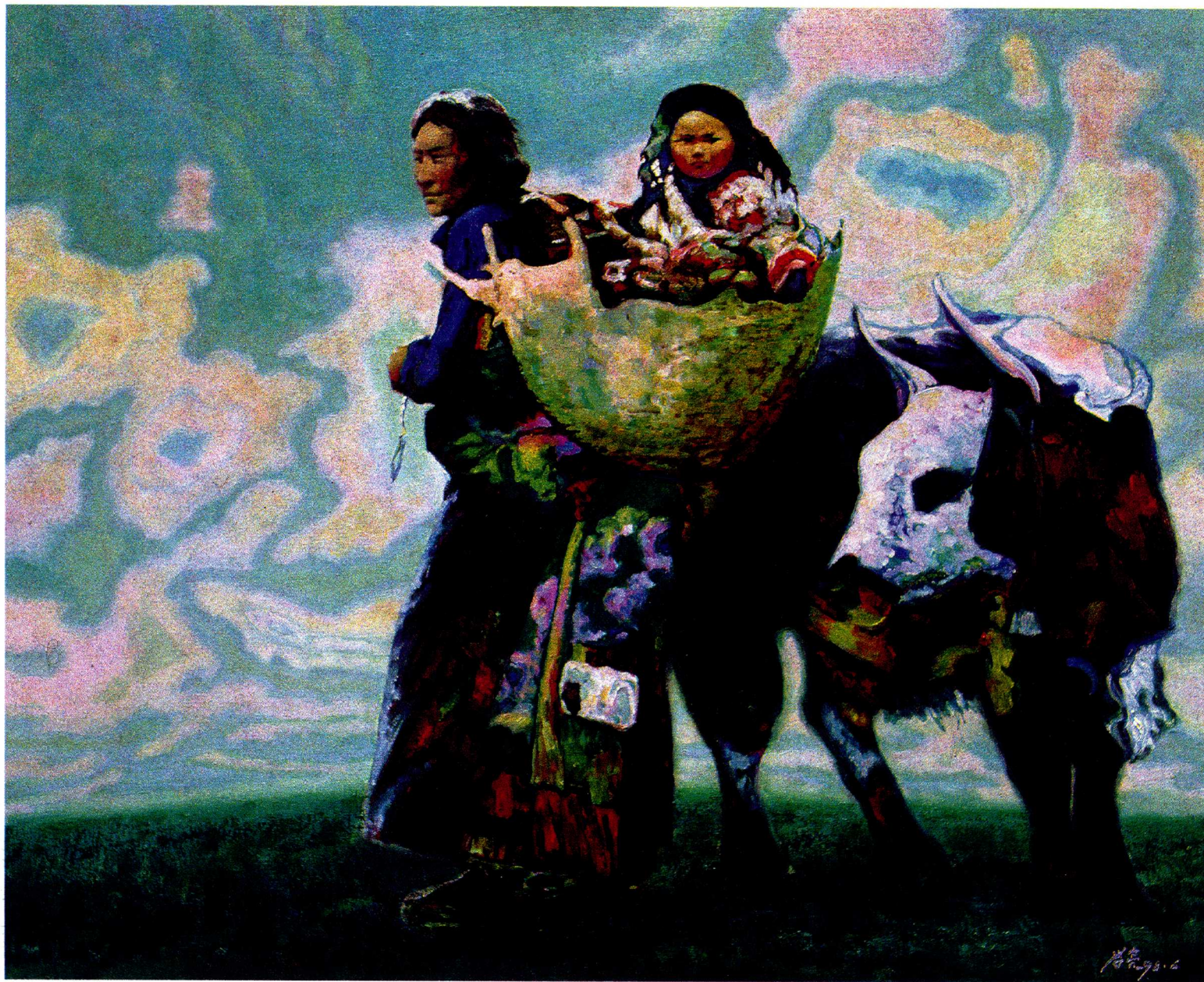
9 高原情 65 × 80cm Love For Plateau