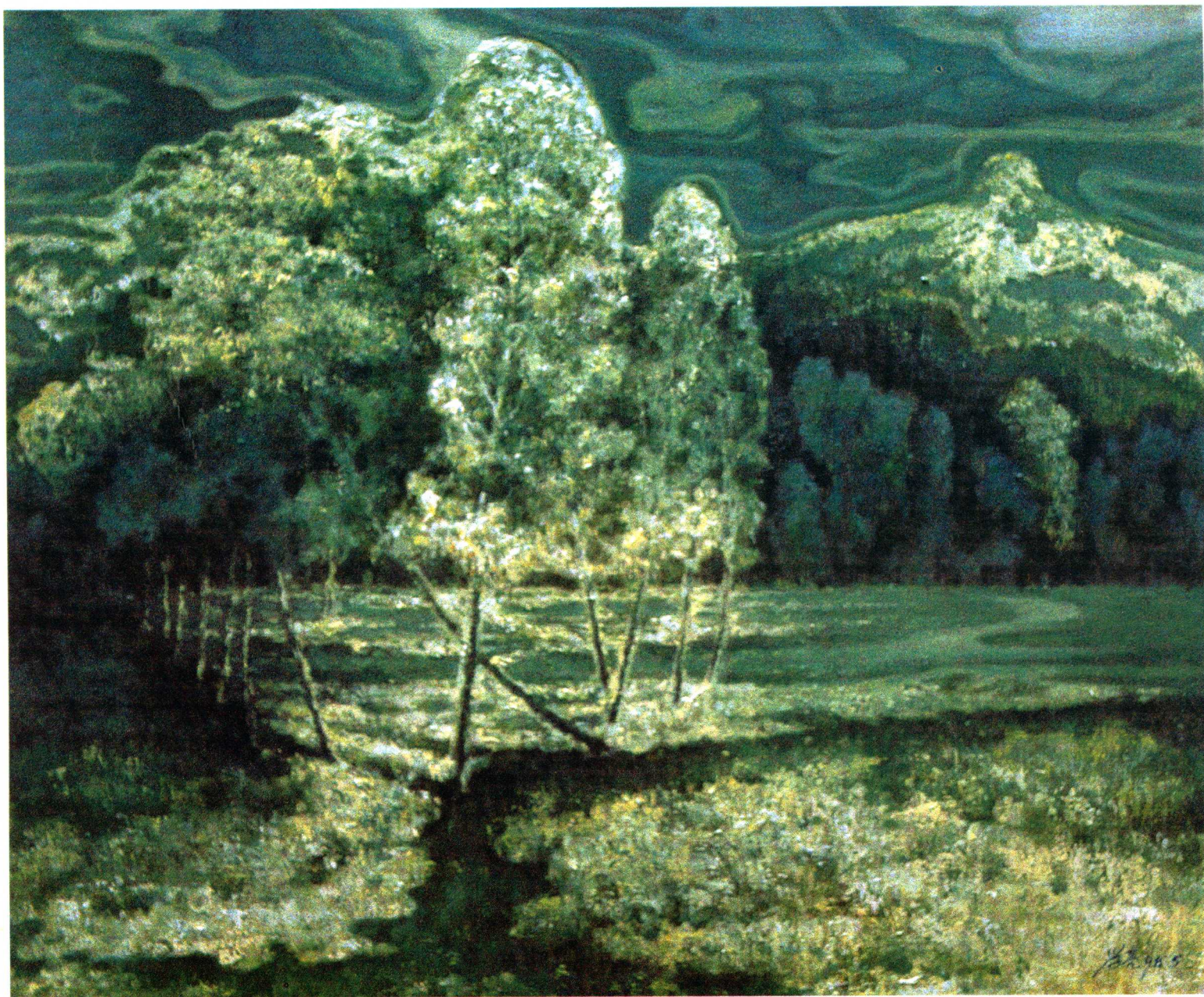
15 寂静的山林 50 × 60cm