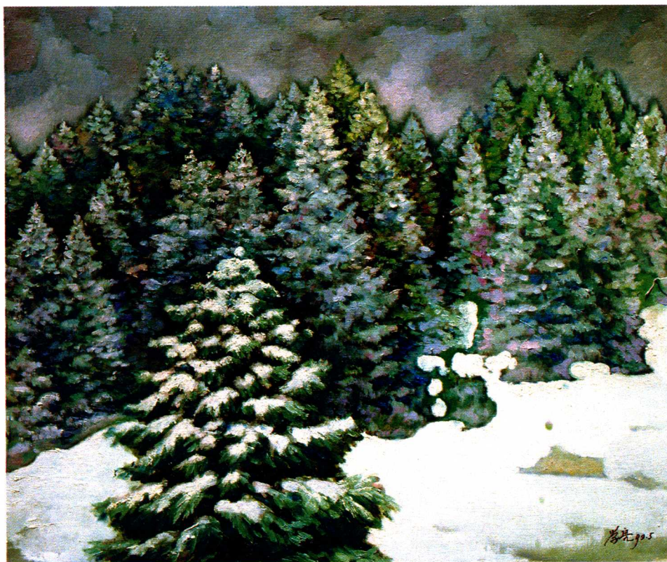
8 银装 50 × 60cm Silver World