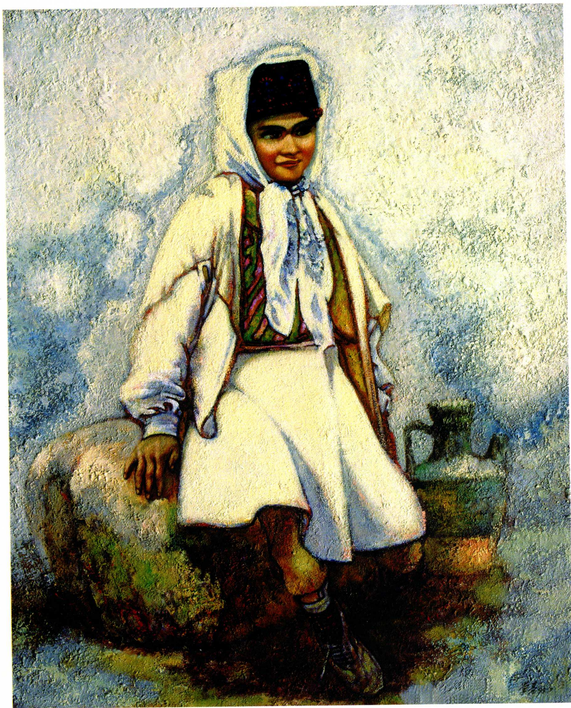
2 塔吉克少女 75 × 90cm Tagik Girl