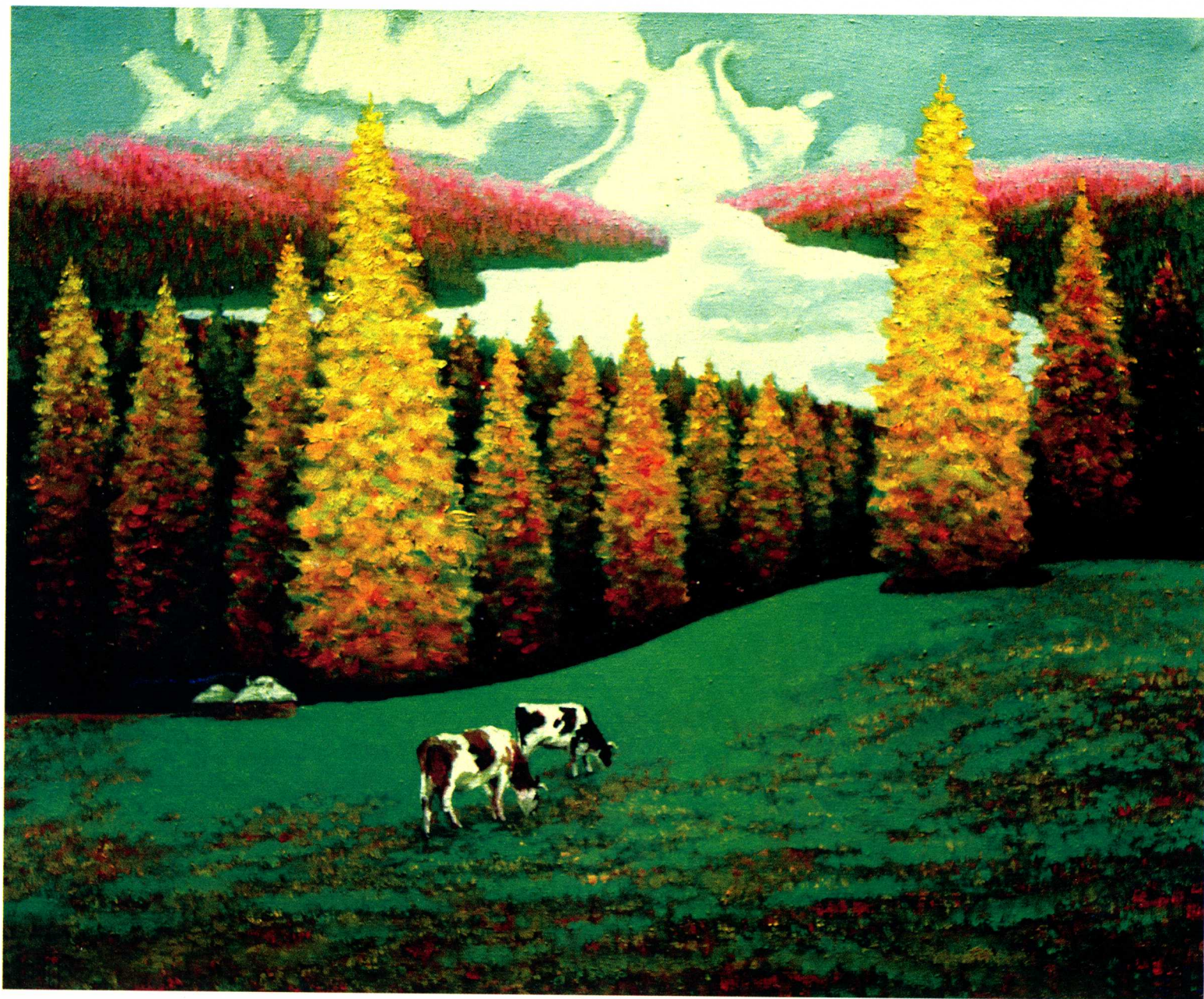
1 天山牧场 65 × 80cm