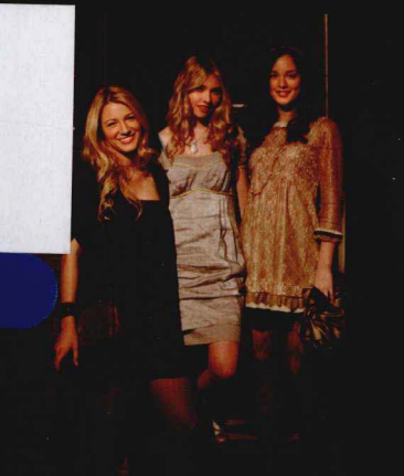
Gossip Girl 绯闻女孩