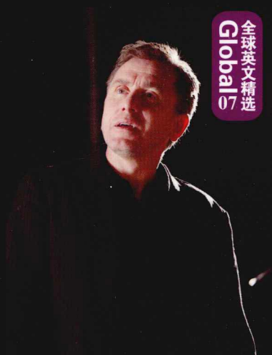
Lie to me 别对我撒谎