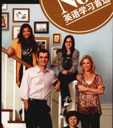
Modern Family 摩登家庭