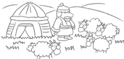
live a nomadic life

例句: The knowledge we use to judge is always based on a suspicious past, the knowledge of which is selective and formulaic .