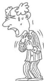
suffer from a fatal asthma

例句: Famed for its strong, yet delicate, aroma, Kampot pepper can range from intensely spicy to mildly sweet.