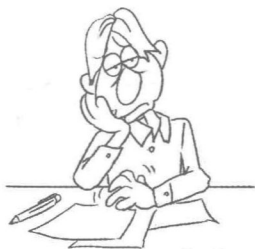
a drab and boring job

例句: The earbuds have three separate settings: one for planes, one for trains and buses, and one for general office hubbub .