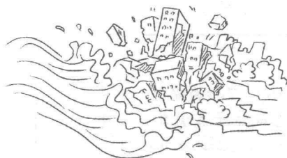
a catastrophic collapse

例句: Gold is still a barbaric relic whose value rises only when inflation is high.