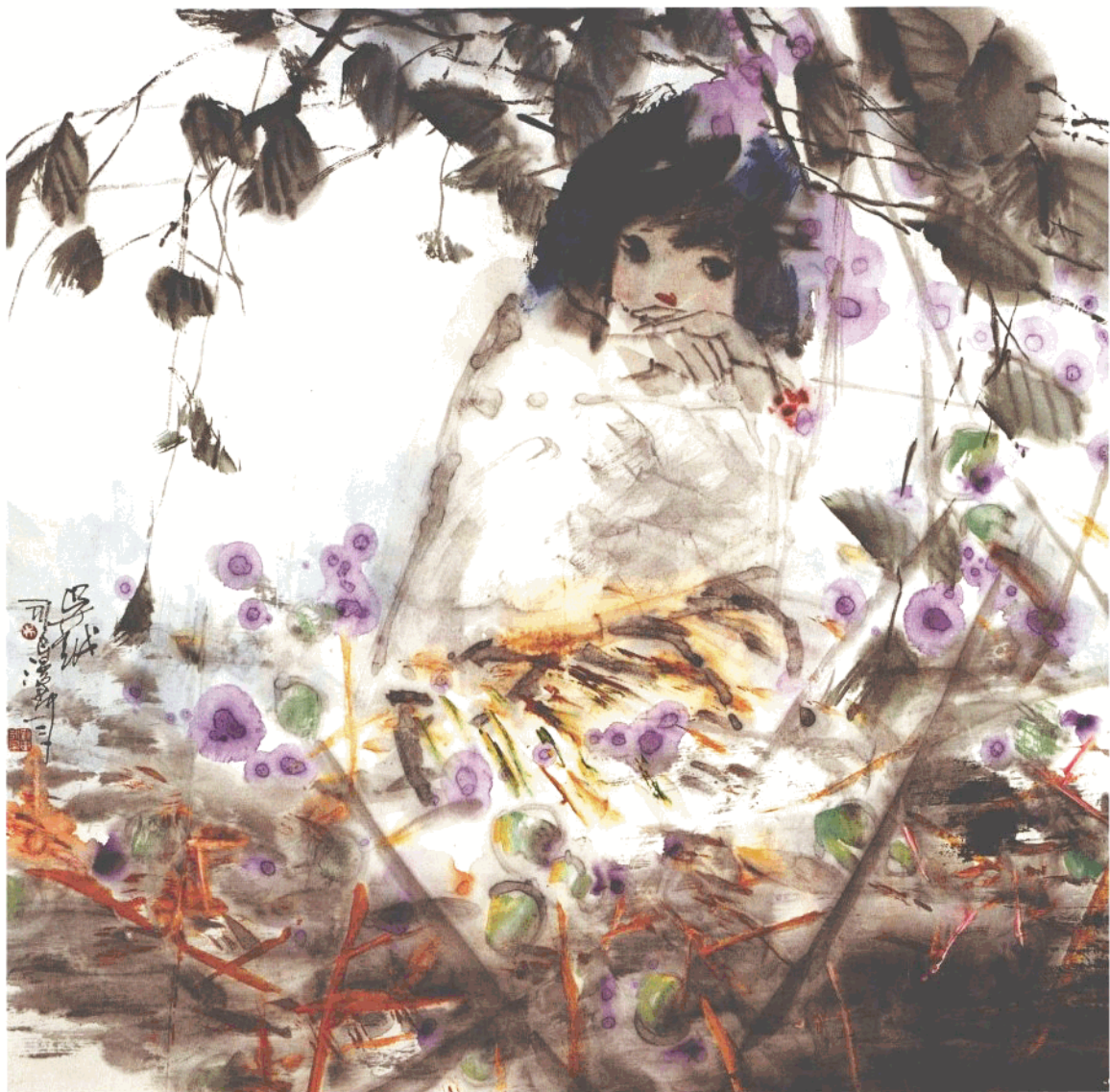
春韵 吴永良 Spring Charm Wu Yongliang