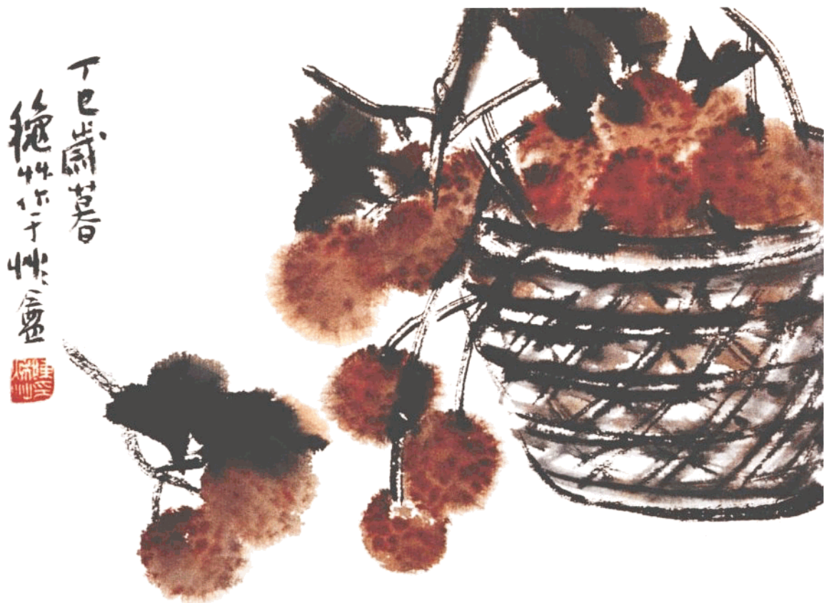
荔枝筐 陈秋草 Litchi Basket Chen Qiucuo