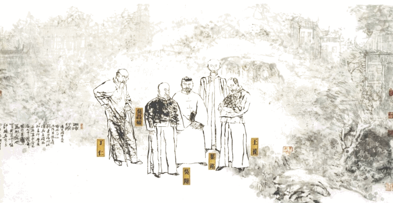
西泠印踪 吴永良 Xiling Signets Wu Yongliang