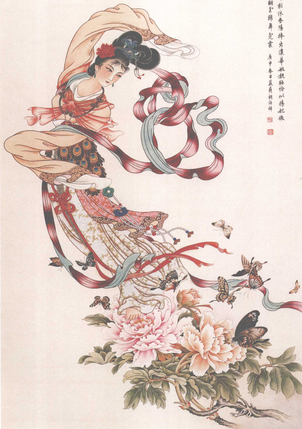
牡丹花神 Peony blossoms goddess