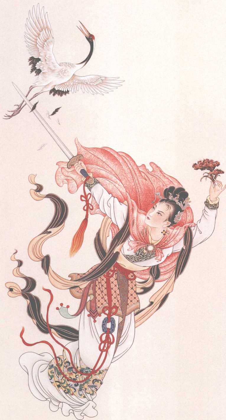
白娘子盜靈芝 White fairy maiden steals the Ling Zhi herb