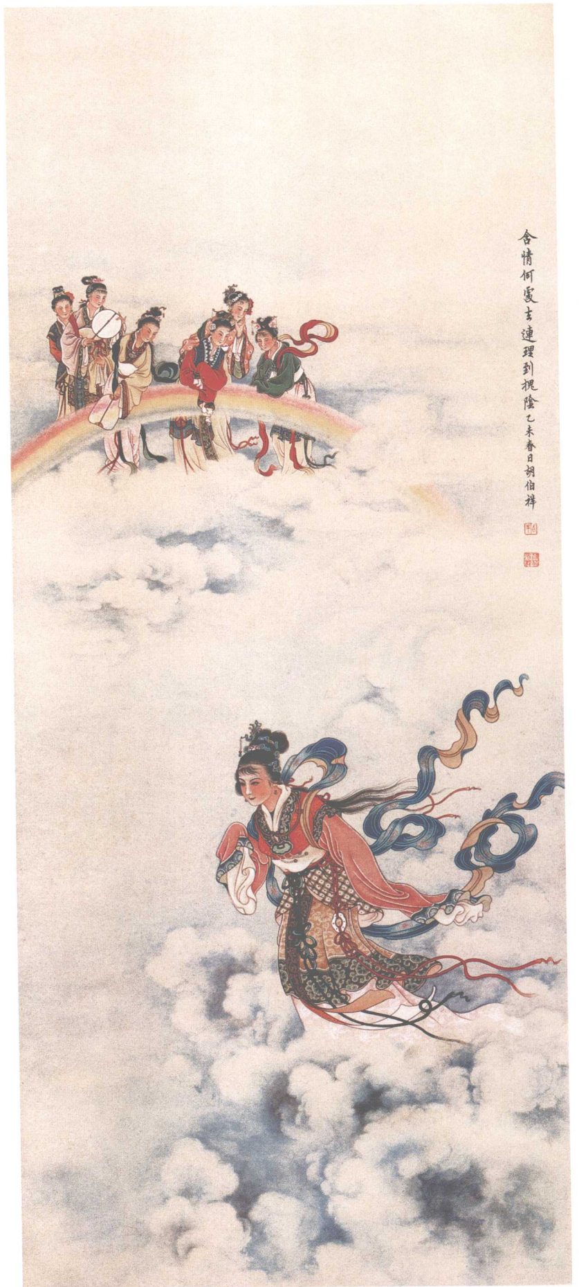
七仙女思凡 7 th Fairy maiden misses earthly love