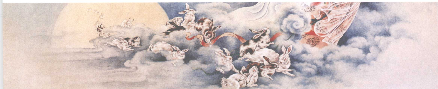
胡伯祥作品 Art work of Hu Boxiang