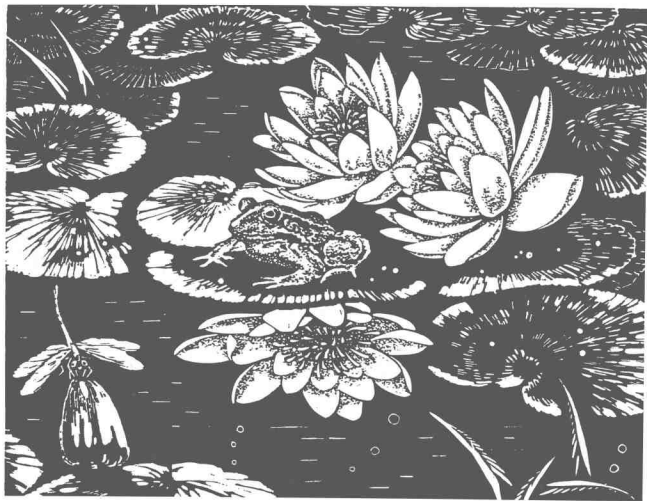
荷塘蛙趣 21.3 × 27.1cm 1981年