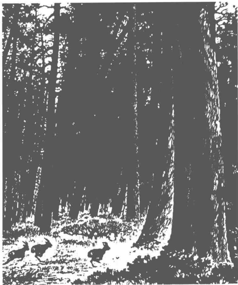
归林 28 × 23cm 1983 年