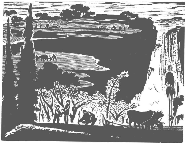
寸土如金 21.4 × 27cm 1981 年