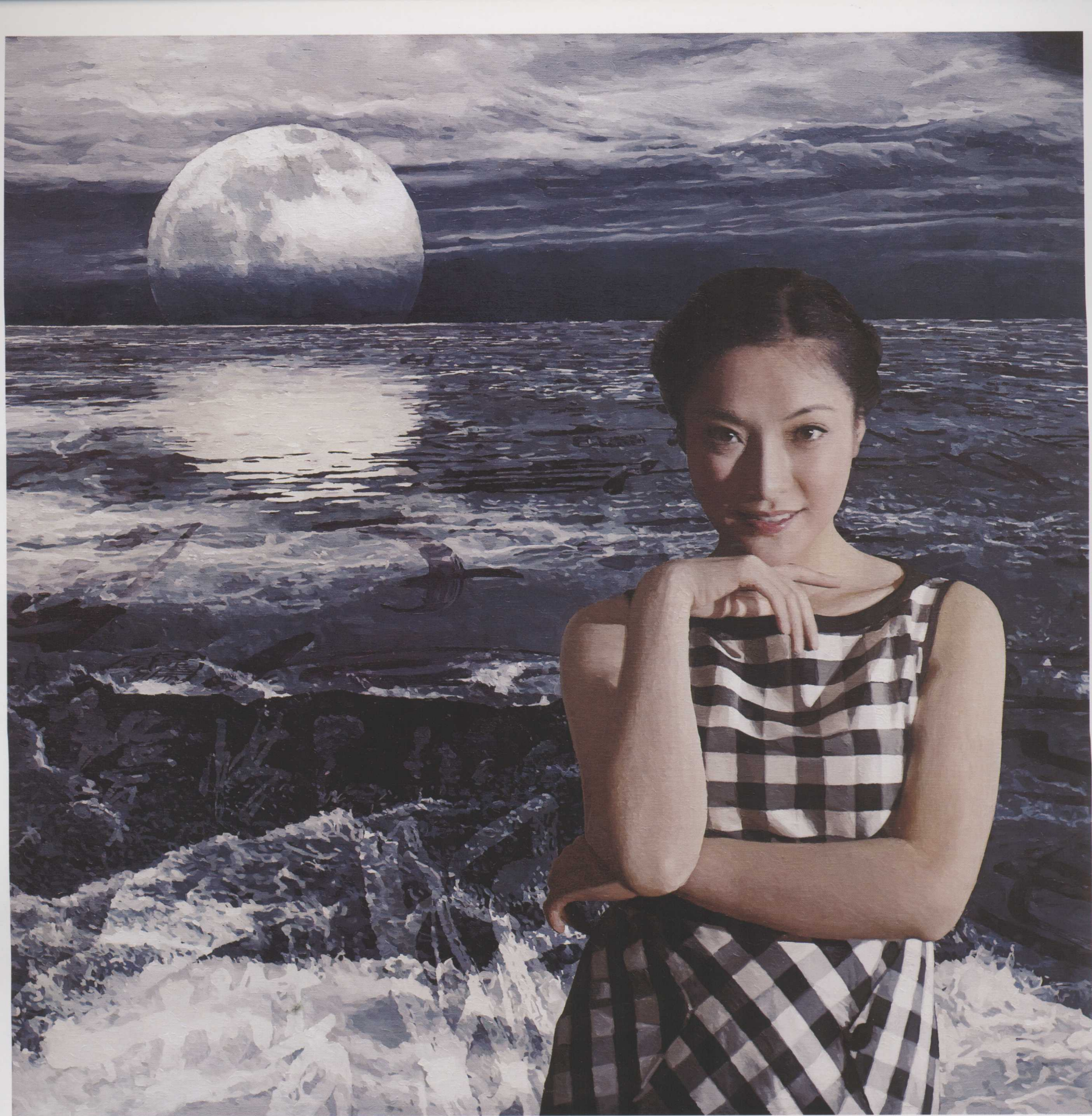
那時明月 The Moon in the Past