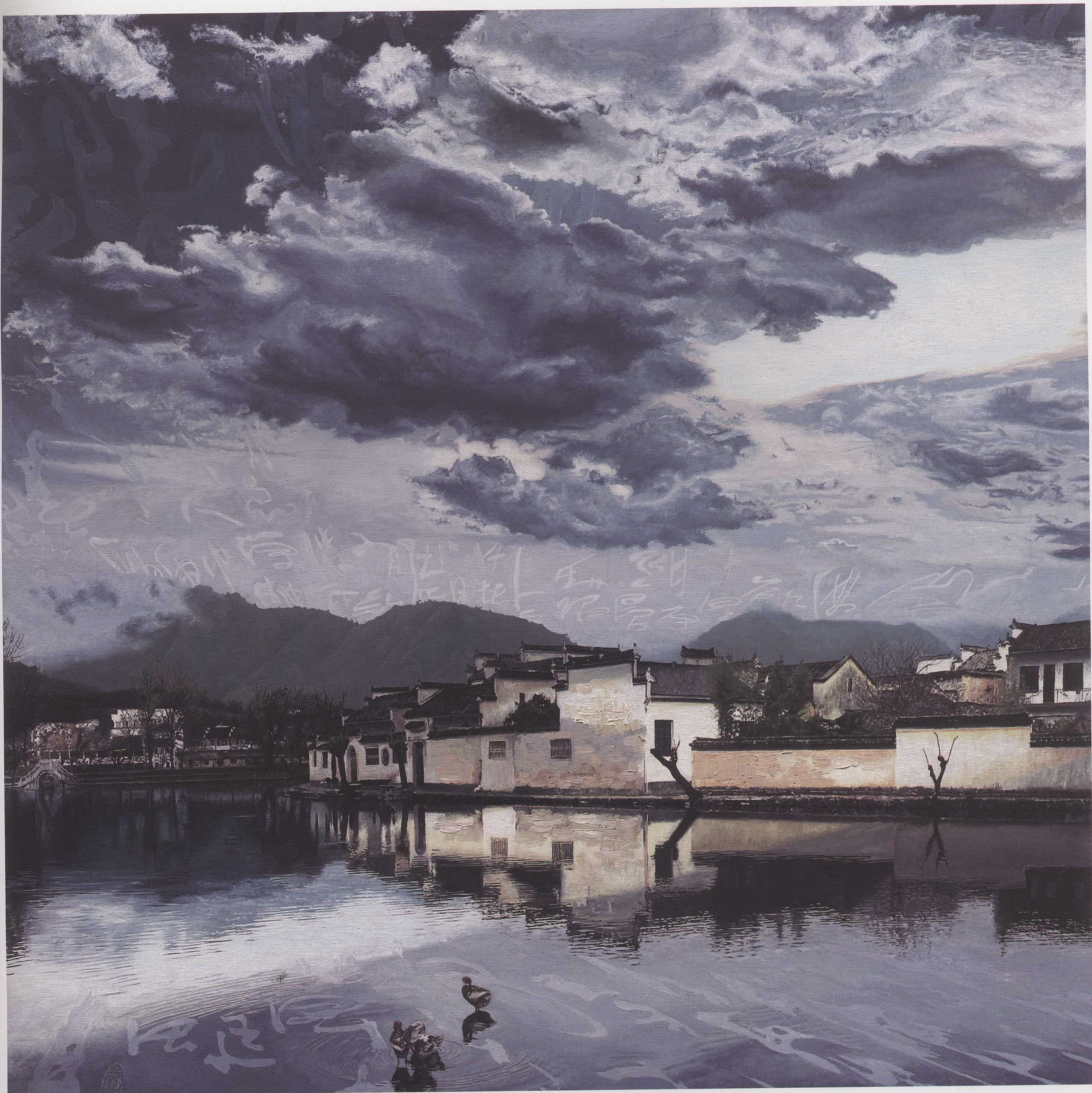
遐雲 Reverie of Cloud