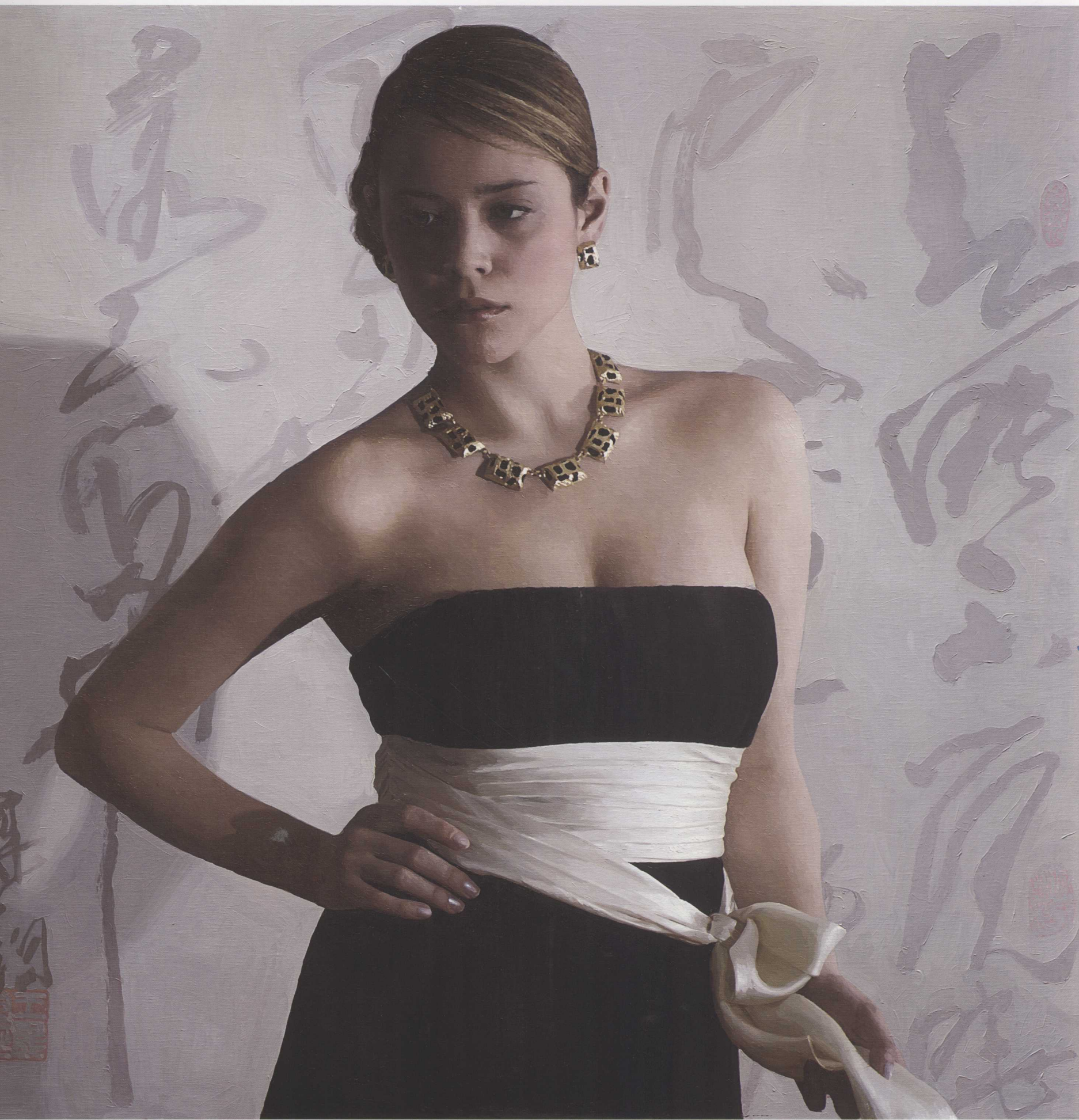
曉色朦朧 Obscure Color of Dawn