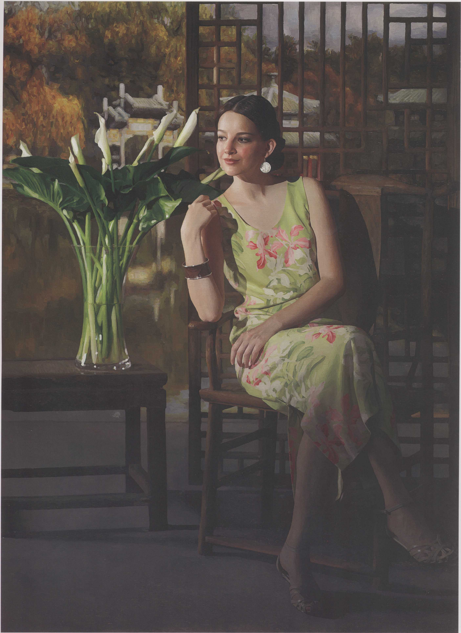
秋怡 Delightful Harmony in Autumn