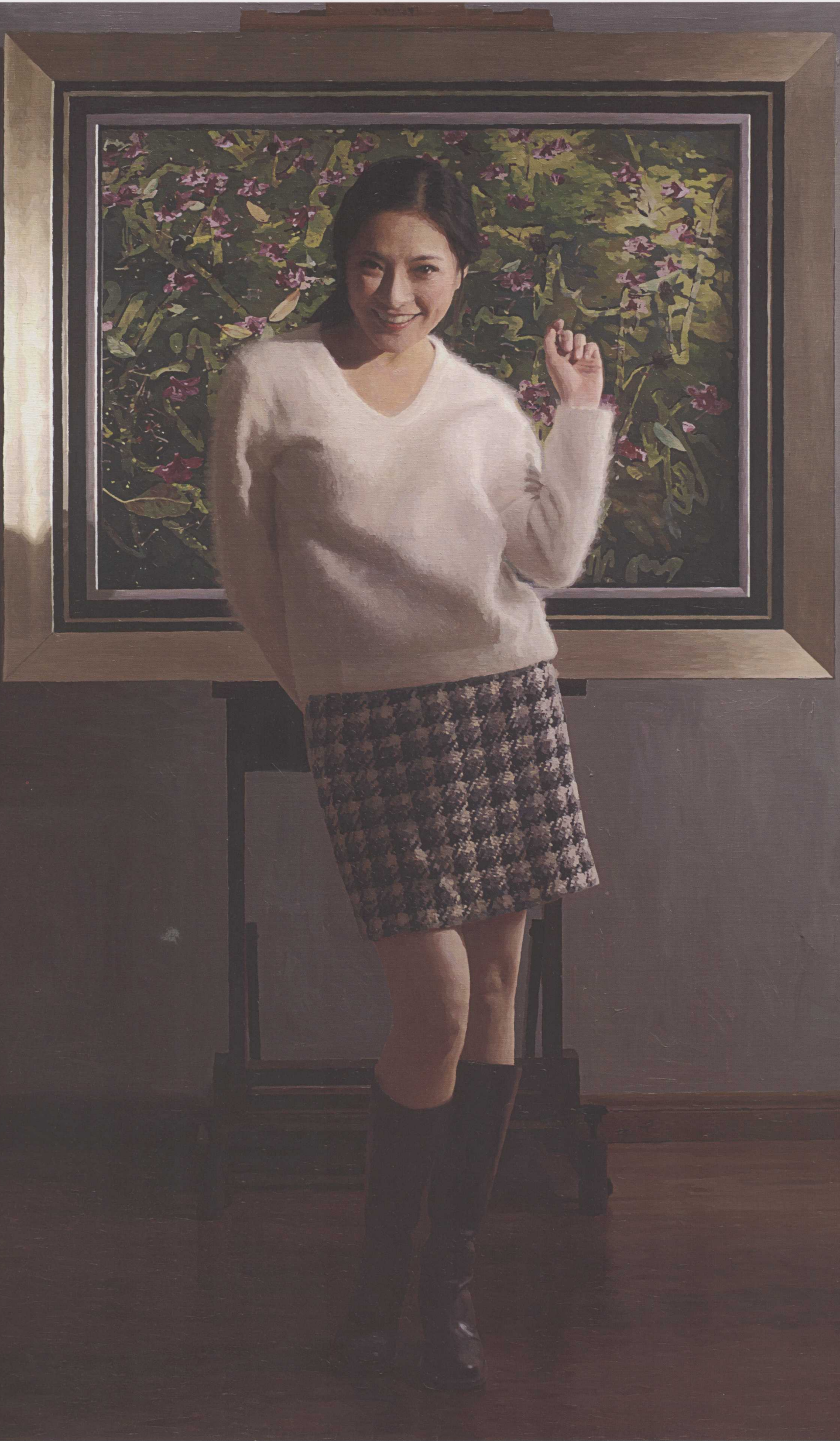
春之協奏曲 Sonata of the Spring