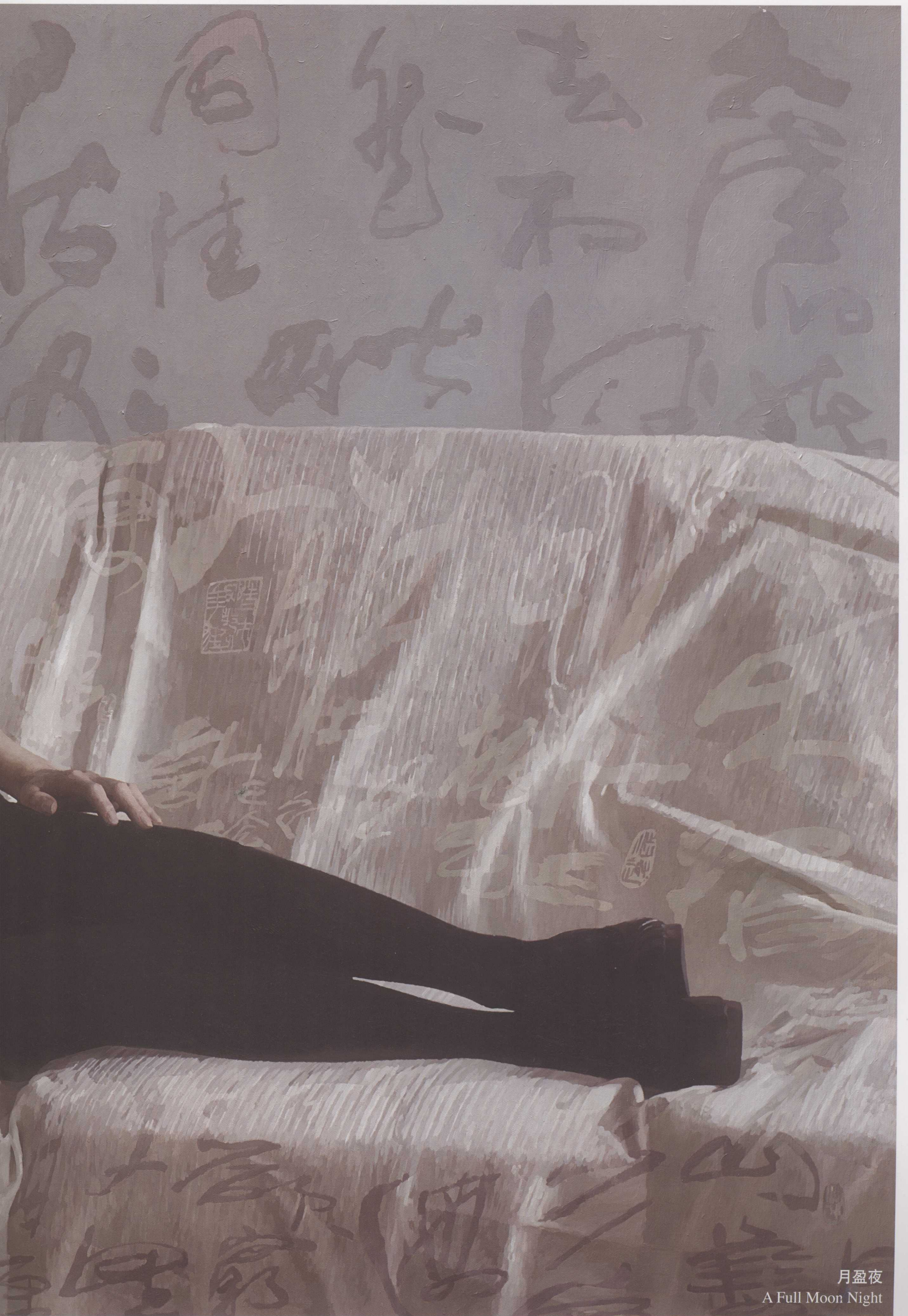
月盈夜 A Full Moon Night