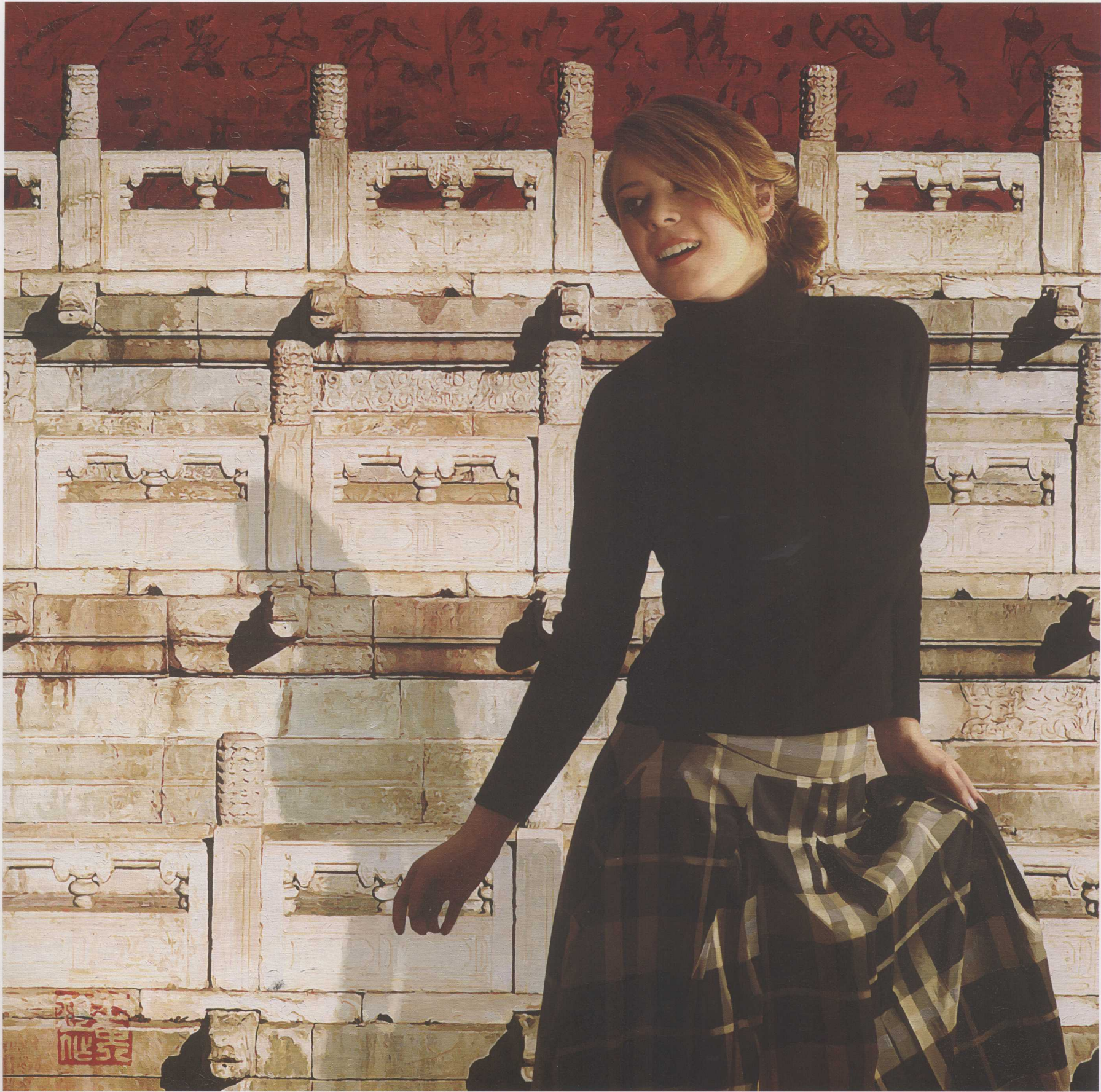
暢想三重奏 Ensemble of Thought