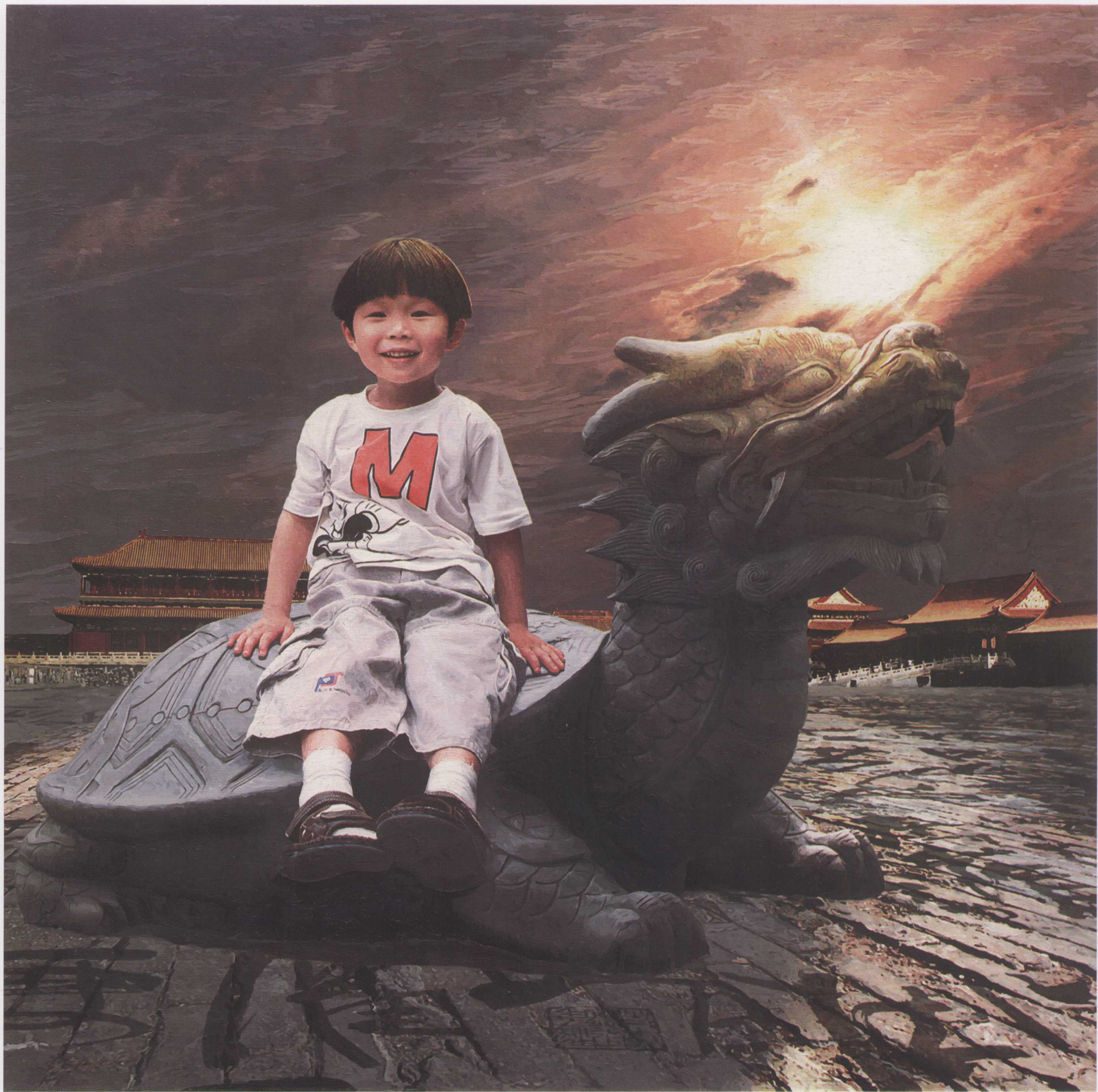
史與今 Past and Present