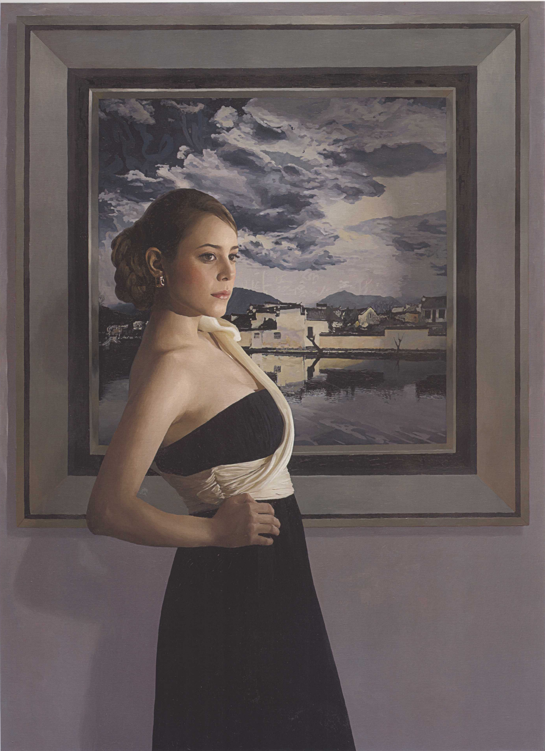
畫外天際 The Skyline Is out of the Picture