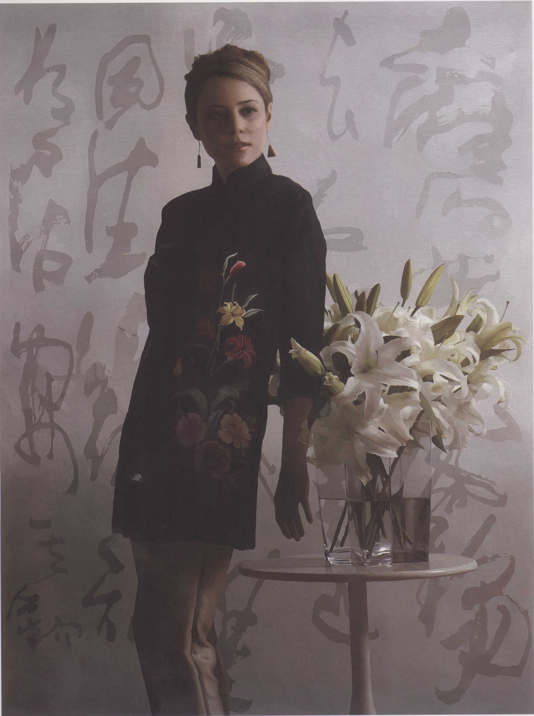
涵語 Language of Exuding Tenderness and Love