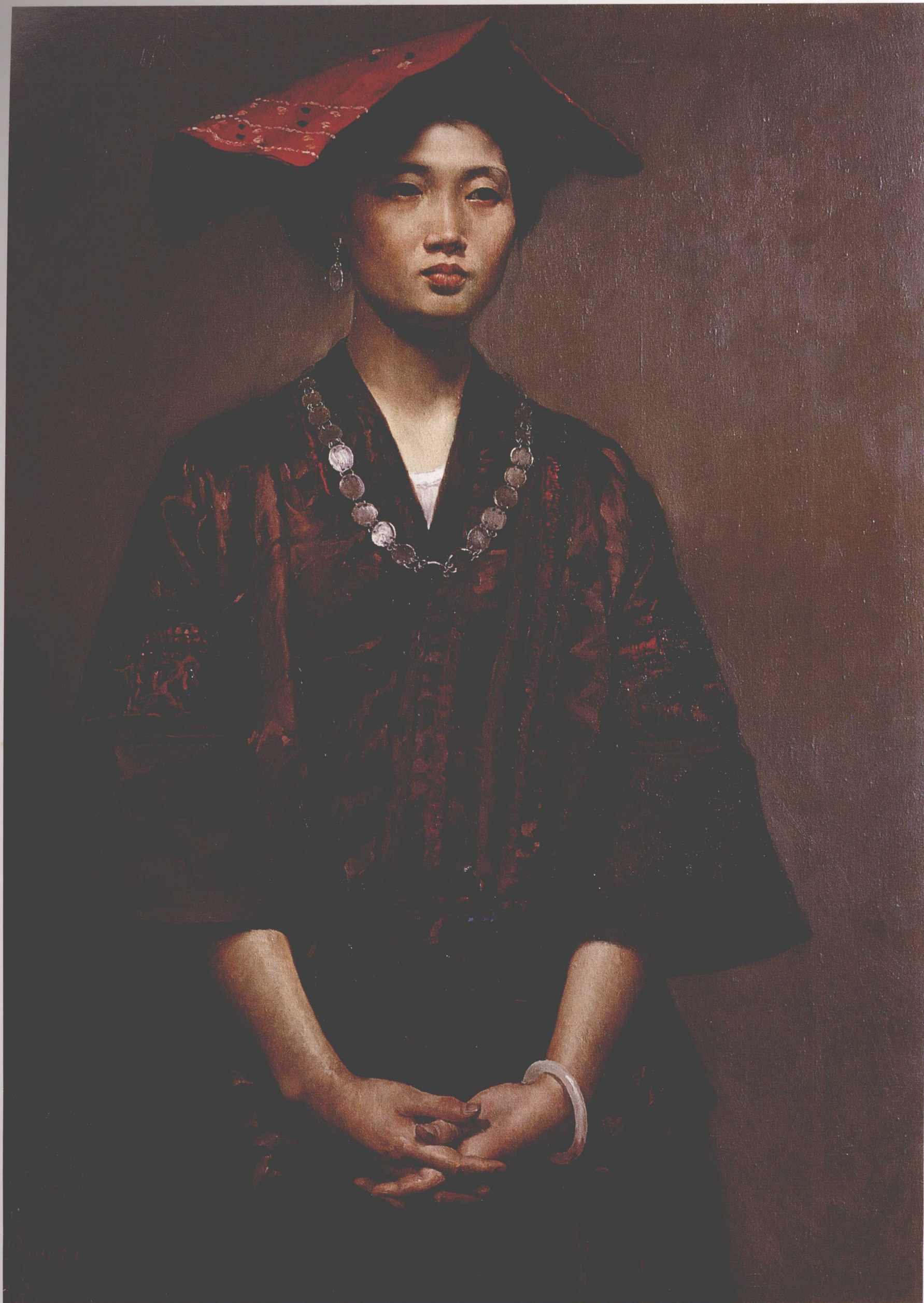
山女 A Mountain Girl