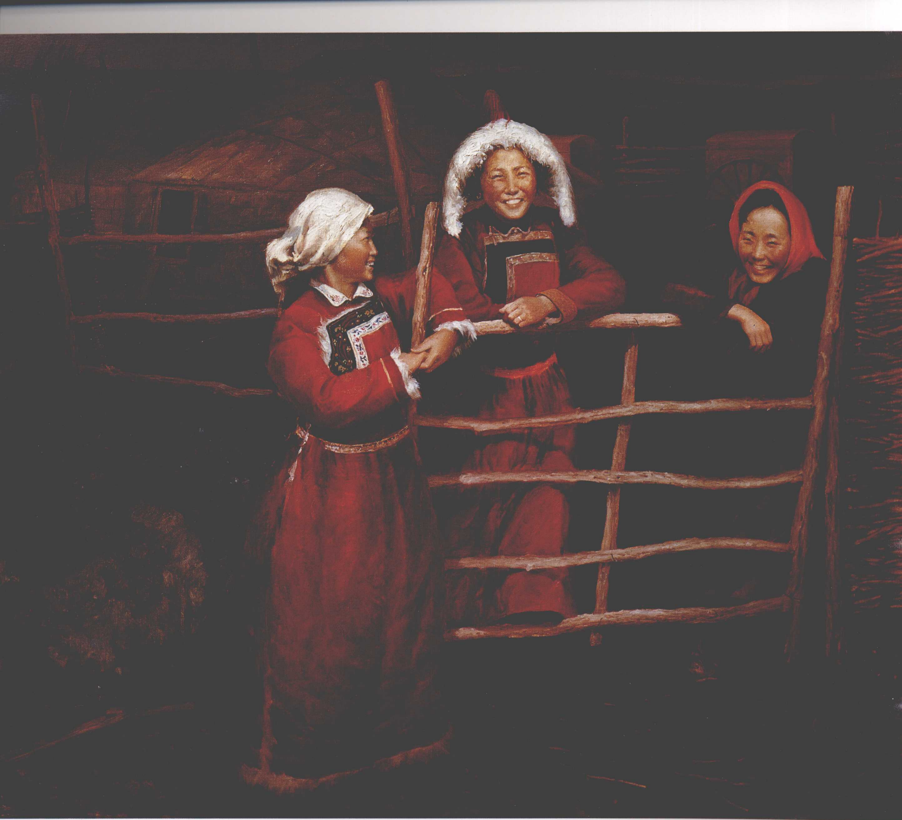
開春 Woman's Joy at the Beginning of Spring