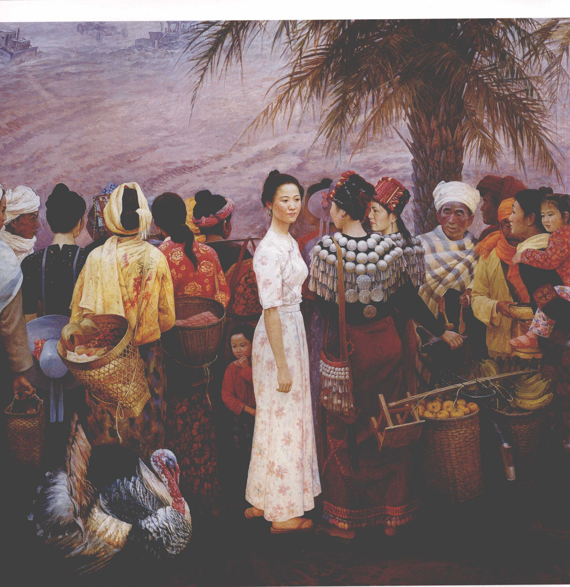
初晴 Scene of Just Clear up