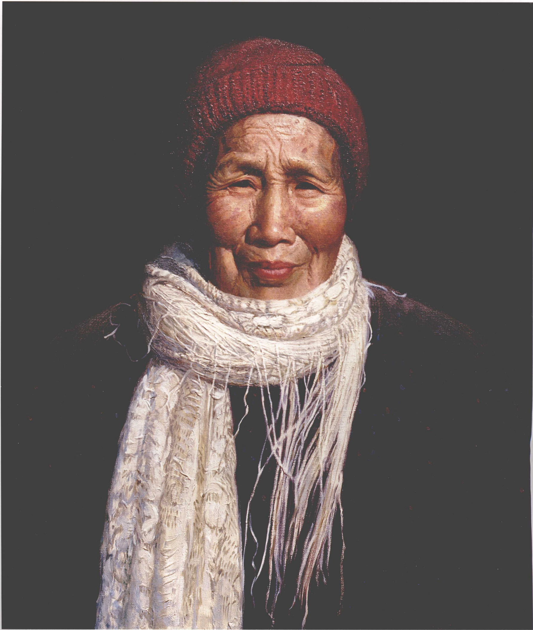
慈祥的老人 An Old Woman with a Kindly Face