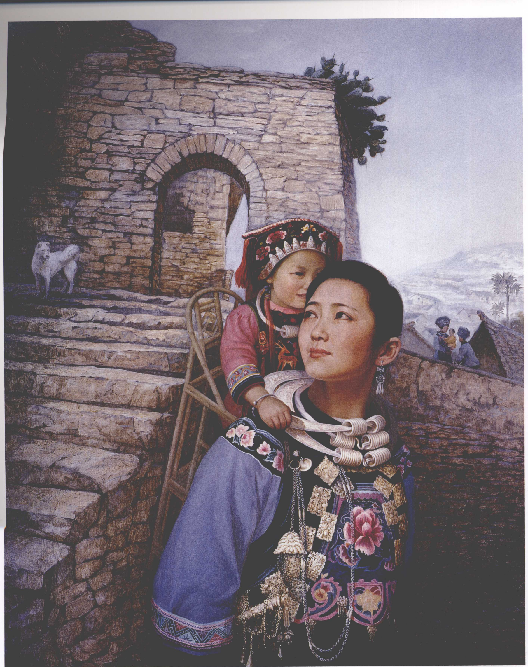
走娘家 Returning to Her Parent's Home