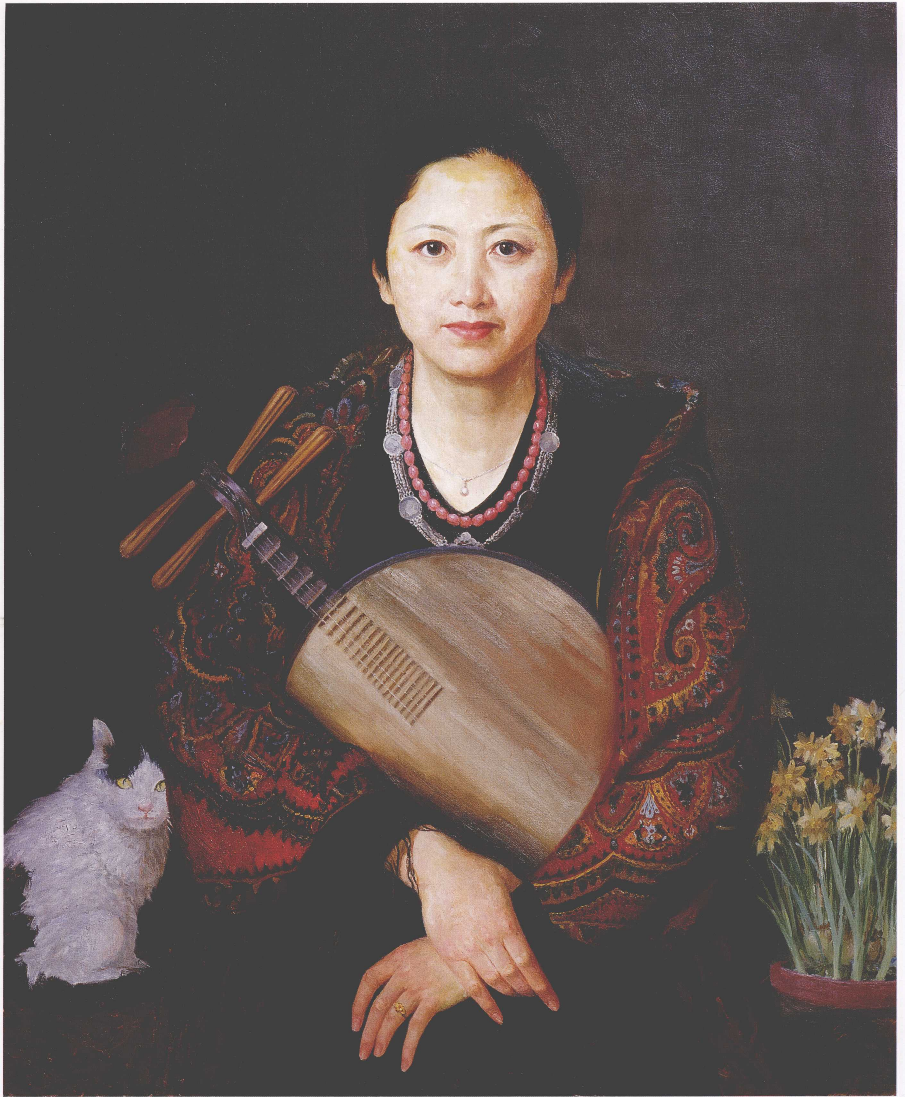
琴韵 A Charming Lady with a Musical Instrument