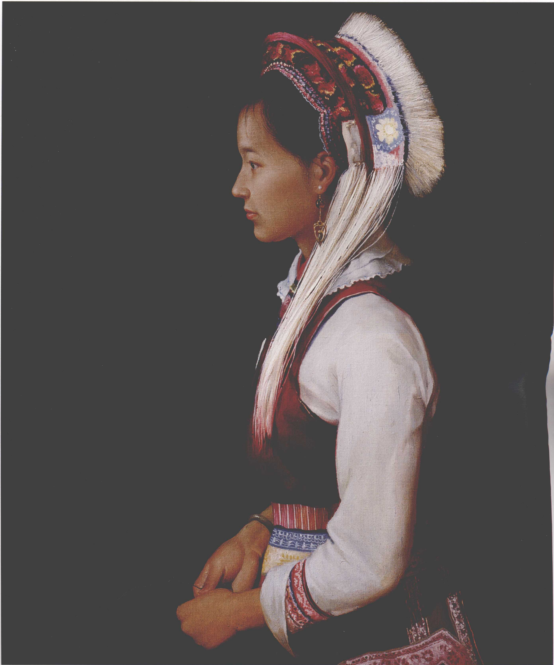
三月 A Young Lady in March