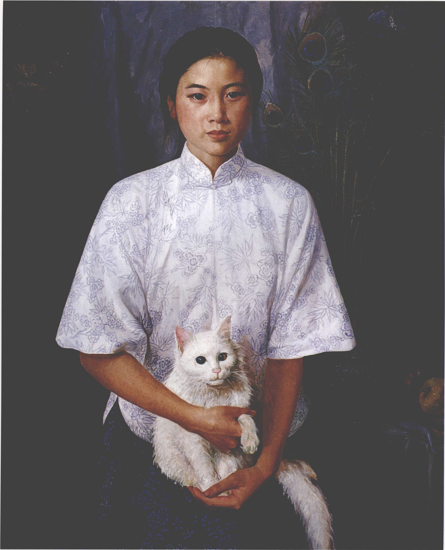
少女與猫 A Young Lady and a Cat