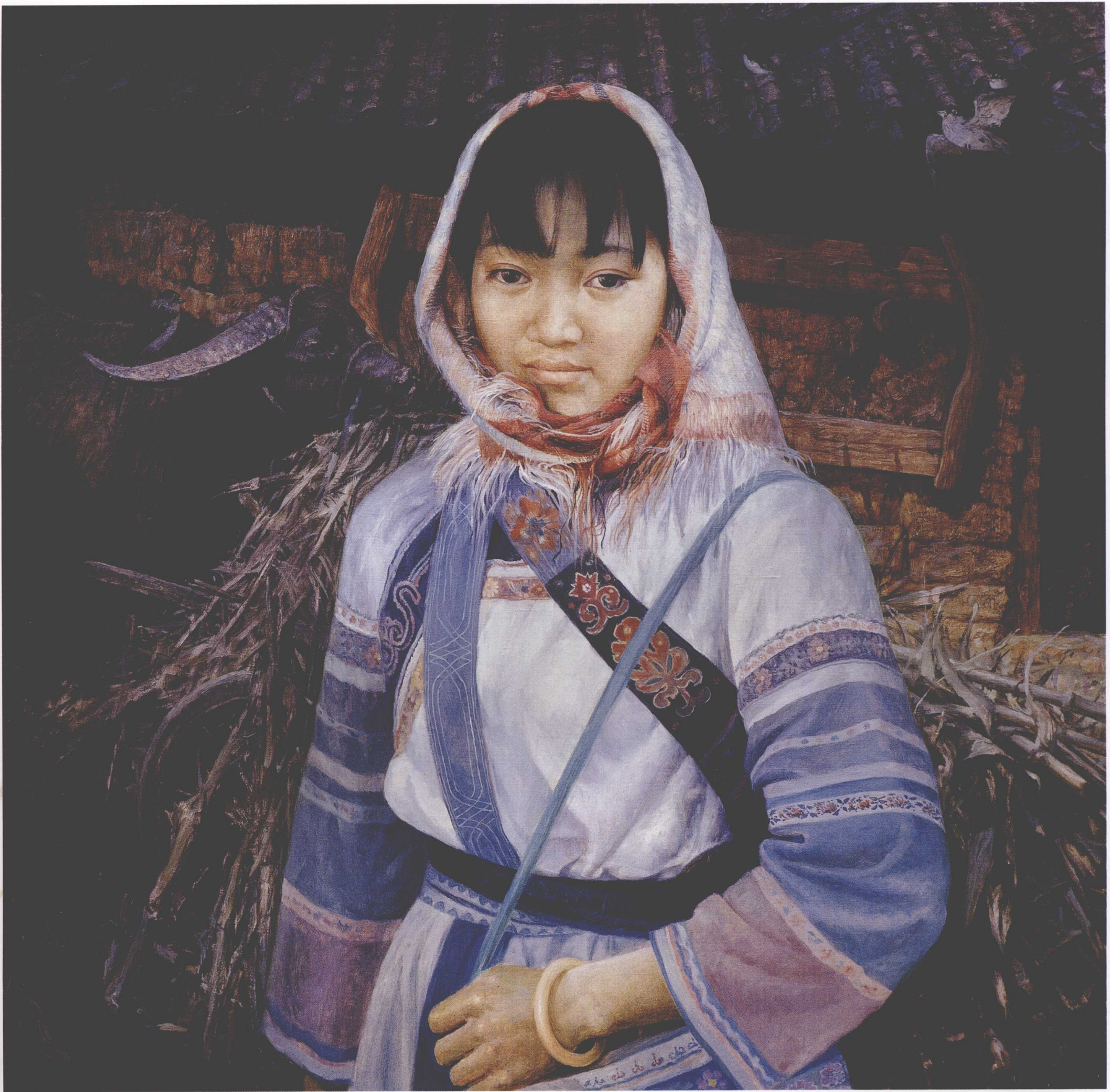
小院 A Village Yard