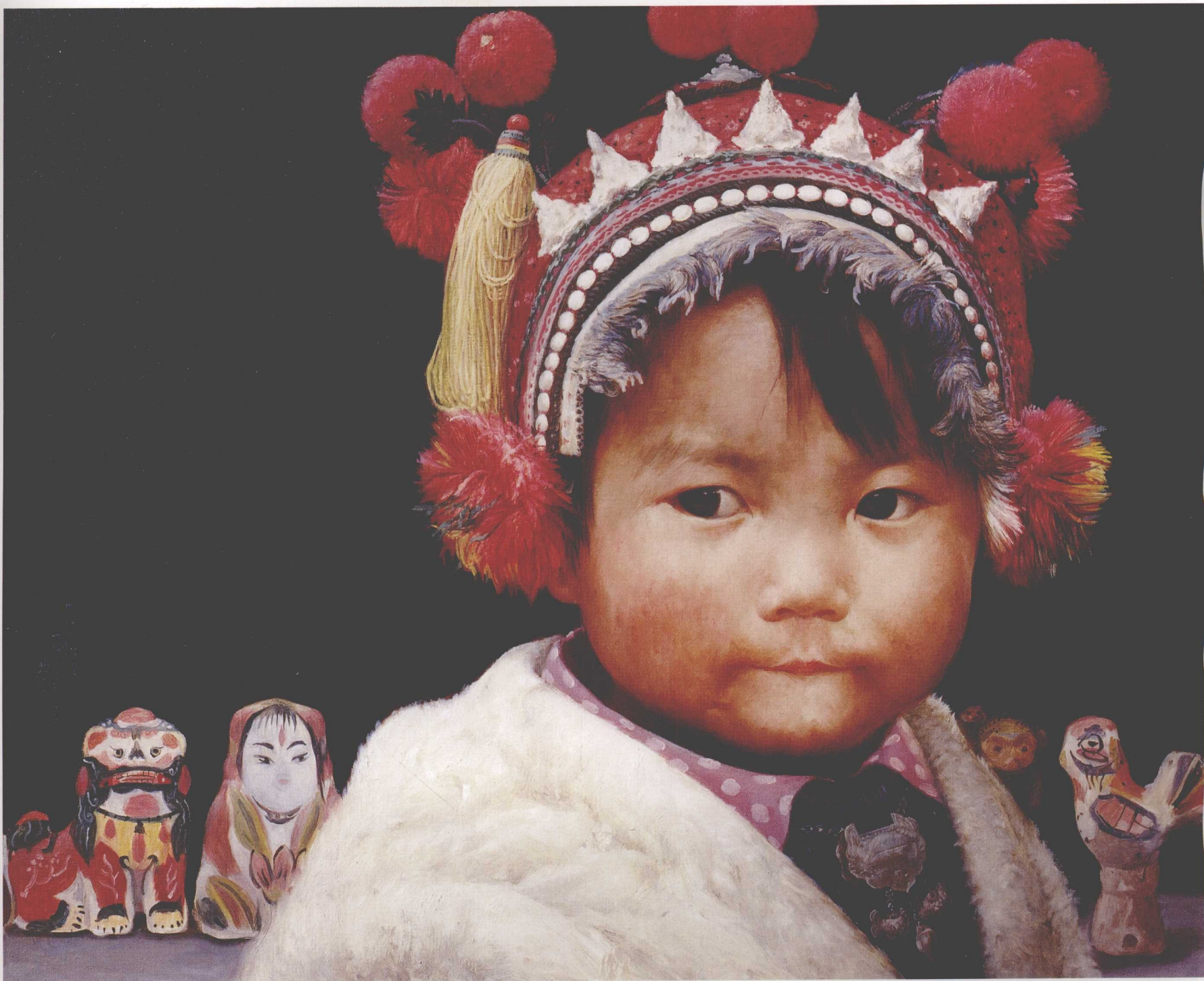
泥娃娃 A Clay Baby