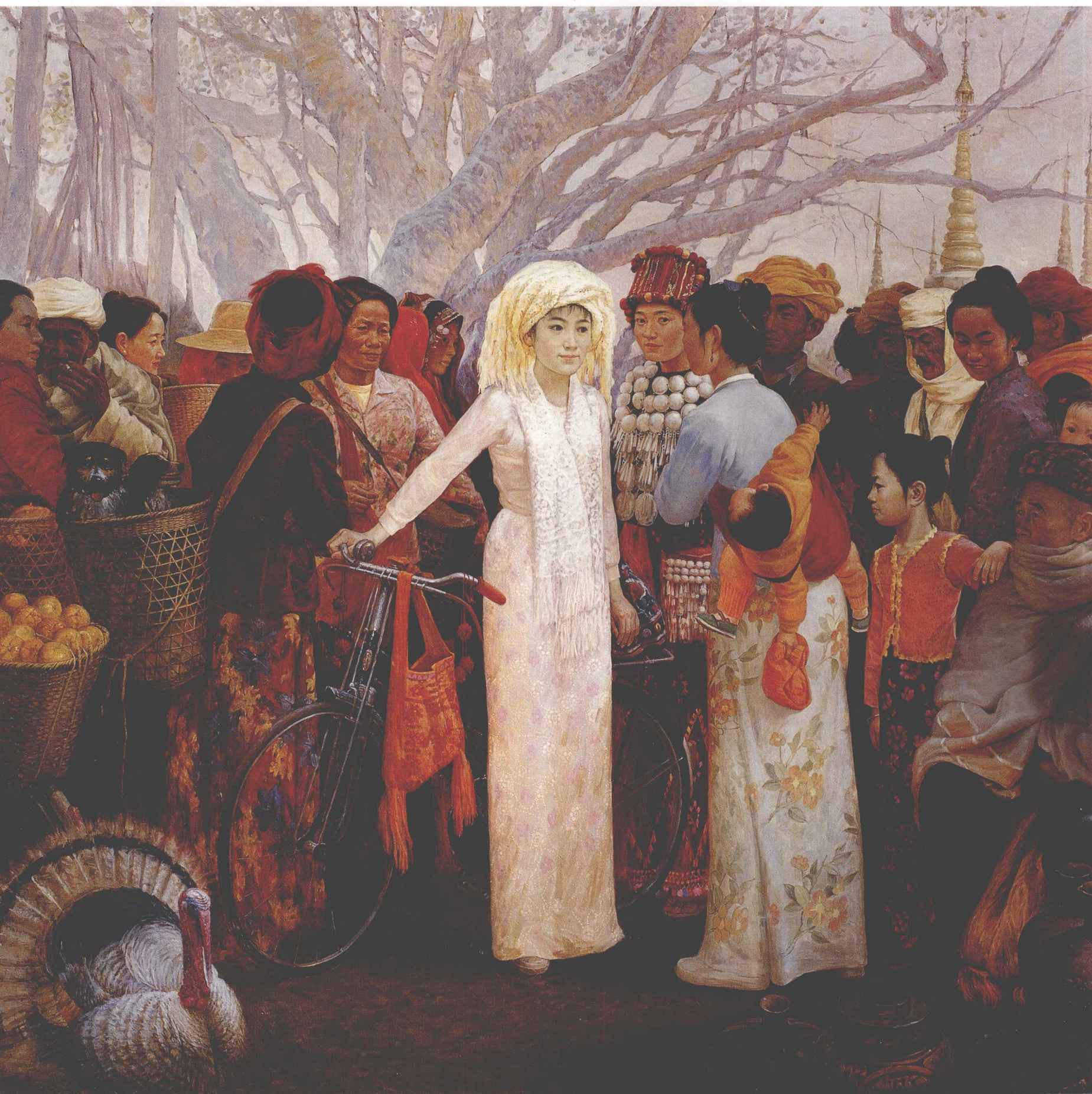
大榕樹 People Under a Big Banyan Tree