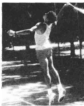
Table Tennis & Badminton