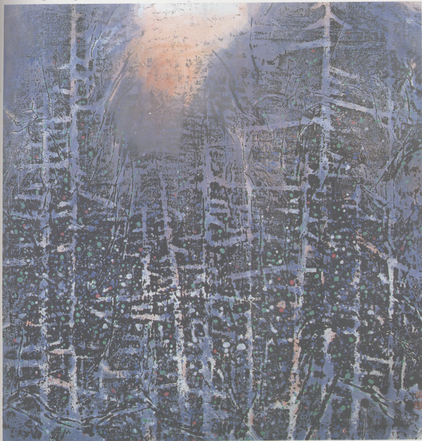
1. 林 曦 (89×96cm) Sunlight through woods