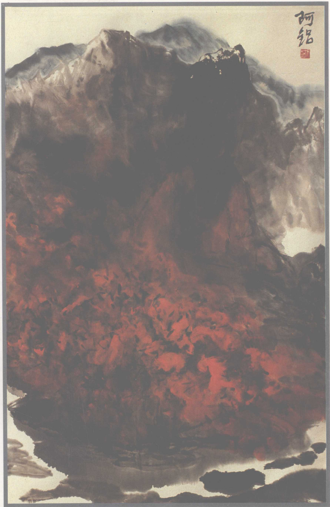
3. 無題 Nameless 1990年 (60×96)