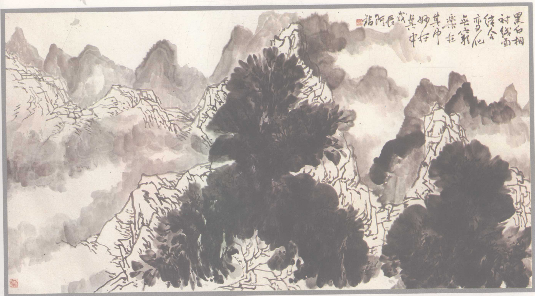
5. 水墨山水 Landscape in Ink 1988年(96×179)