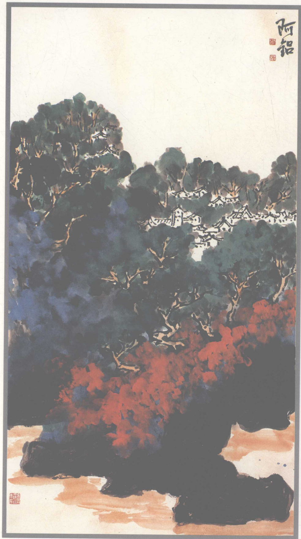
4. 綠蔭 Green Shade 1988年 (82.5×151)