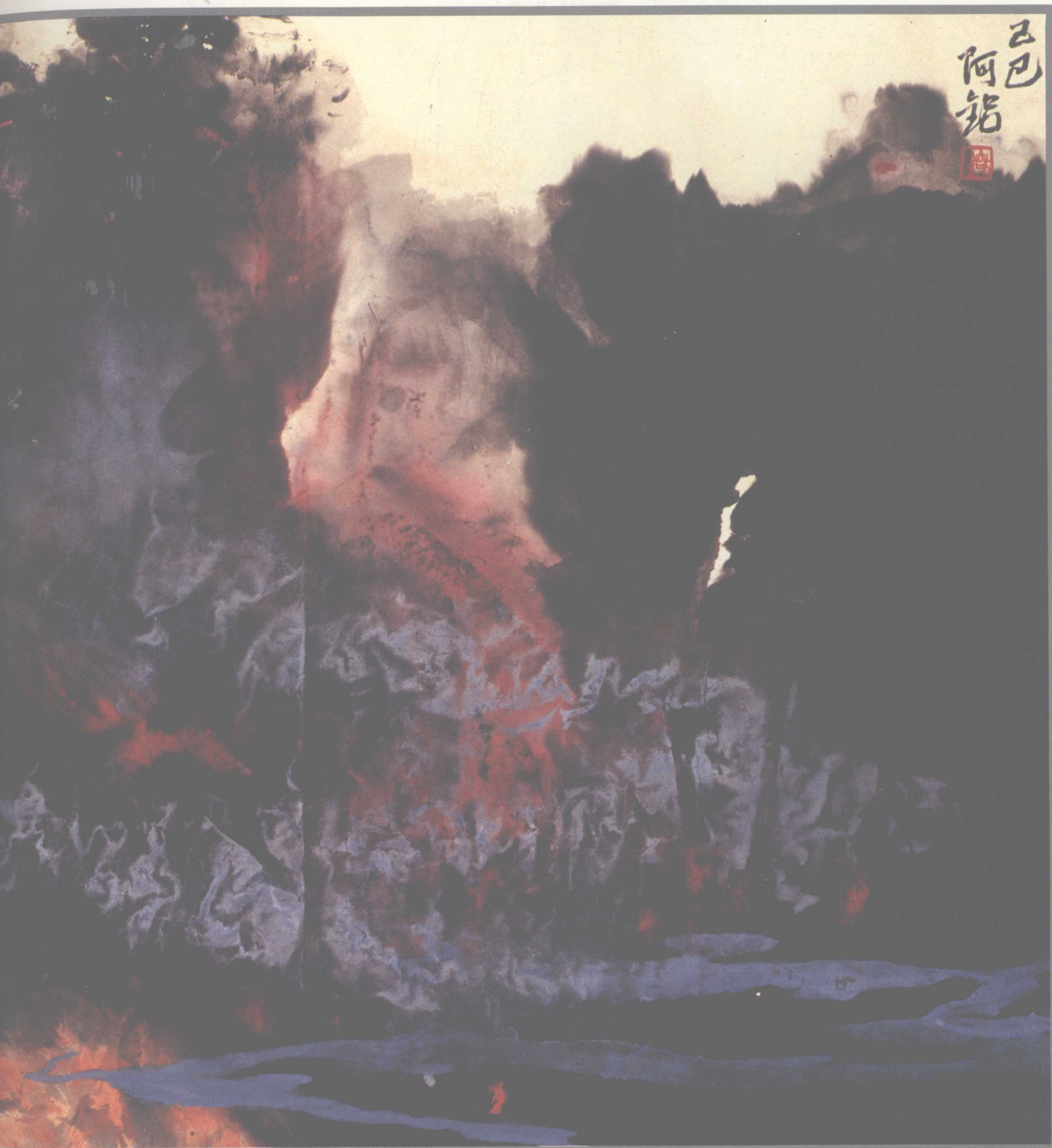
1. 山魂 Spirit of the Mountain 1989年(120×235)