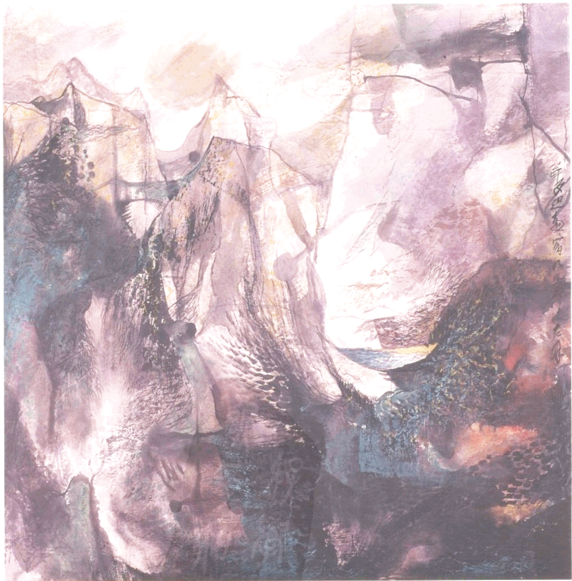
● 暮色 (國畫) 100 × 89cm ● Evening Scene (Chinese painting)