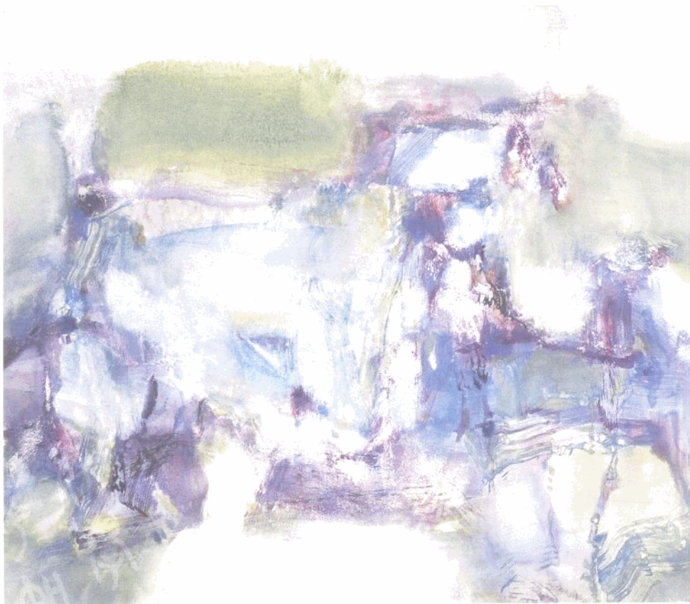
● 靜靜的領域（水粉） 53 × 72cm ● Tranquil Land (gouache)