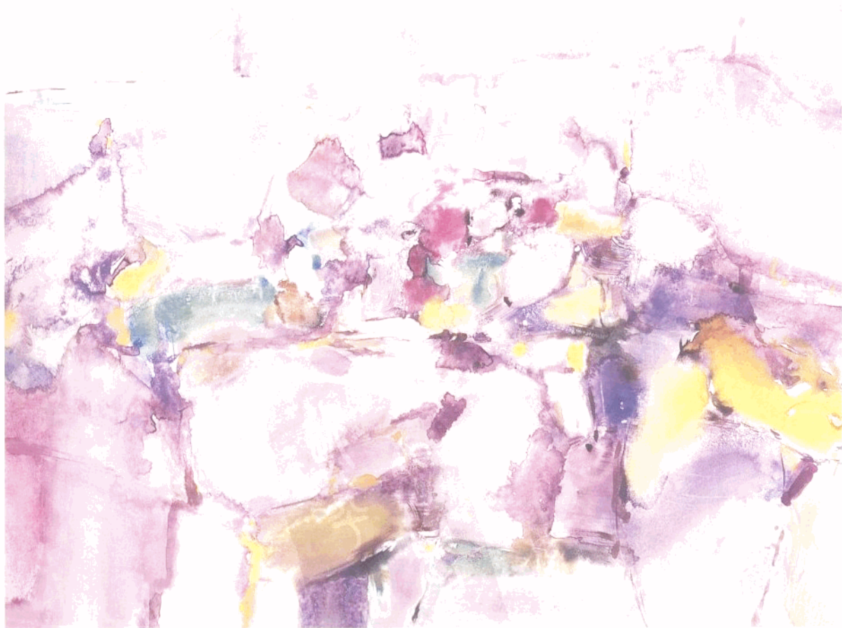
● 心象邊緣 (水粉) 53 × 72cm ● Border of the Imagery (gouache)