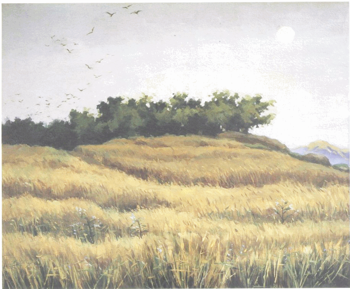
● 暮归 (布面油画) 65 × 81.5cm