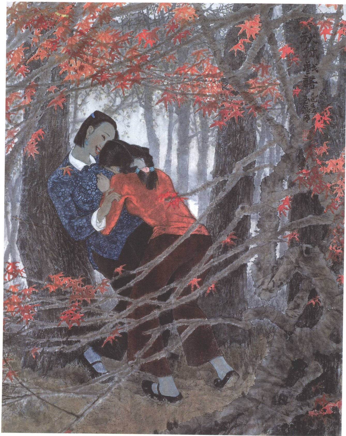
11、秋林戲語 119×93 Fun in autumn woods