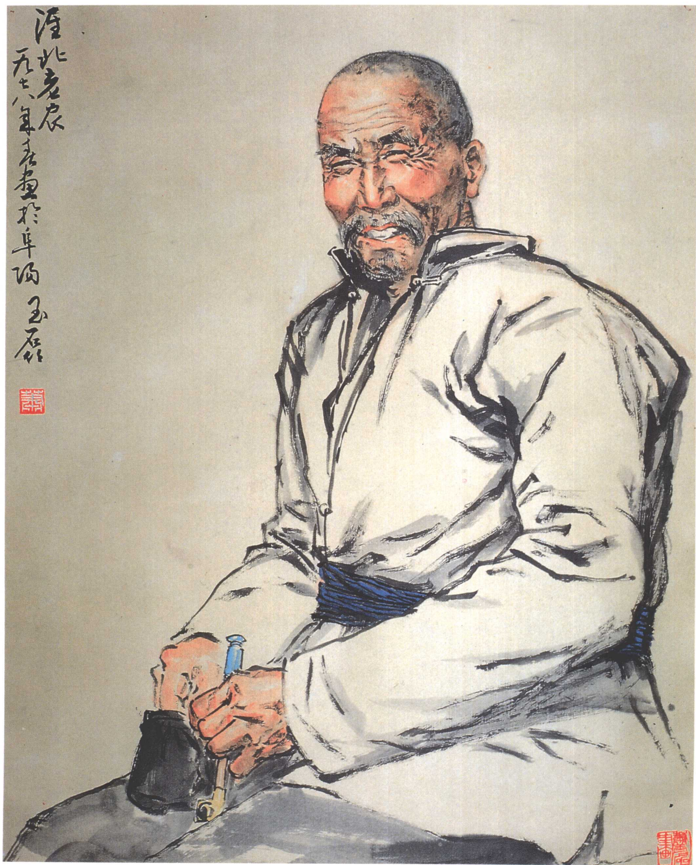
3、淮北老農 68×53 An old peasant in Huaibei