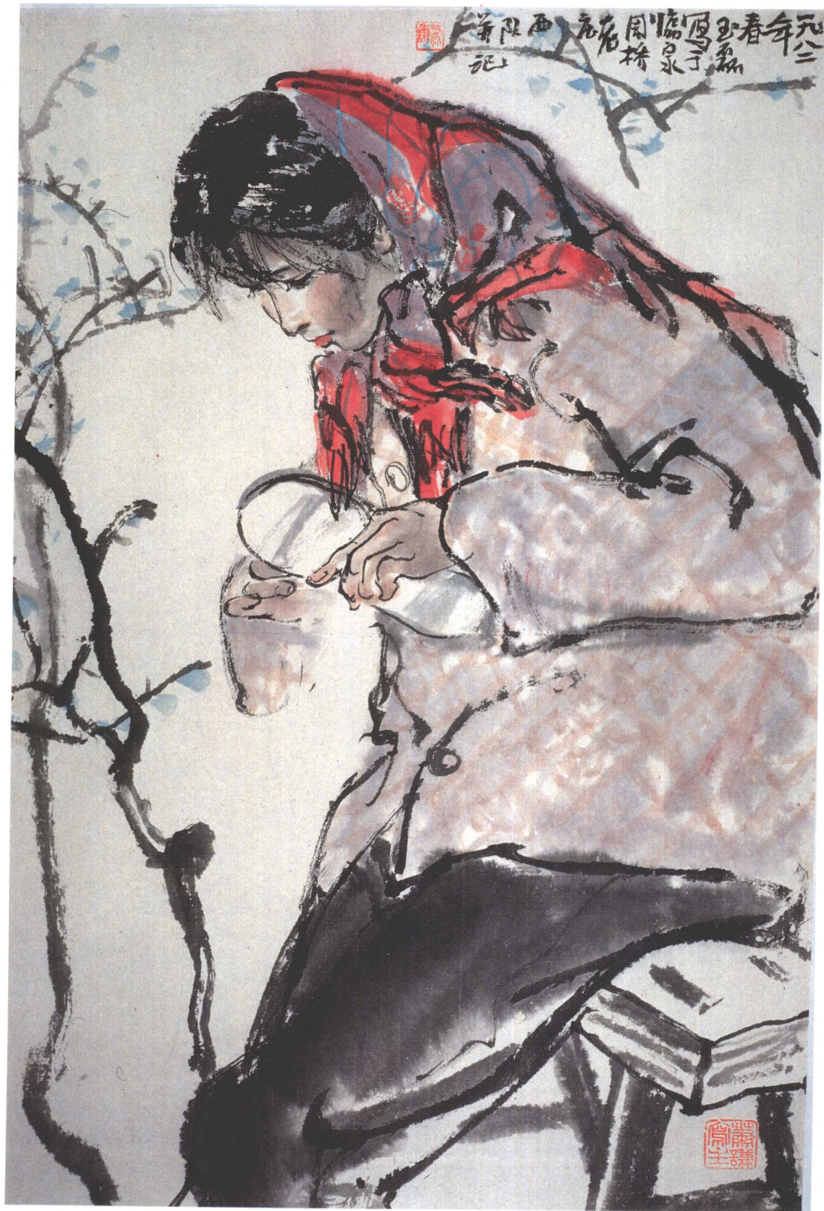
9、春融融 66×46 Spring time