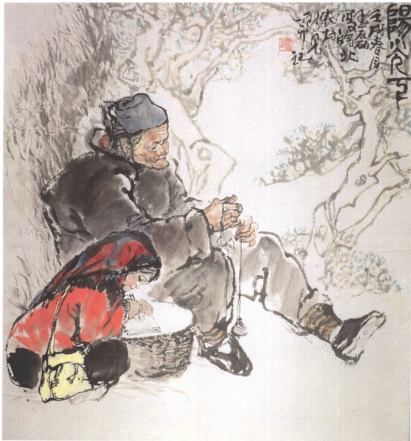
7、陽光下 96×87 Under the sunshine