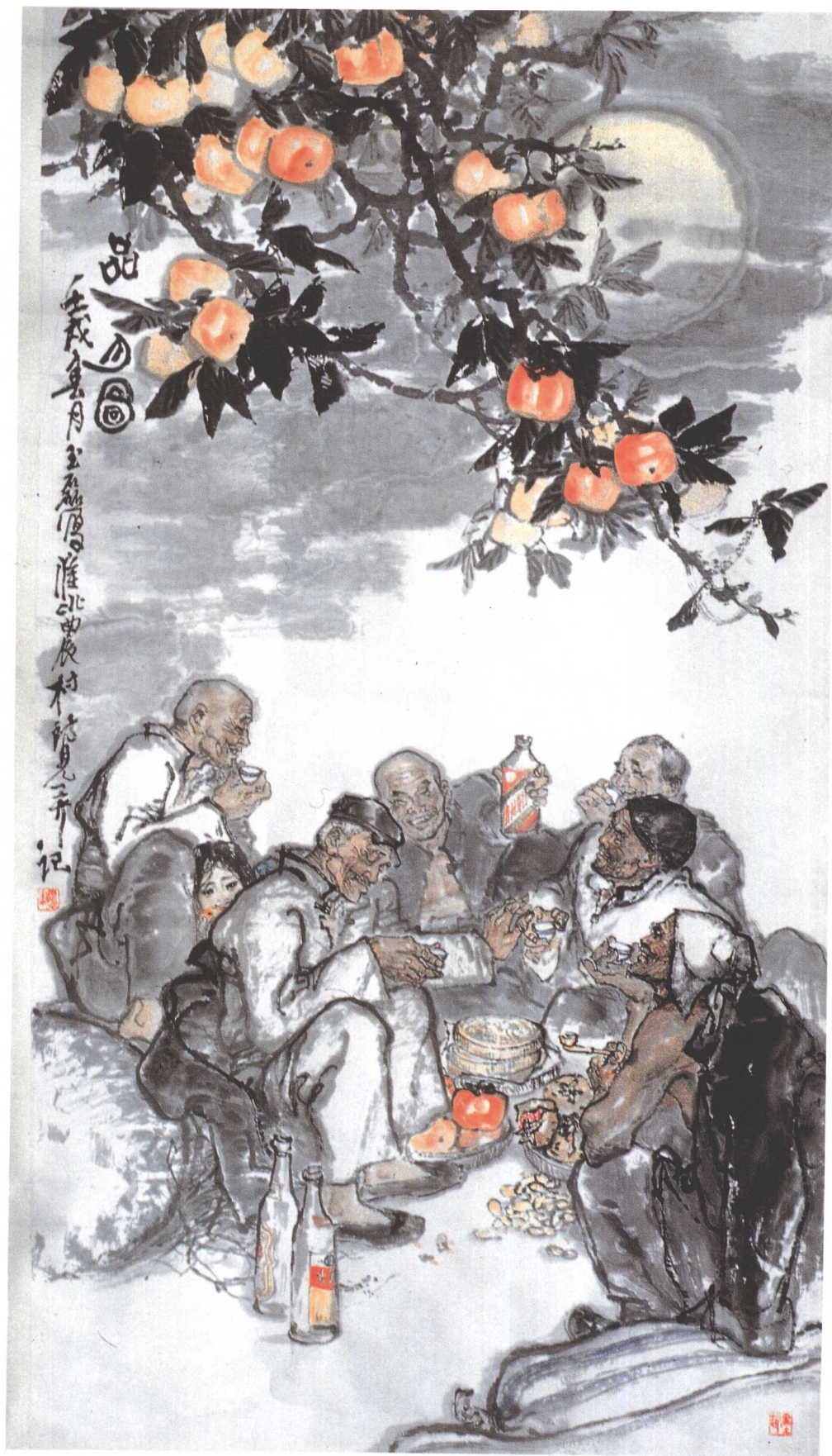
10、品月圖 180×97 Savor the moon