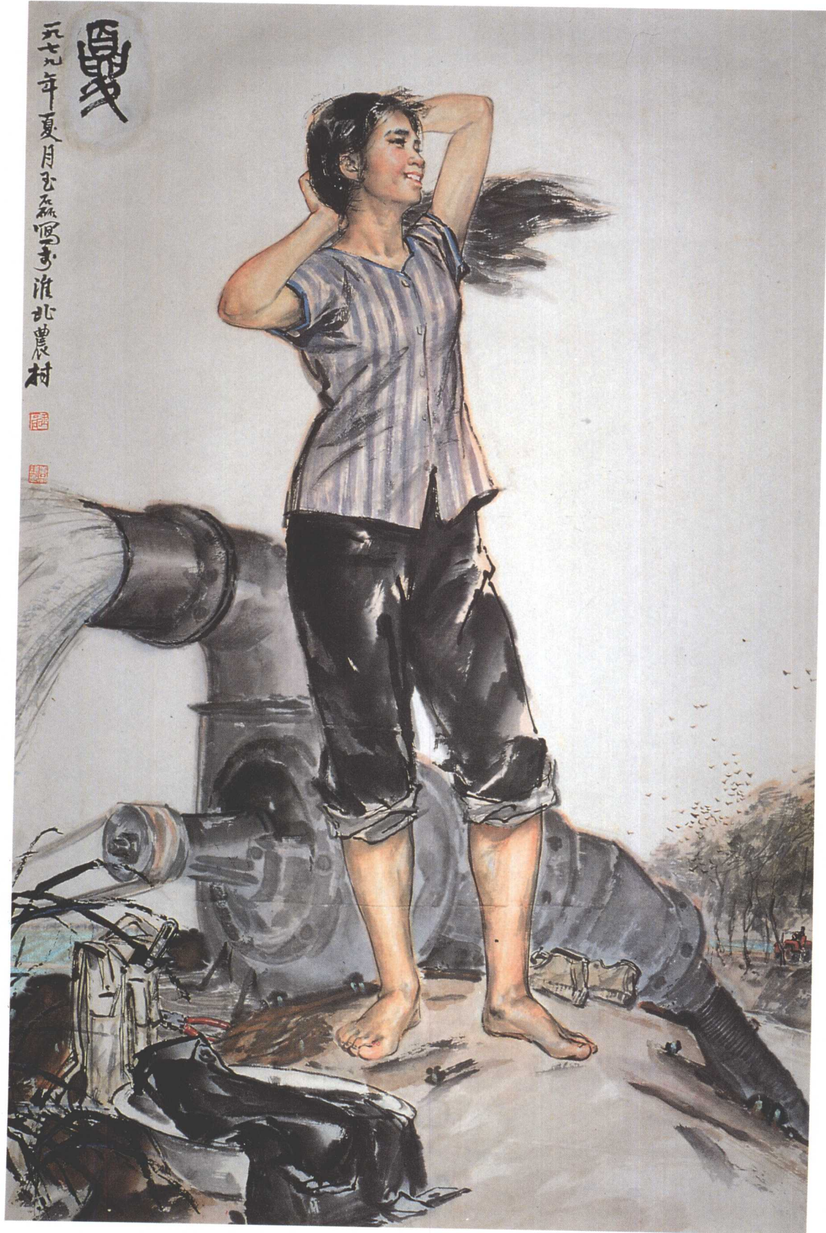
6、夏 126×86 Summer