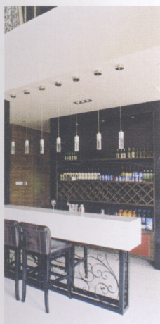
208 云亩天朗 Yun Mu Tian Lang