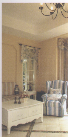
250 天安宏基别墅 Tian'an Hongji Villa