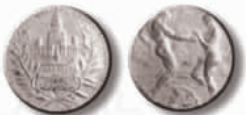
李模父子获得的 1915 年巴拿马万国博览会银质奖章 Li Mo and his son were granted a silver medal in The 1915 Panama Pacific International Exposition

李模(1867—1933)、李时忠(1890—1967)父子是继凤山居士之后的长治堆锦早期传人,他们制作的四季花屏曾获 1915 年巴拿马万国博览会银质奖,从此使长治堆锦蜚声海内外。2006 年,长治堆锦入选山西省首批非物质文化遗产名录。