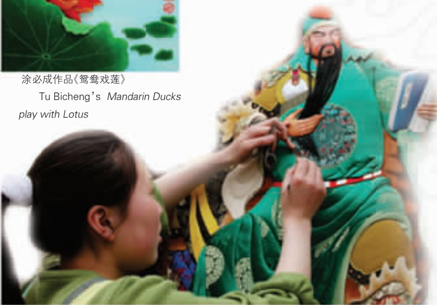
堆锦艺术后继有人 Successors of piled brocade