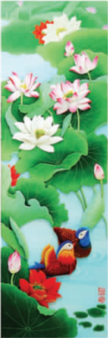
涂必成作品《鸳鸯戏莲》 Tu Bicheng's Mandarin Ducks play with Lotus