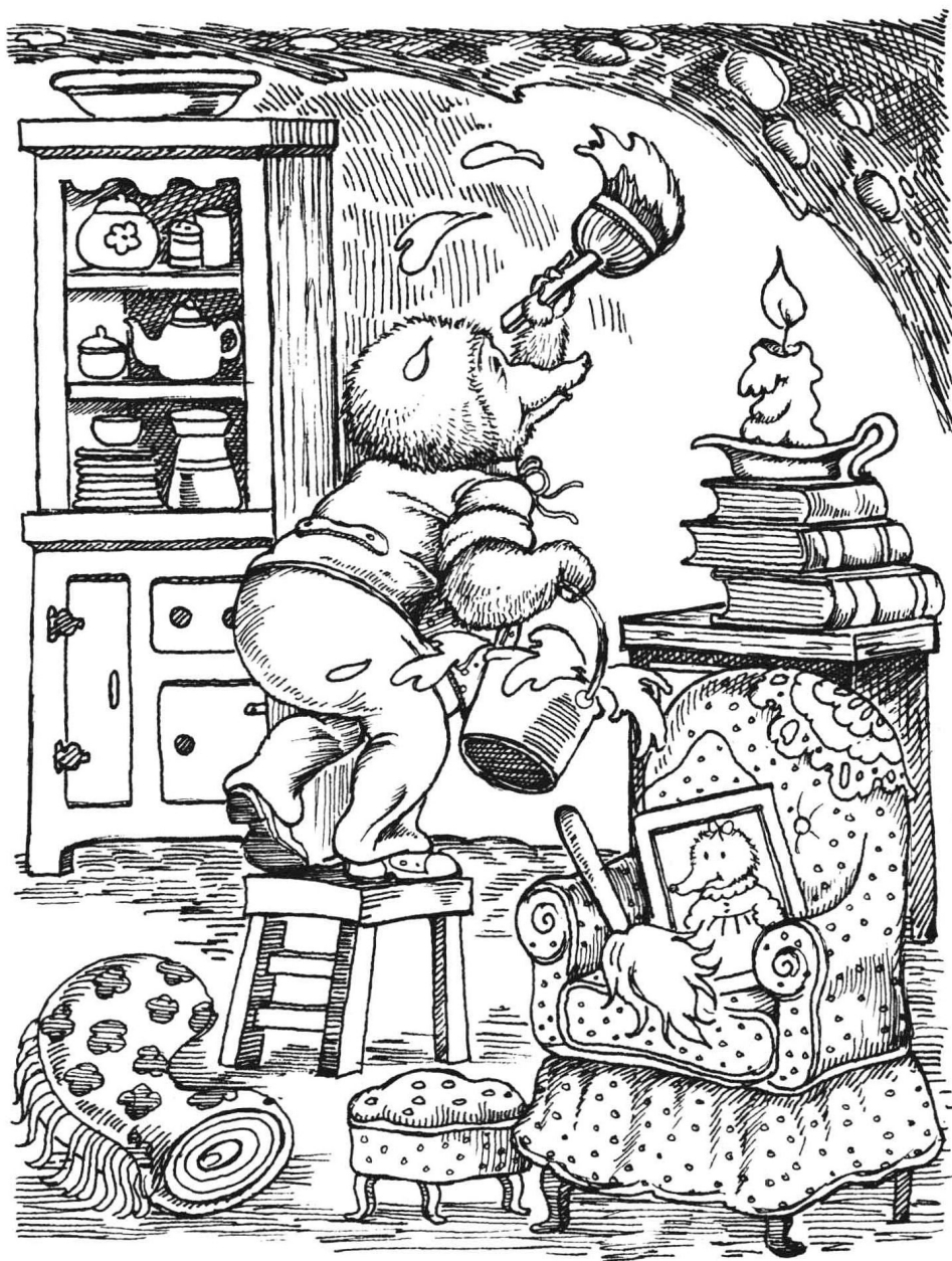
Brooms and Dusters and Whitewash