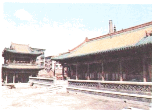
实 胜 寺