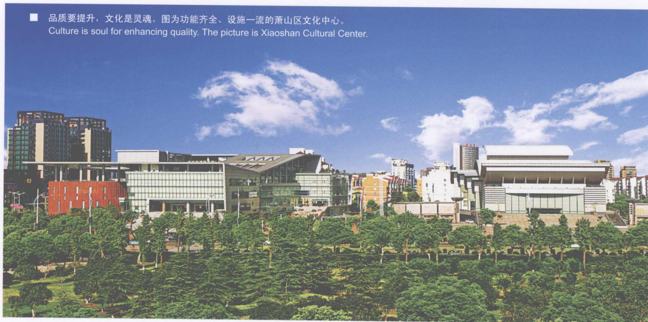
■ 品质要提升，文化是灵魂。图为功能齐全、设施一流的萧山区文化中心。 Culture is soul for enhancing quality. The picture is Xiaoshan Cultural Center.