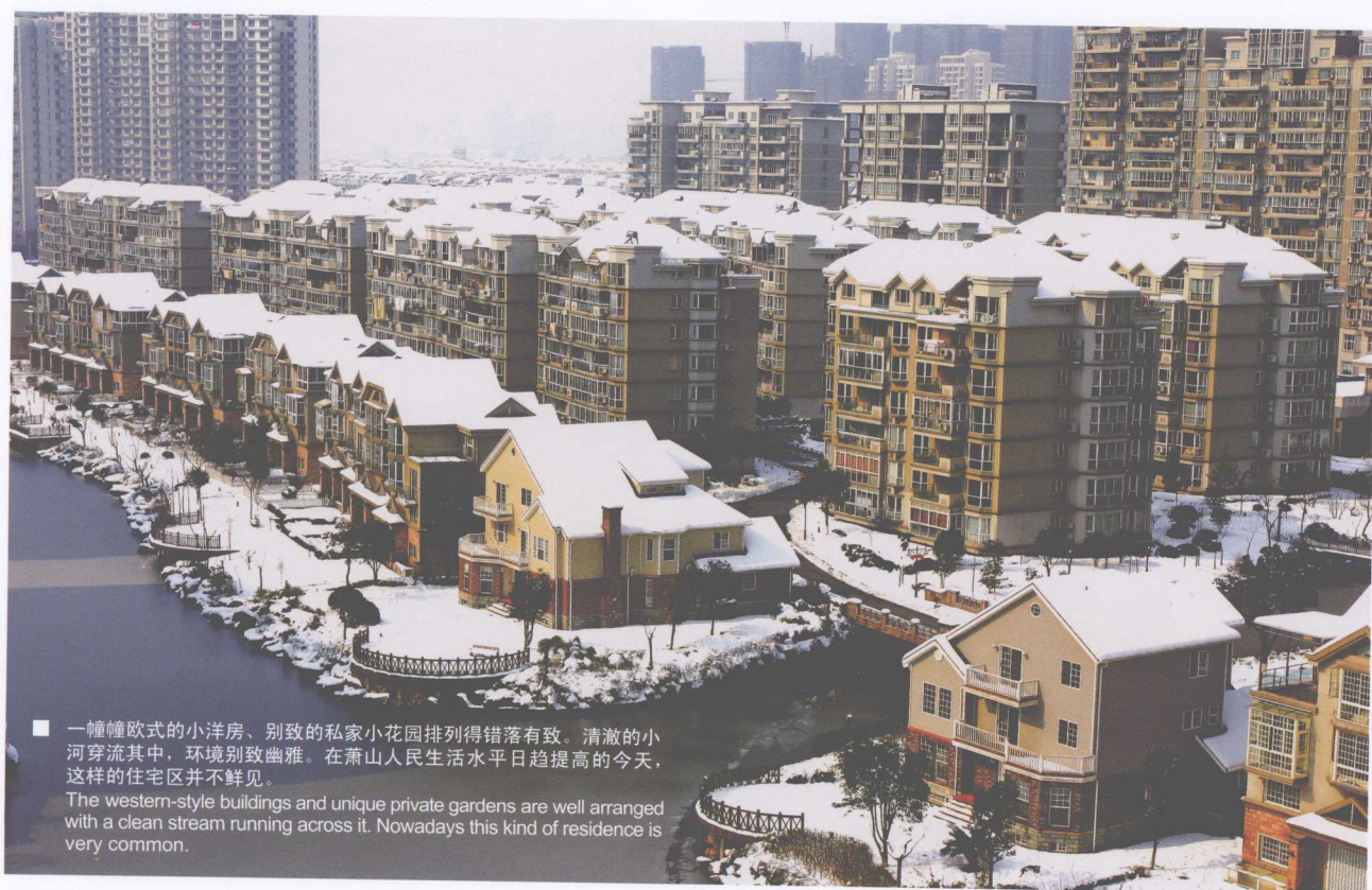
■ 一幢幢欧式的小洋房、别致的私家小花园排列得错落有致。清澈的小河穿流其中，环境别致幽雅。在萧山人民生活水平日趋提高的今天，这样的住宅区并不鲜见。 The western-style buildings and unique private gardens are well arranged with a clean stream running across it. Nowadays this kind of residence is very common.

城市历史文化载体有很多，历史建筑是其中之一。城市历史建筑是指一定历史时期内建造的、具有代表性的建筑。因此，保护历史建筑已经成为人们的共识。如位于老城区内已为数不多的传统民居，还有城区中心地段的杭州发电设备厂、杭州齿轮箱厂的部分老厂房。这些厂房建于1958年，已有近50年的历史，建筑技术上采用大型钢筋混凝土排架结构，清水墙围护。对这些厂房目前也面临着拆除的问题。我们认为，对这些厂房的整体拆除应慎重。因为这些厂房已有一定的历史年份（杭州规定50年以上的建筑为保留建筑），是萧山近现代工业文明的象征，具有一定的保留价值。因此，可以结合新区步行街的建设规划，选择有代表性的厂房建筑予以保留。这些厂房不仅可以用作大型的工商展览，还可以为我们这座城市增添历史的厚重感。