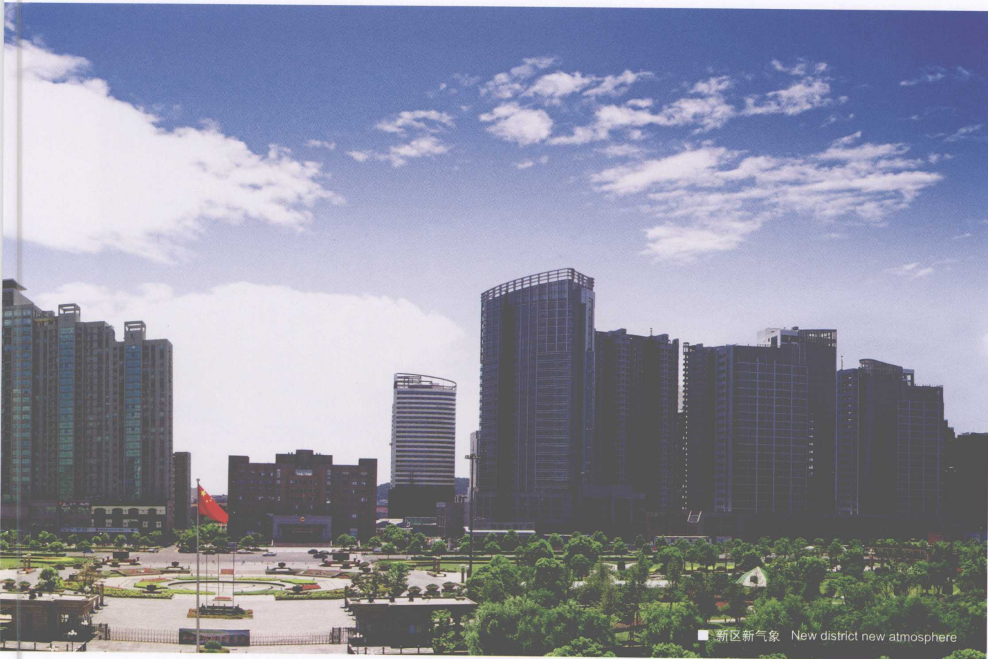
■ 新区新气象 New district new atmosphere

要完善城市基本功能。一是市场、商业功能。萧山区具有独特的交通优势，这是办市场和做商业最好的条件。二是居住、旅游功能。由于萧山区城区拥有独特的地理位置和地形地貌条件，特别是城区南部地区有山有水，是发展居住和旅游的极好区域。三是教育、体育功能。这两项功能，从城区和区内各区块来看，教育功能是不平衡的，