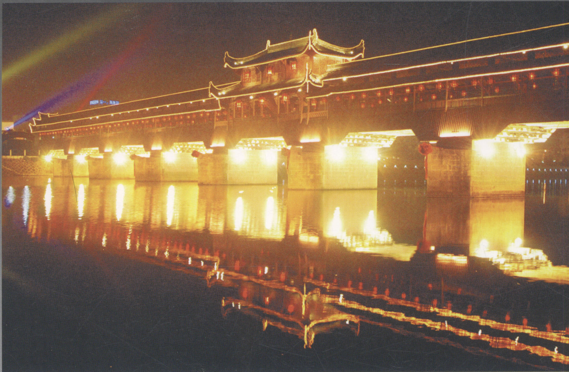
廊桥金梦 The golden dreams of The Shuxi Bridge

The Shuxi Bridge belongs to the provincial cultural relics under state protection and is the artistic treasure in China's existing ancient bridge architecture praised as "a treasure in south of the Yangtze River".