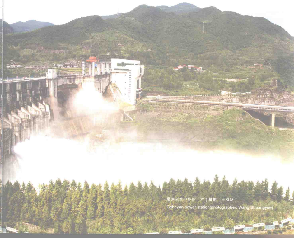
隔河岩水电枢纽工程