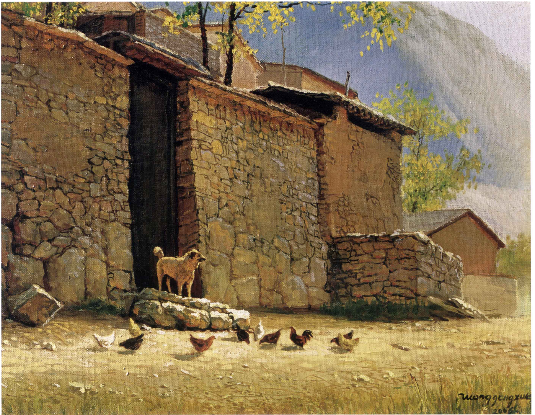
守候 The Guardian