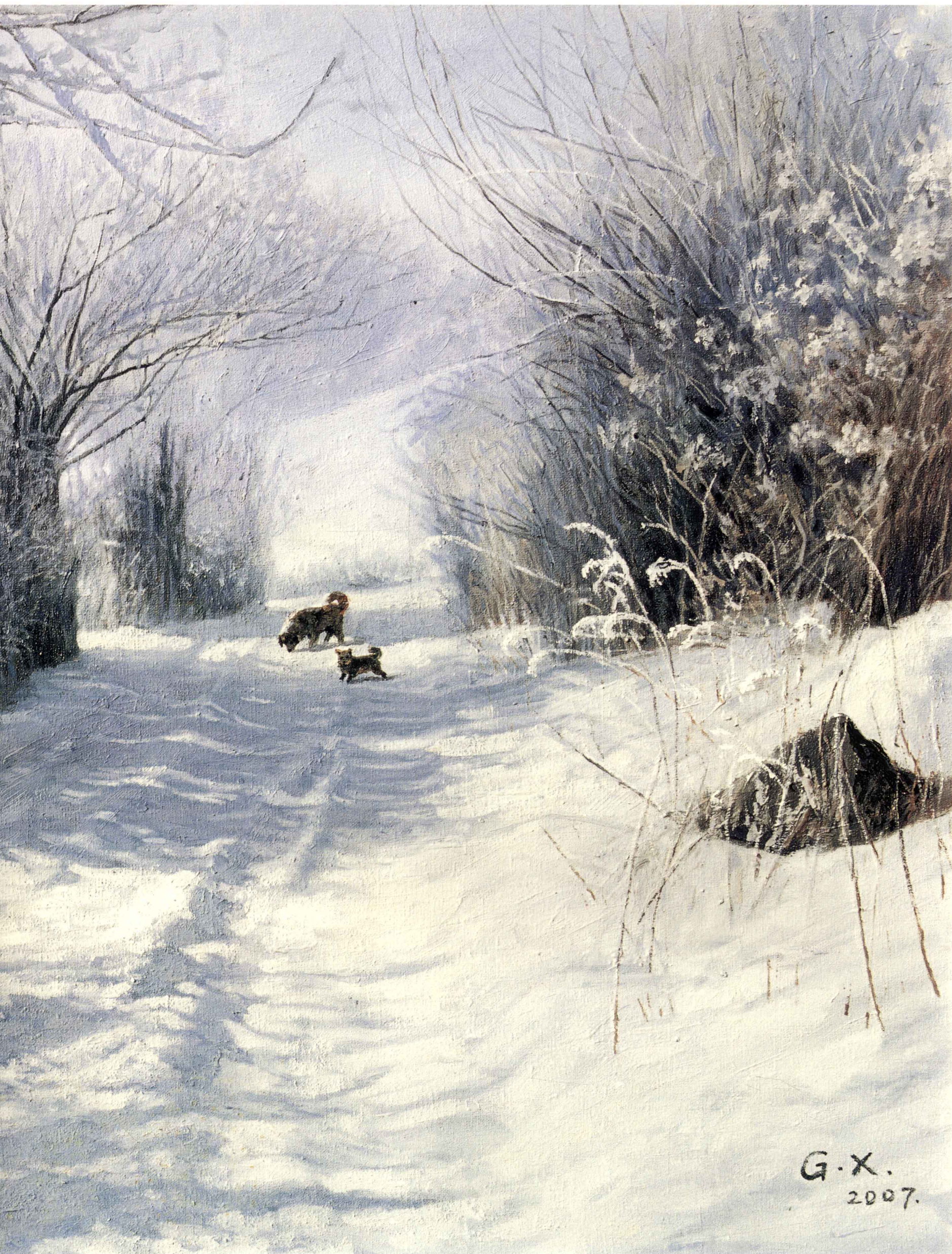
冬夢 Dream of Winter