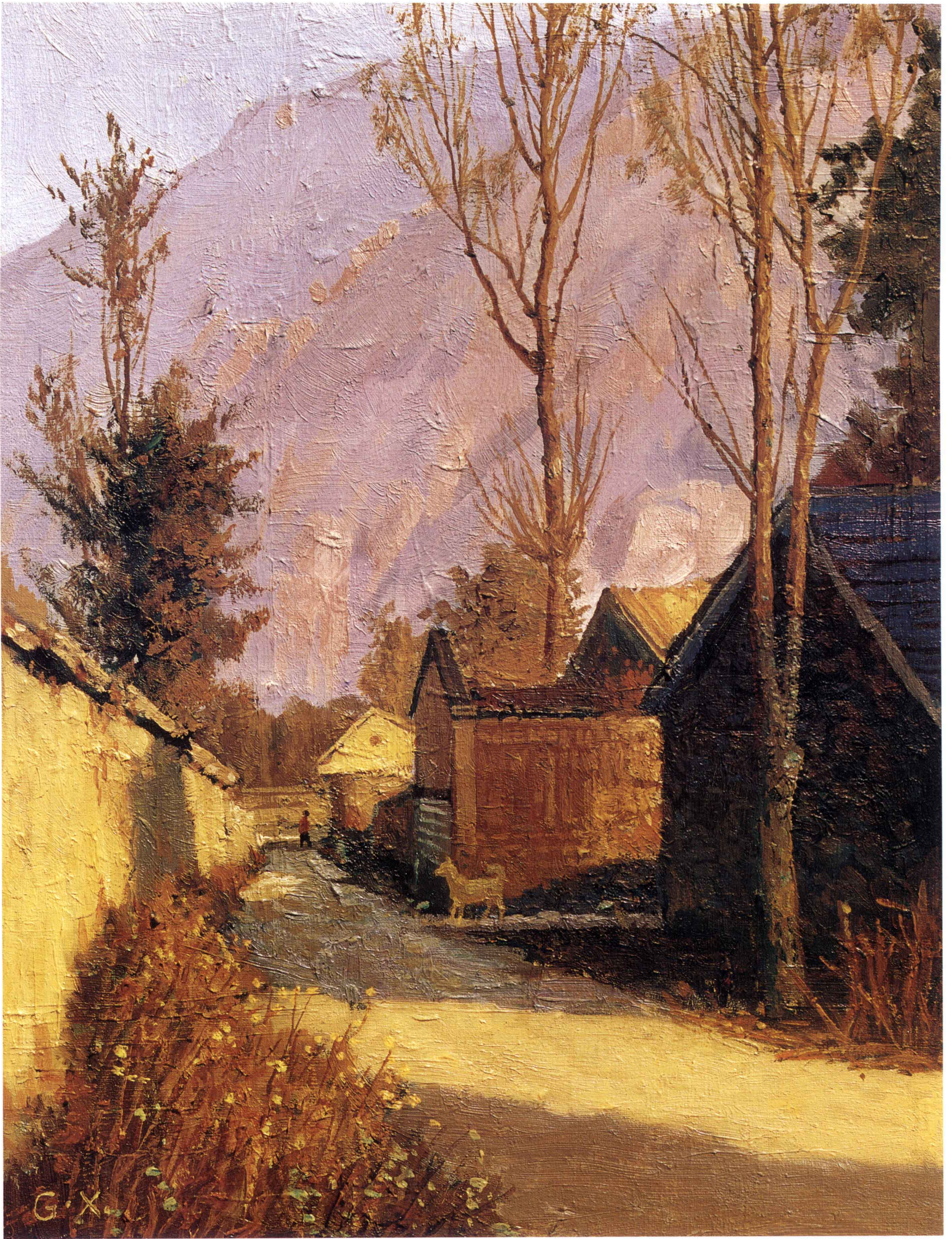
午後 Scenery of Afternoon