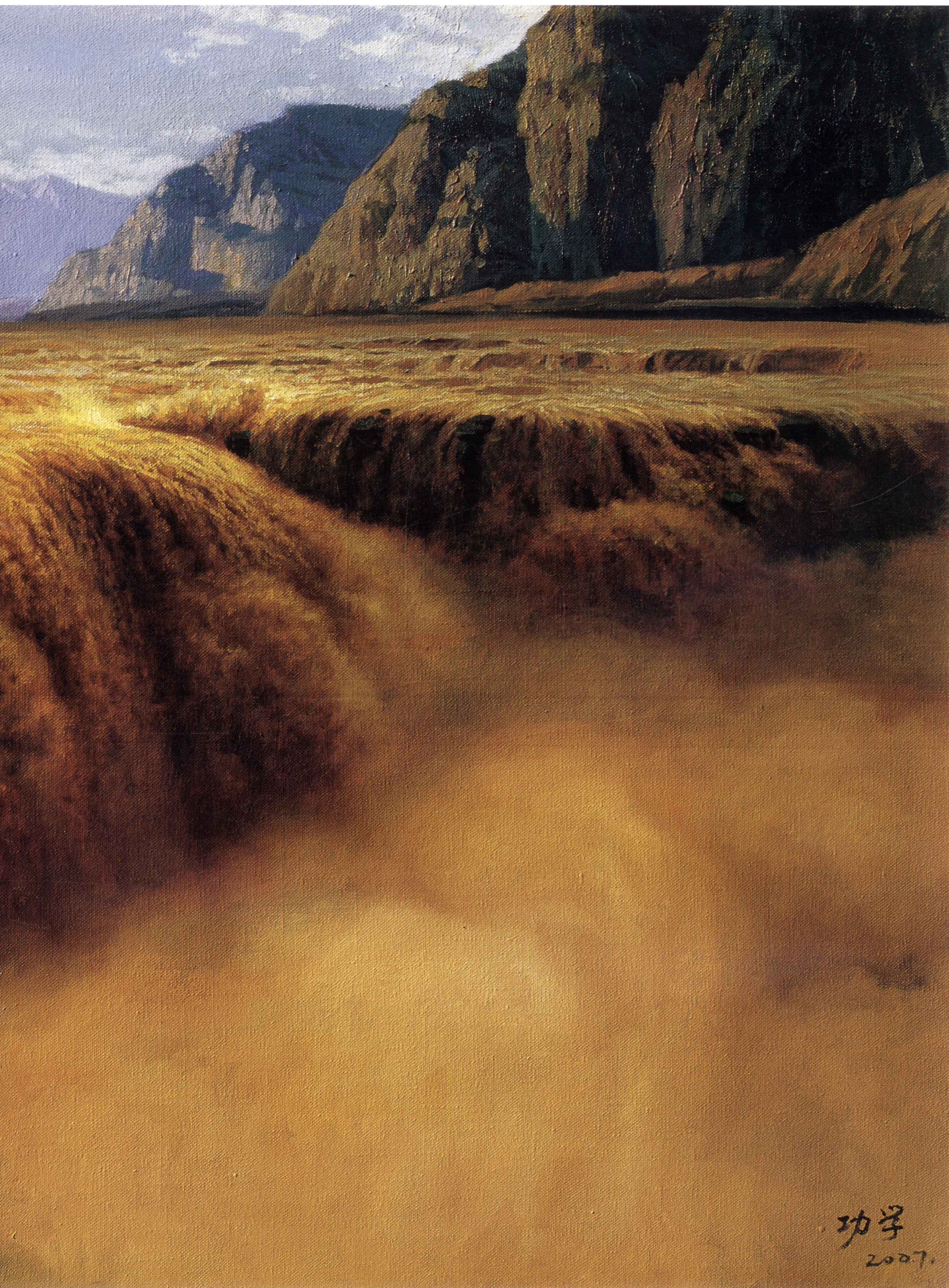
壺口轟鳴 Roaring of Hukou Waterfall