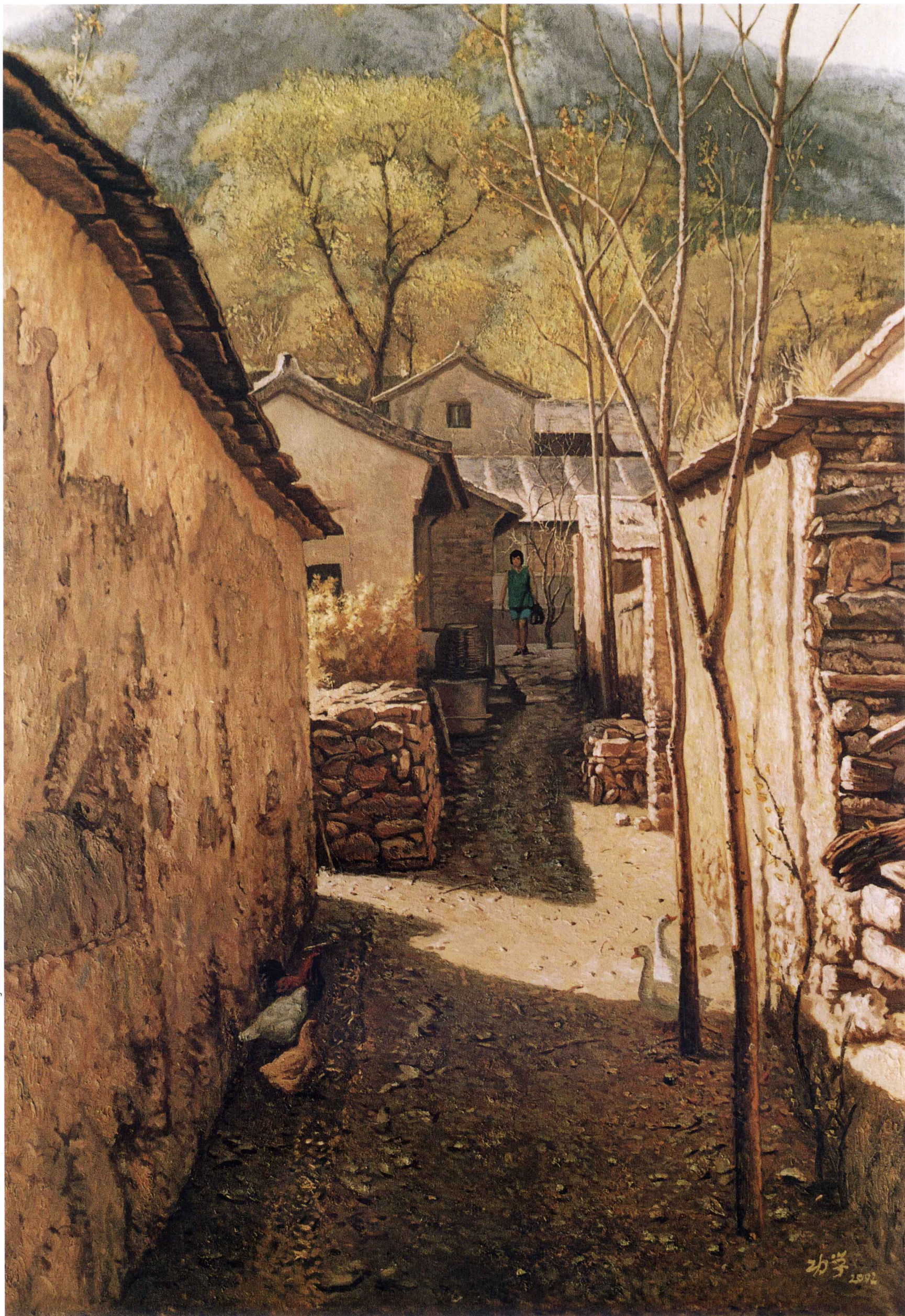
村巷 Lane of the Village