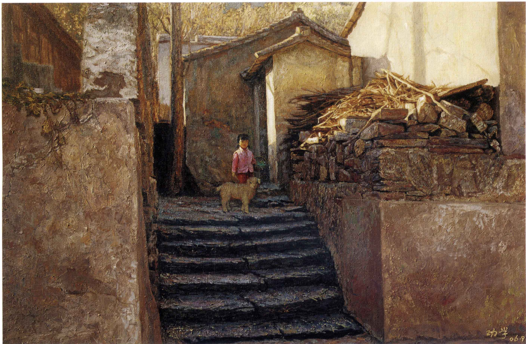
京郊晨光 Sunlight Scene in the Suburb of Beijing