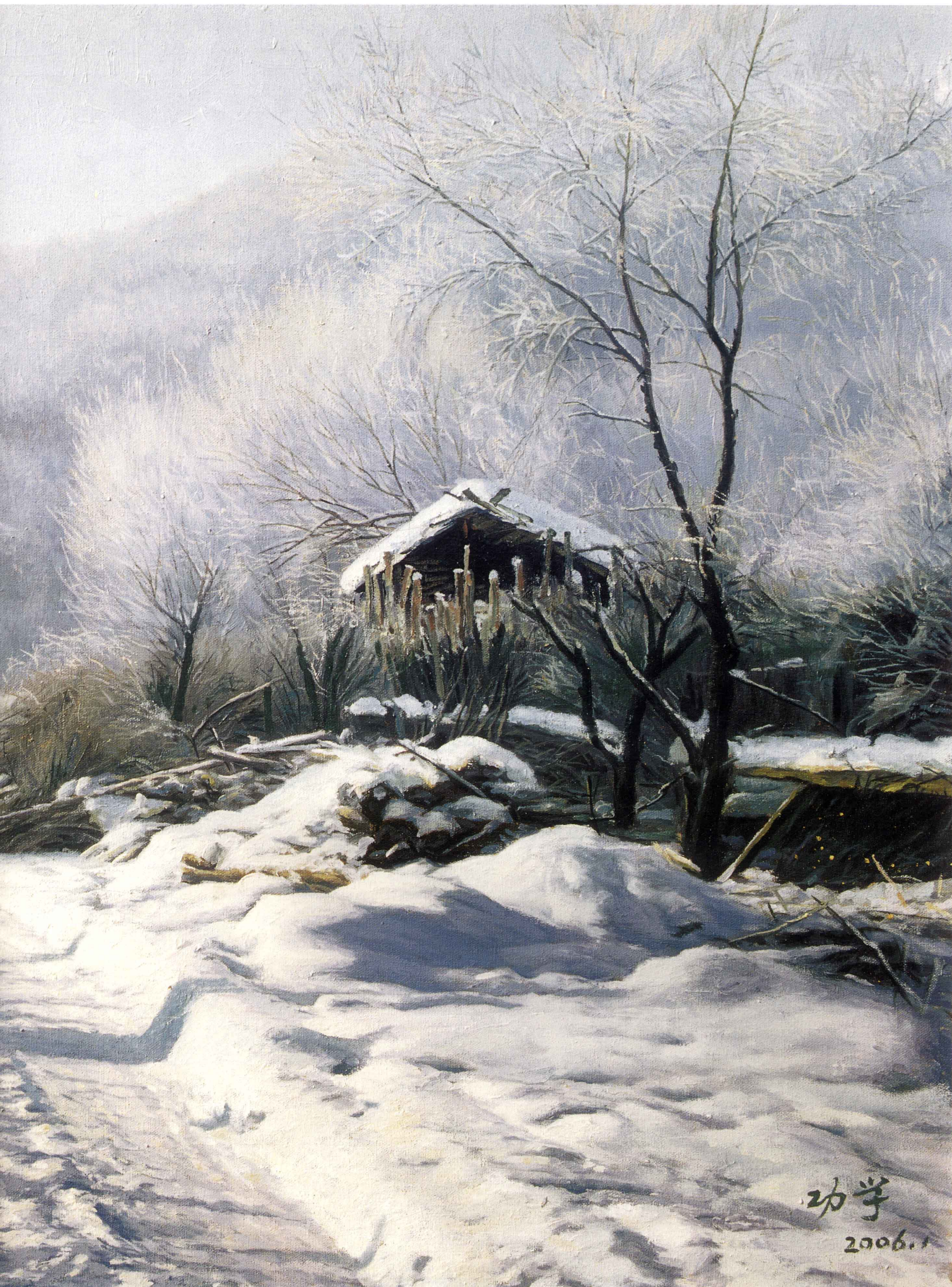
冬日陽光 Sunlight in Winter