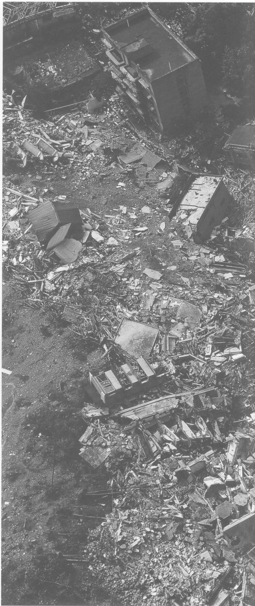
俯瞰北川县城 Ariel View of Beichuan County