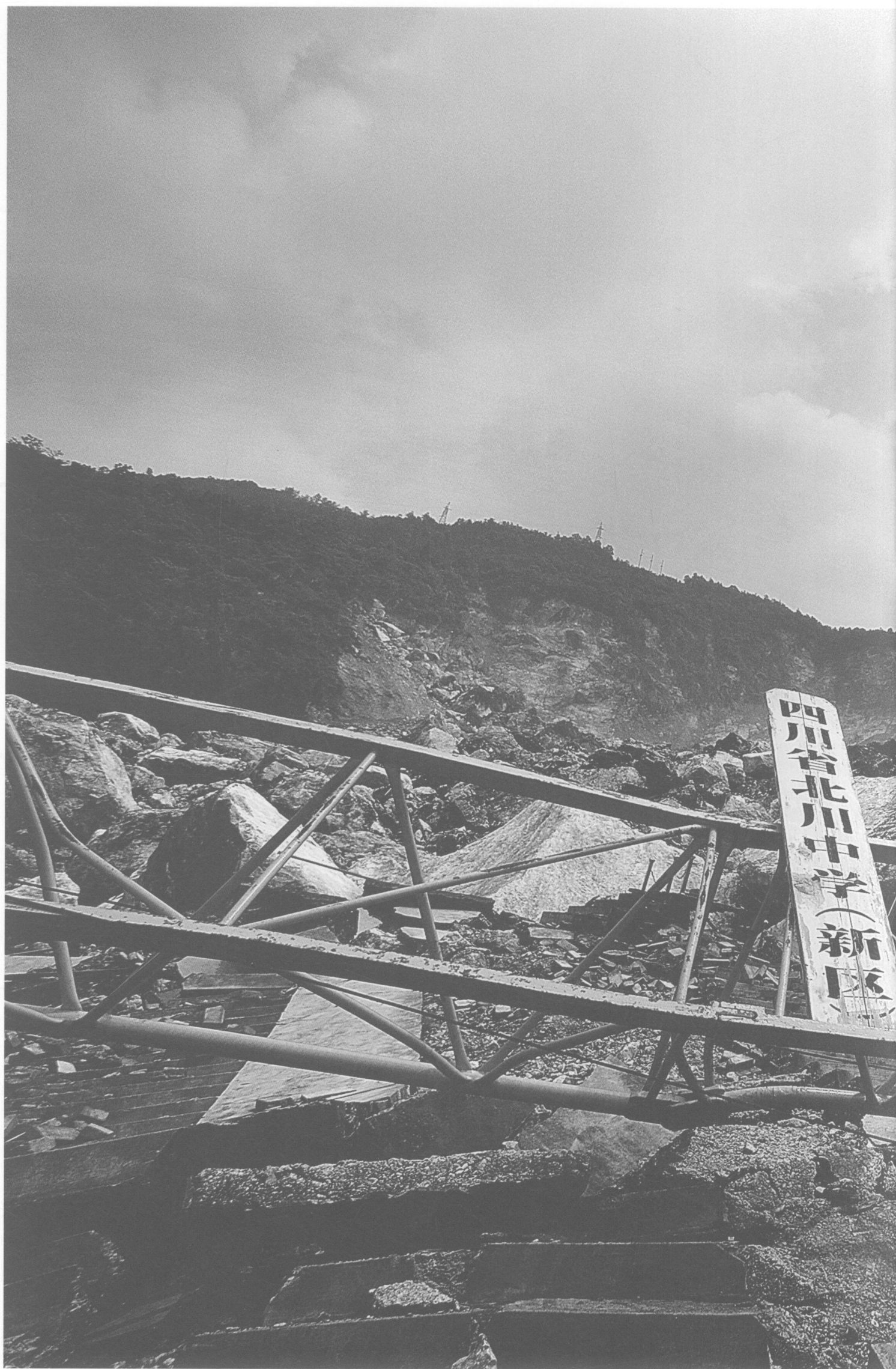
震后北川中学 Beichuan Middle School After the Quake