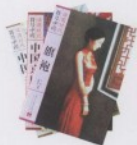
24 三本书 sān běn shū three books