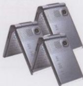
22 三部手机 sān bù shǒujī three cellphones