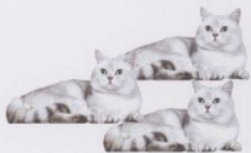
21 三只猫 sān zhī māo three cats