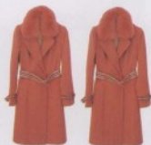
13 两件大衣 liǎng jiàn dàyī two overcoats