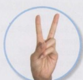
二 èr two