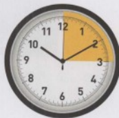
一刻钟 yí kèzhōng a quarter of an hour