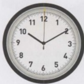
一秒钟 yì miǎozhōng one second