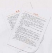
15 两篇文章 liǎng piān wénzhāng two articles