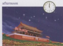
午夜 wǔyè midnight