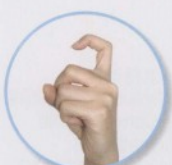
九 jiǔ nine