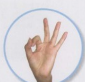
三 sān three