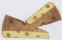
17 两块奶酪 liǎng kuài nǎilǎo two pieces of cheese