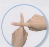
十 shí ten