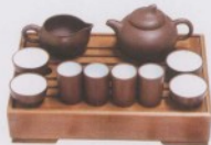
6 一套茶具 yí tào chájù one tea set