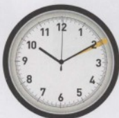
一分钟 yì fēnzhōng one minute