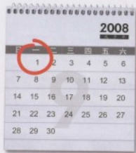
一天 yì tiān one day