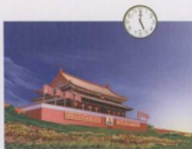
黎明 límíng dawn