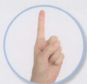
一 yī one