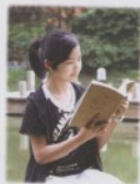
3 一个女生 yí gè nǚshēng one girl