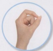
零 / 〇 líng zero