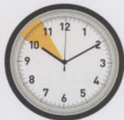
一小时/一个钟头 yí xiǎoshí/yí gè zhōngtóu one hour