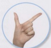
八 bā eight