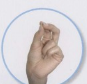
七 qī seven