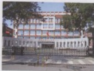
2 一所学校 yì suǒ xuéxiào one school