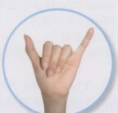
六 liù six