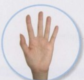
五 wǔ five