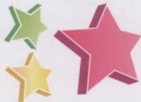
20 三颗星星 sān kē xīngxīng three stars