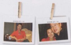
12 两张照片 liǎng zhāng zhàopiàn two photographs