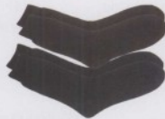
19 两双袜子 liǎng shuāng wǎzi two pairs of socks