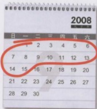
半个月 bàn gè yuè half a month