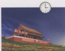
凌晨 língchén the wee hours