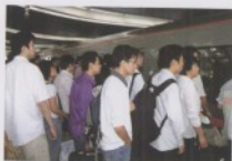
5 一帮人 yì bāng rén one group of people