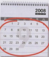
一个月 yí gè yuè one month