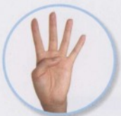
四 sì four