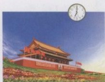
早上/早晨 zǎoshang/zǎochén early morning