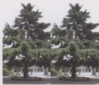
16 两棵树 liǎng kē shù two trees