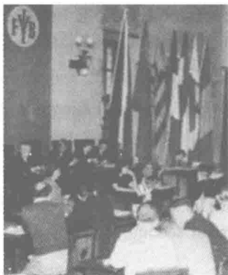
The Founding of FIVB in 1947