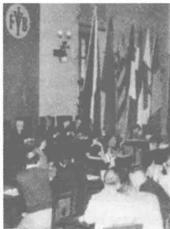
The 1947 Founding of FIVB