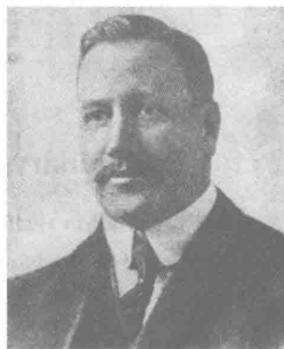
William G. Morgan

William G. Morgan met James Naismith [3] , inventor of basketball, when Morgan was studying at Springfield College, Massachusetts in 1892. Morgan pursued his whole career in Physical Education at the YMCA. Influenced by Naismith and basketball, in 1895, in Holyoke, Massachusetts, Morgan invented "Mintonette" [4] a less rough indoor team sport more suitable for older members of the YMCA to play, while still requiring a bit of athletic efforts.