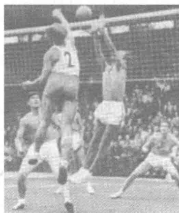
The 1949 World Championships

At its third congress in 1951, the FIVB decided that a player's hand could "invade" at the net during blocking, but only in the final phases of spiking. Furthermore, a back-line player could spike, providing that he remains in his zone and does not move up to the front line. China began to participate in international tournaments. The first