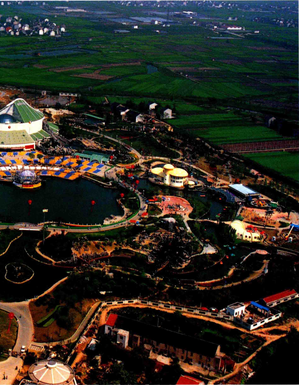
中华恐龙园 China Dinosaur Park