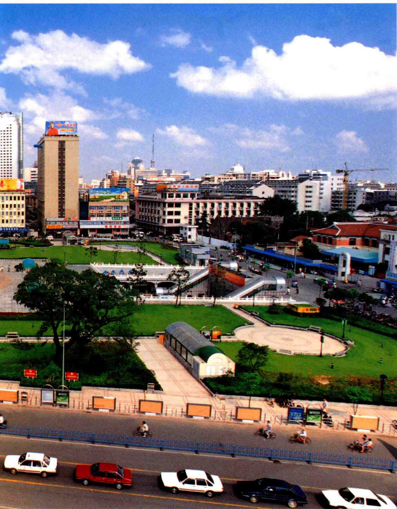
城市新貌 New look of Changzhou