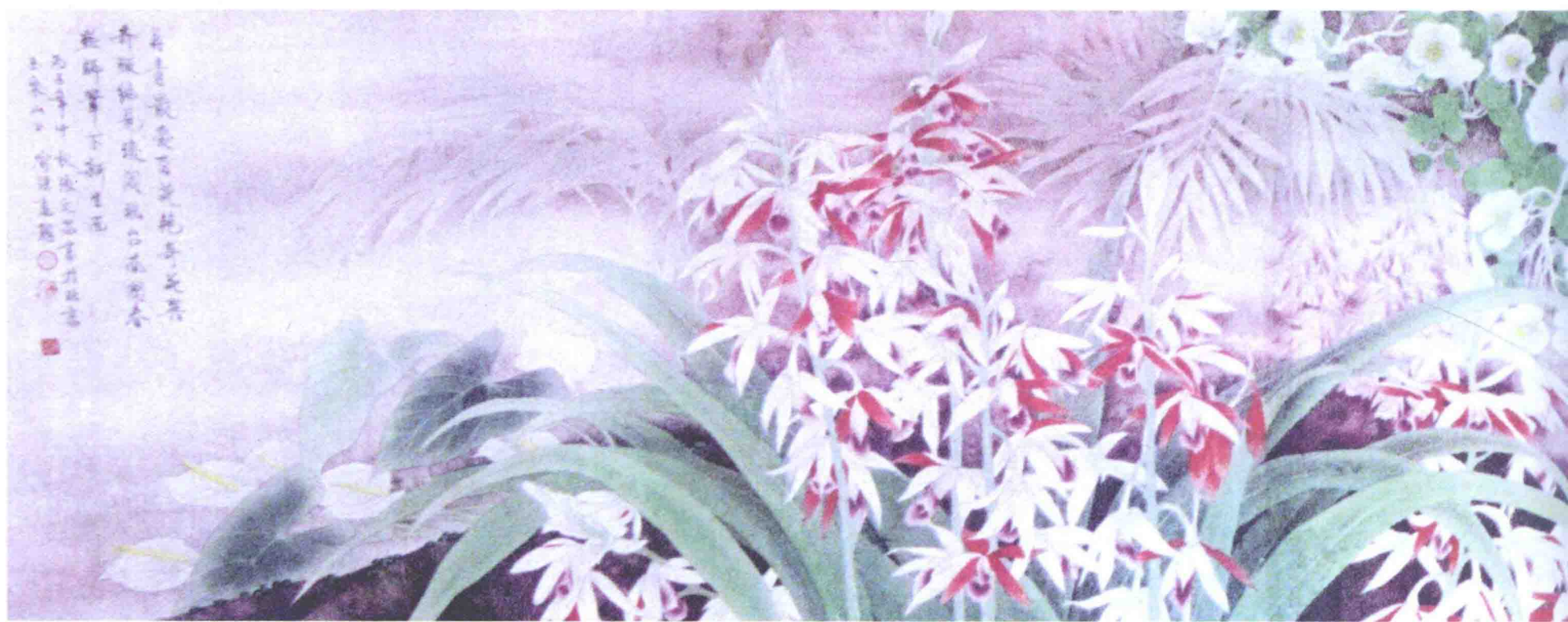
南国三月 69 × 334cm