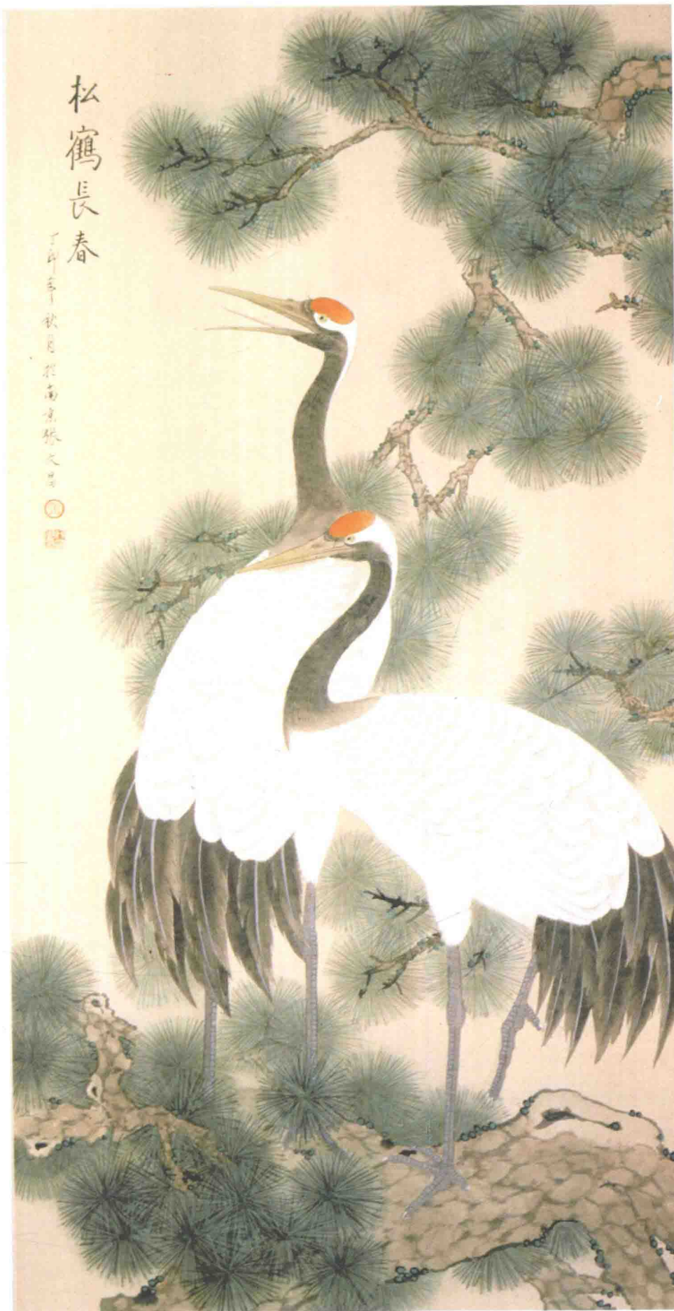
松鹤延年 35 × 69cm

这一份挚爱的守候 震撼心波起落的青阁 如风的长鸣在天空 辐射经心的旅途 那东一朵 西一朵的翠云 透露万千词汇的情调