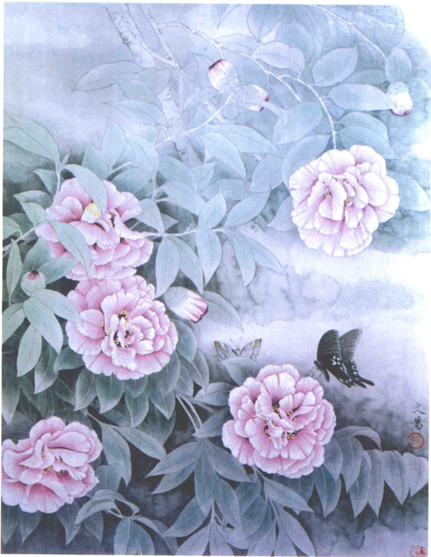
山茶 55 × 76cm