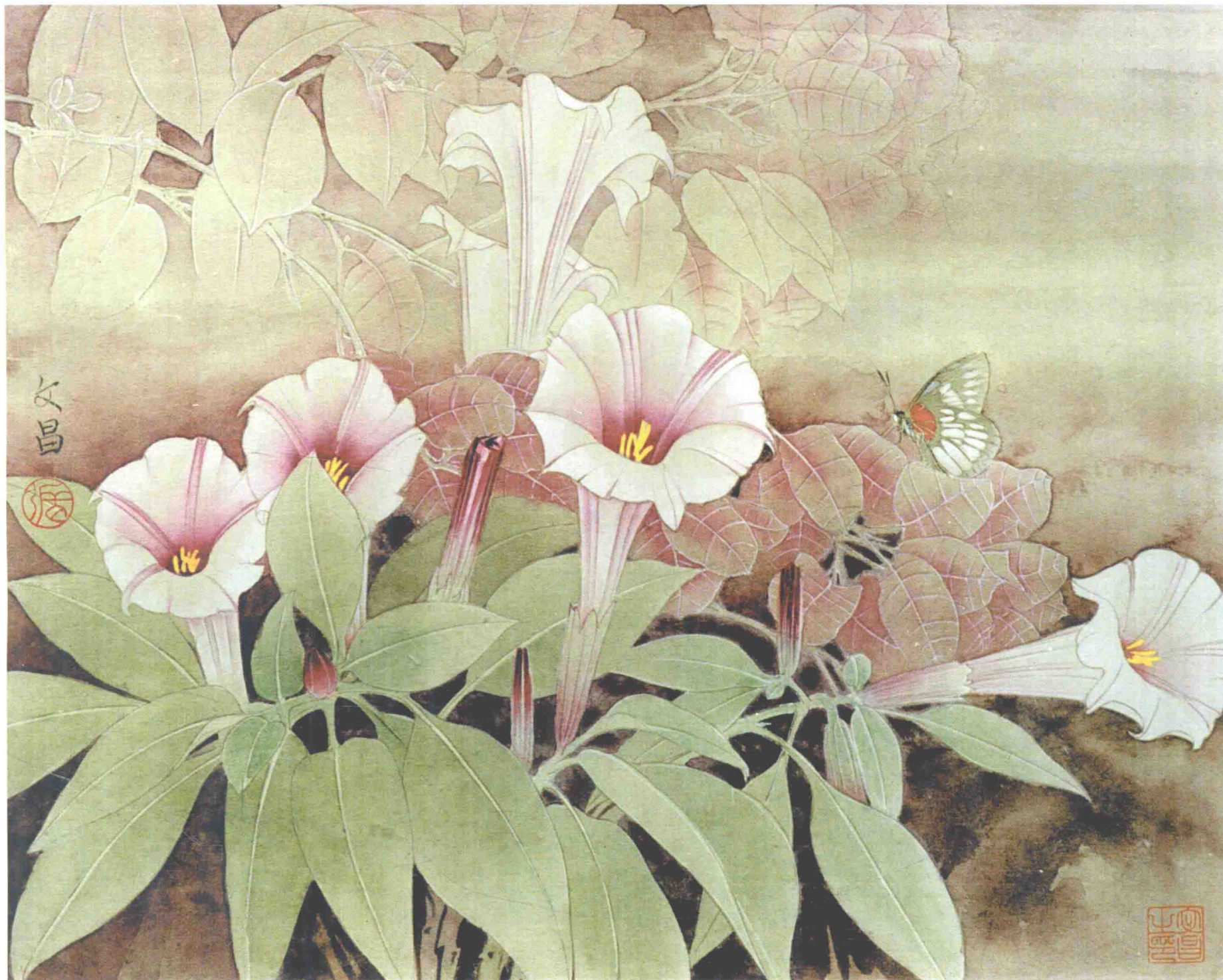
勃勃生机 35 × 45cm