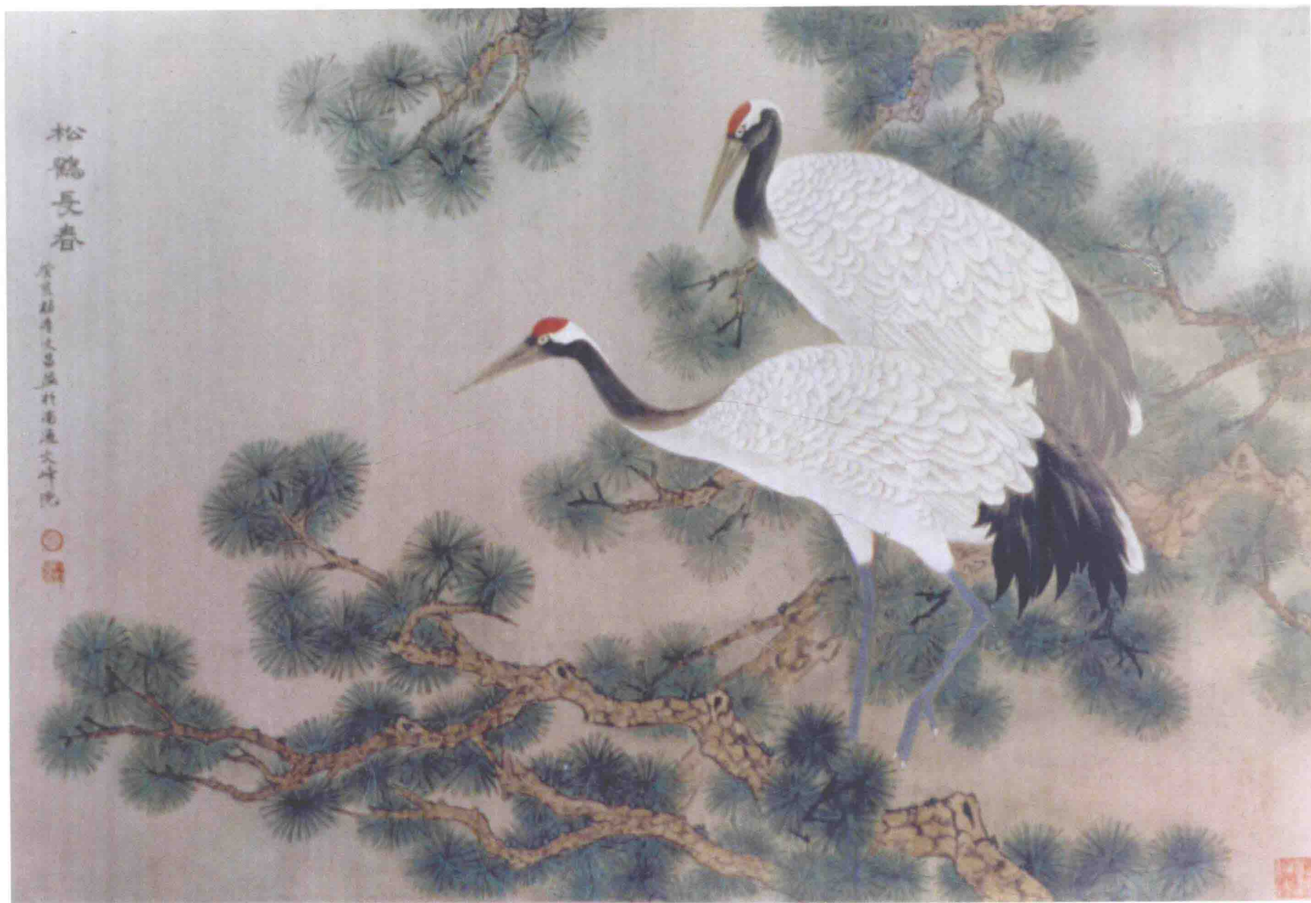
松鹤长春 75 × 150cm