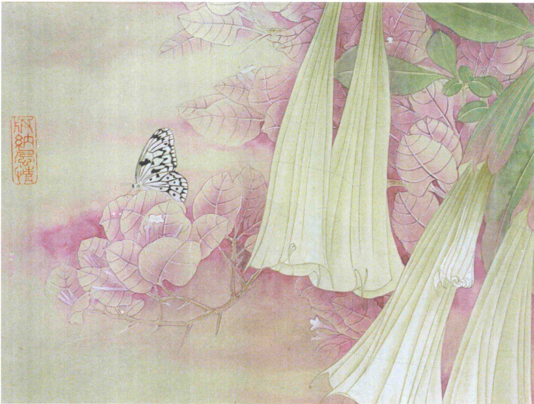
春意盎然 35 × 45cm

保持青春不谢的微笑 犹如一回永恒的吻 神秘的爱潜藏在山野 世界给了一次停留的机会 这些微思 正是绿叶里的花红