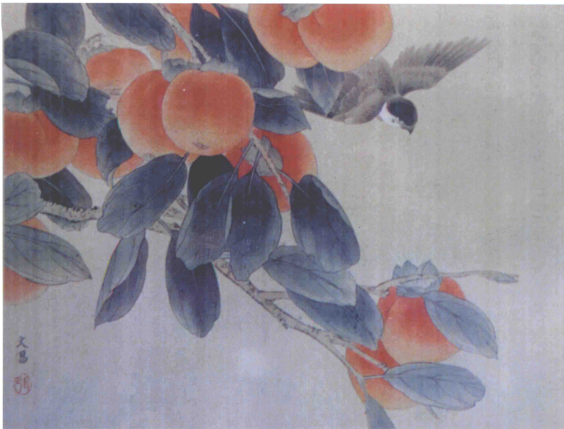
秋艳 35 × 45cm