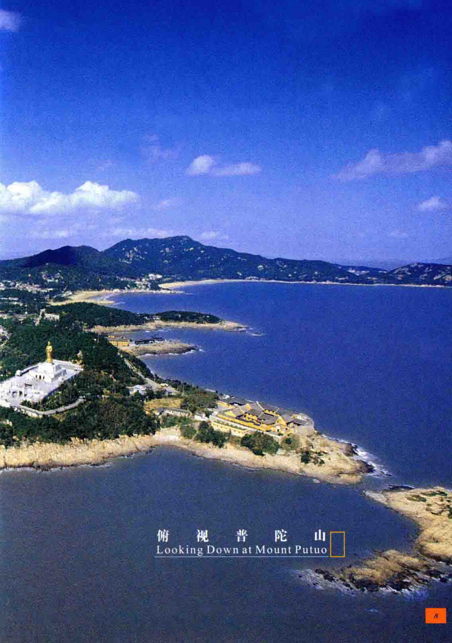
俯 视 普 陀 山 Looking Down at Mount Putuo