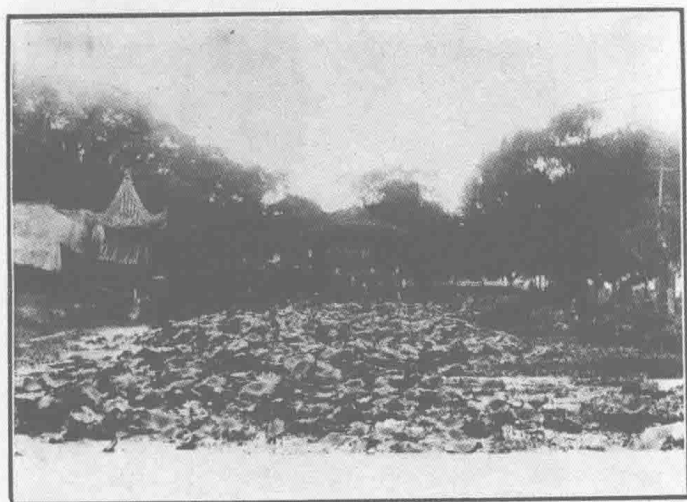
校 景 之 三