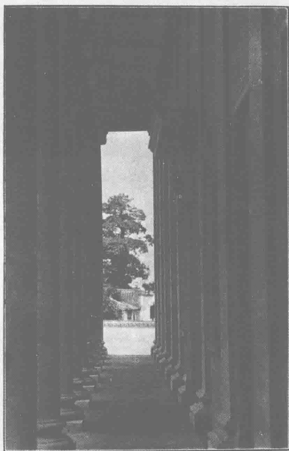
校 景 之 一